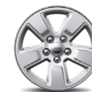
16-inch machine-faced aluminum Sport (Standard)