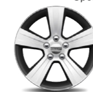
17-inch aluminum with Granite painted pockets High Altitude (Available)