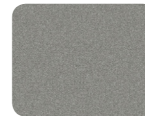
Billet Silver Metallic

*Late availability. †Limited availability. *Restrictions apply. See your retailer for full details.