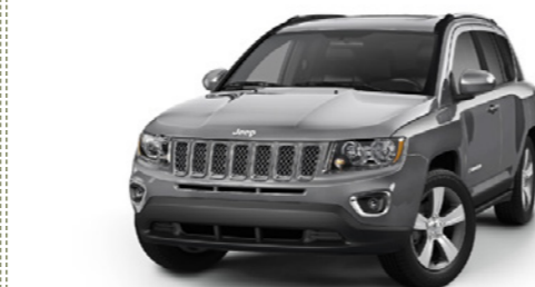
Leather-faced with perforated inserts – Saddle Tan (shown below)