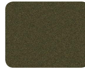
Eco Green Pearl†