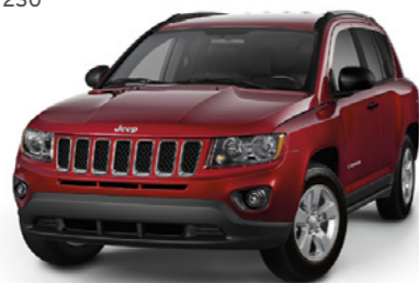
Cloth – Dark Slate Grey (shown below)