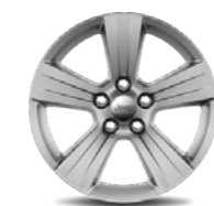
17-inch aluminum High Altitude (Standard) North Edition (Standard) Sport (Available)