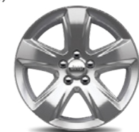
18-inch chrome-clad aluminum High Altitude (Available)