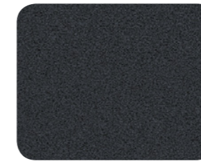
Granite Crystal Metallic