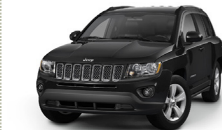
Sport mesh – Light Pebble Beige with Tangerine accent stitching (shown below)