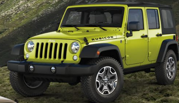
Rubicon shown in Hypergreen.