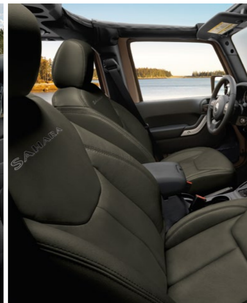
Olive Green/Black interior – Leather, Sahara (Available)