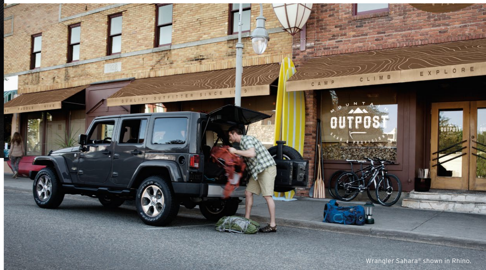
Wrangler Sahara® shown in Rhino.