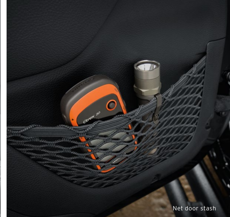
Net door stash