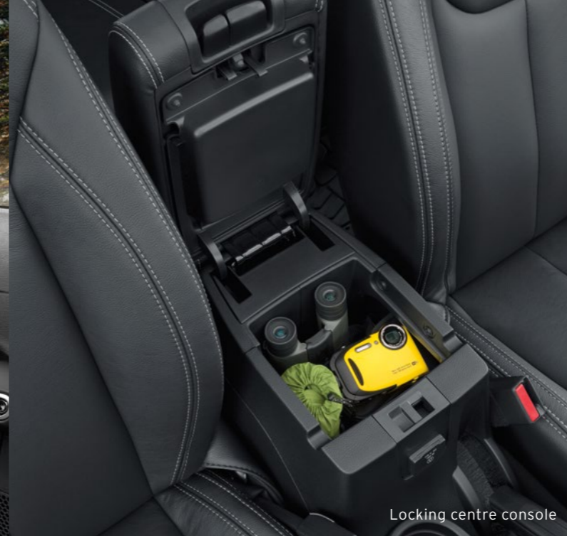
Locking centre console