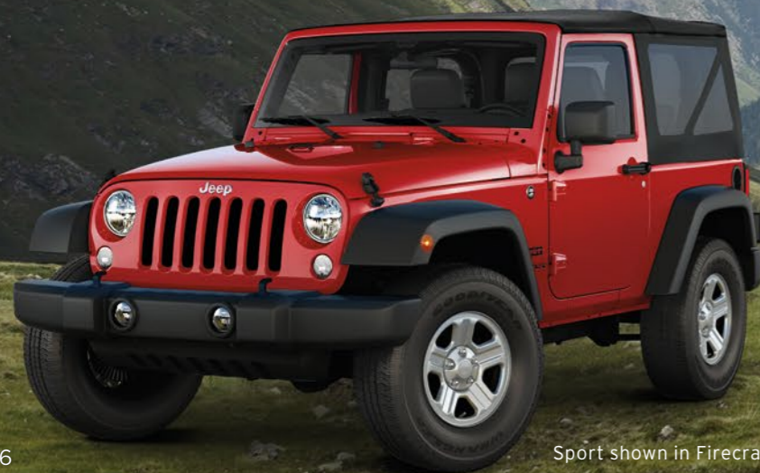
Sport shown in Firecracker Red.