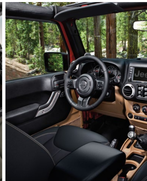
Black/Dark Saddle interior – Cloth, Sahara and Rubicon