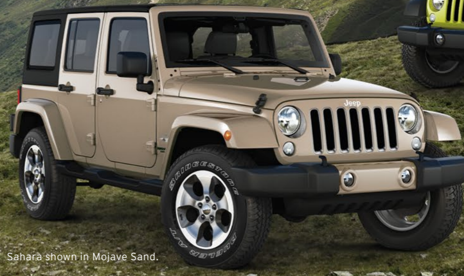
Sahara shown in Mojave Sand.