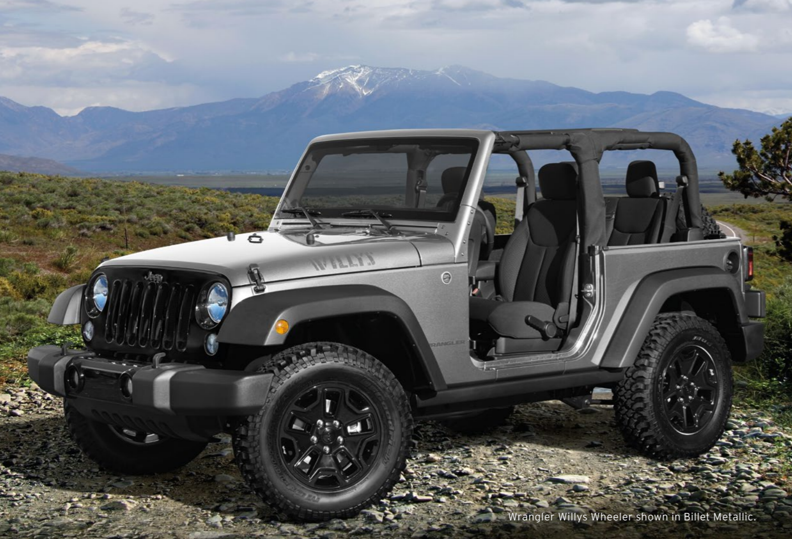
Wrangler Willys Wheeler shown in Billet Metallic.