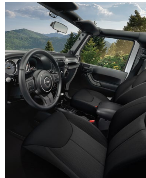
Black interior – Cloth or Leather-faced, all models 18