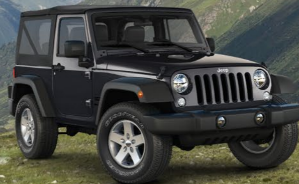
Sport S shown in Rhino.