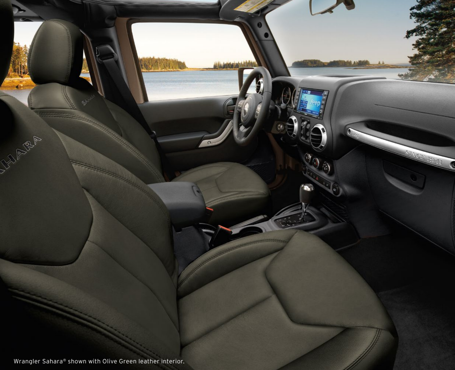
Wrangler Sahara® shown with Olive Green leather interior.