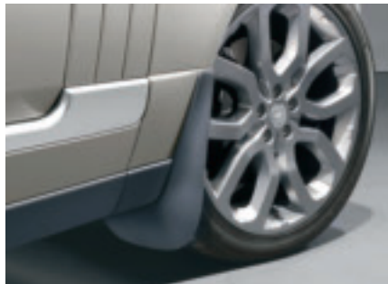
Front Mudflaps Mudflaps help reduce spray and help protect the paintwork. Supplied as a pair.