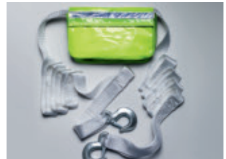
Tow Recovery Strap Includes storage bag that can be attached as a warning flag to the strap. 3,000kg maximum load capacity.