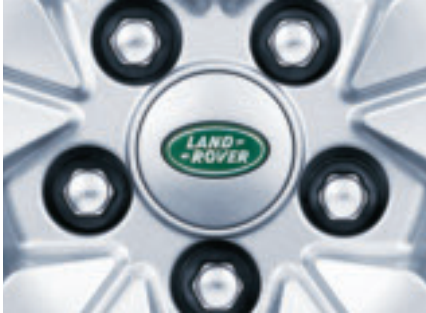
Land Rover Centre Cap Land Rover branded alloy wheel centre caps.