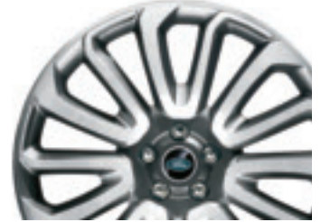
22" Seven Split-Spoke Vibration Polished Diamond Turned Finish Alloy Wheels