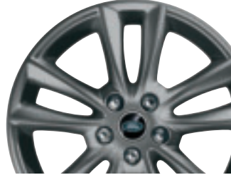
19" Five Split-Spoke Alloy Wheels