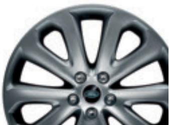
20" Five Split-Spoke Shadow Chrome Finish Alloy Wheels