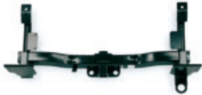
Towing Receiving Armature Help prepare your Range Rover for situations that involve towing.