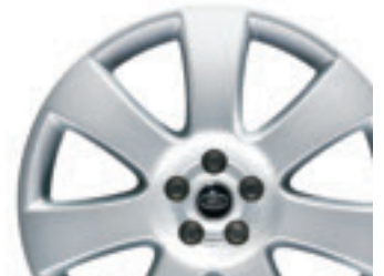
22" Seven-Spoke Sparkle Silver Finish Alloy Wheels