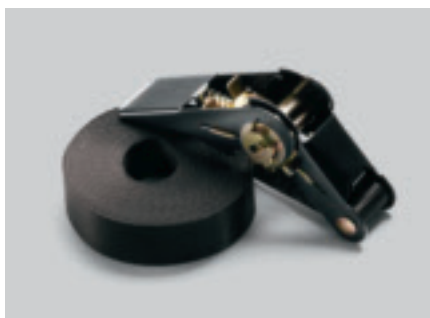
Ratchet Strap Nylon tie strap for securing items to the cross bars and luggage rack when roof carrying. Five metres long, 20mm wide and supplied individually.