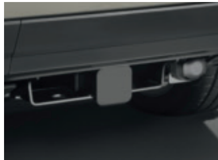
Towing Electrics NAS towing electrics capable of supplying all trailer rear lighting and interior equipment power.