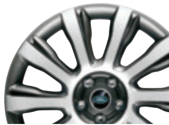
21" Ten-Spoke Diamond Turned Finish Alloy Wheels