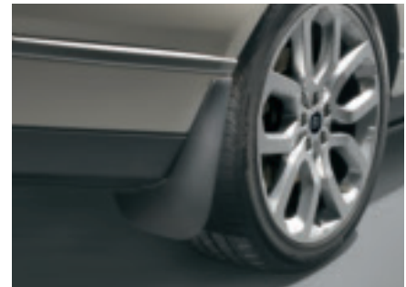
Rear Mudflaps Mudflaps help reduce spray and help protect the paintwork. Supplied as a pair.