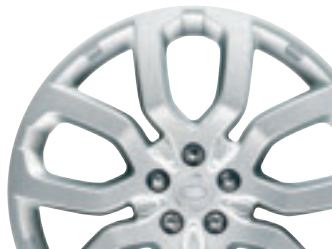
22" Five Split-Spoke Sparkle Silver Finish Alloy Wheels