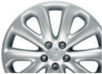
20" Five Split-Spoke Sparkle Silver Finish Alloy Wheels