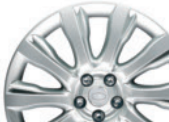
21" Ten-Spoke Sparkle Silver Finish Alloy Wheels