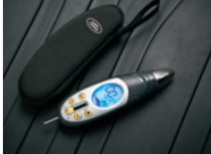
Tire Pressure Gauge Stores recommended pressure and has a unique 360° rotating nozzle to locate tire valve, LED light, tread depth gauge, measuring in psi, bar, kpa, kg/cm 2 and comes complete with storage case.