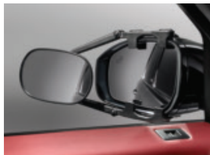
Towing Mirror Extension Premium towing mirrors with a Land Rover branded stowage bag.