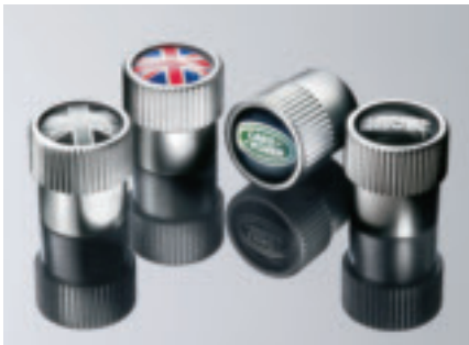
Styled Valve Caps There is an exclusive range of styled valve caps providing choice of Range Rover and Land Rover branded caps, Union Jack, Black Jack and Nitrogen designs. These provide a subtle styling enhancement.