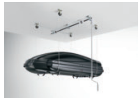
Universal Lift & Load System This roof loading aid fixes to a garage roof and allows equipment to be lifted onto the vehicle with ease. It can also be used for storing the roof box conveniently when removed from the vehicle.