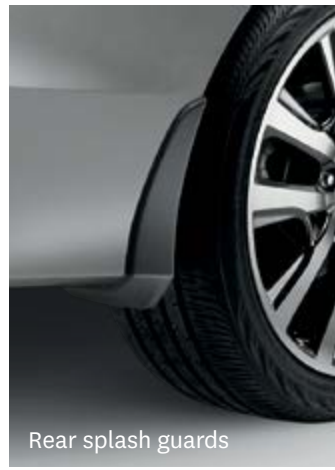
Rear splash guards