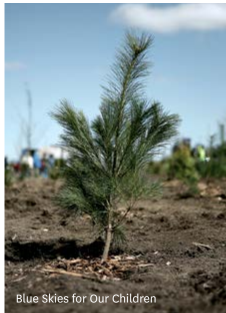
Blue Skies for Our Children