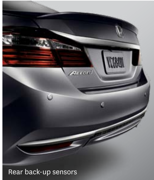
Rear back-up sensors