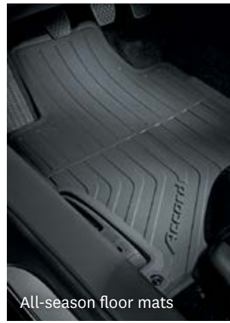
All-season floor mats