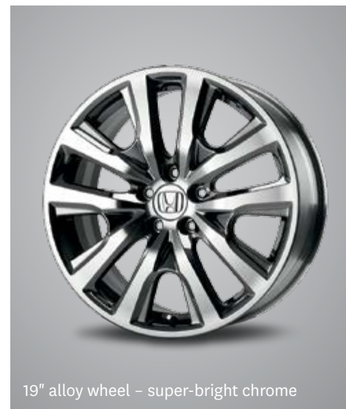
19" alloy wheel - super-bright chrome