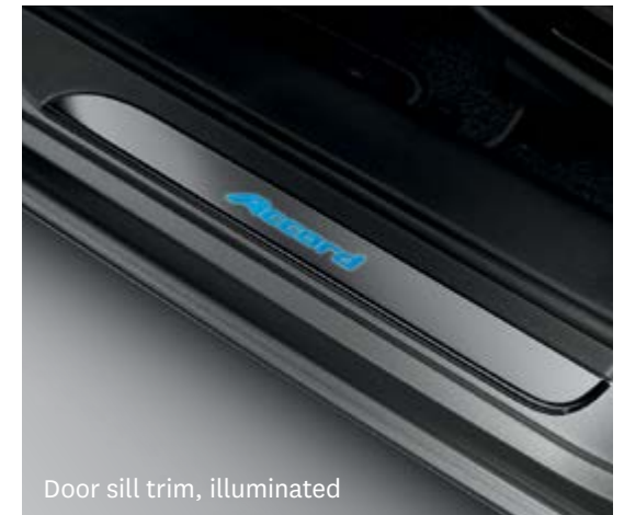
Door sill trim, illuminated