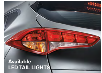
Available LED TAIL LIGHTS

*The available Smart Power Liftgate senses your presence when you stand within three feet of the trunk, for three seconds, with the proximity key. With no extra movement or motion, the trunk opens automatically, so you can unload your two hands' worth of cargo, effortlessly.