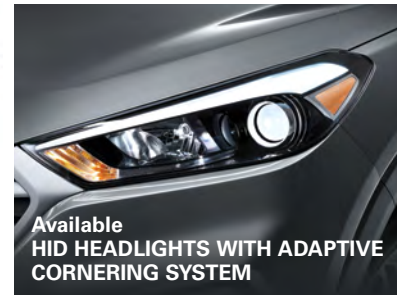
Available HID HEADLIGHTS WITH ADAPTIVE CORNERING SYSTEM