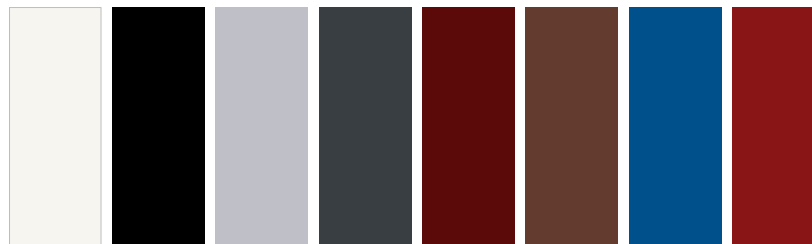
WINTER WHITE ASH BLACK CHROMIUM SILVER COLISEUM GREY RUBY WINE MOJAVE SAND* CARIBBEAN BLUE* SEDONA SUNSET †

*Not available on 2.0L FWD model. †Available on 1.6T Limited and 1.6T Ultimate models only.