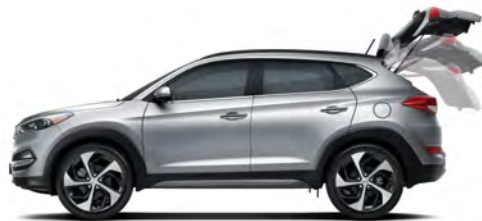
Available SMART POWER LIFTGATE*