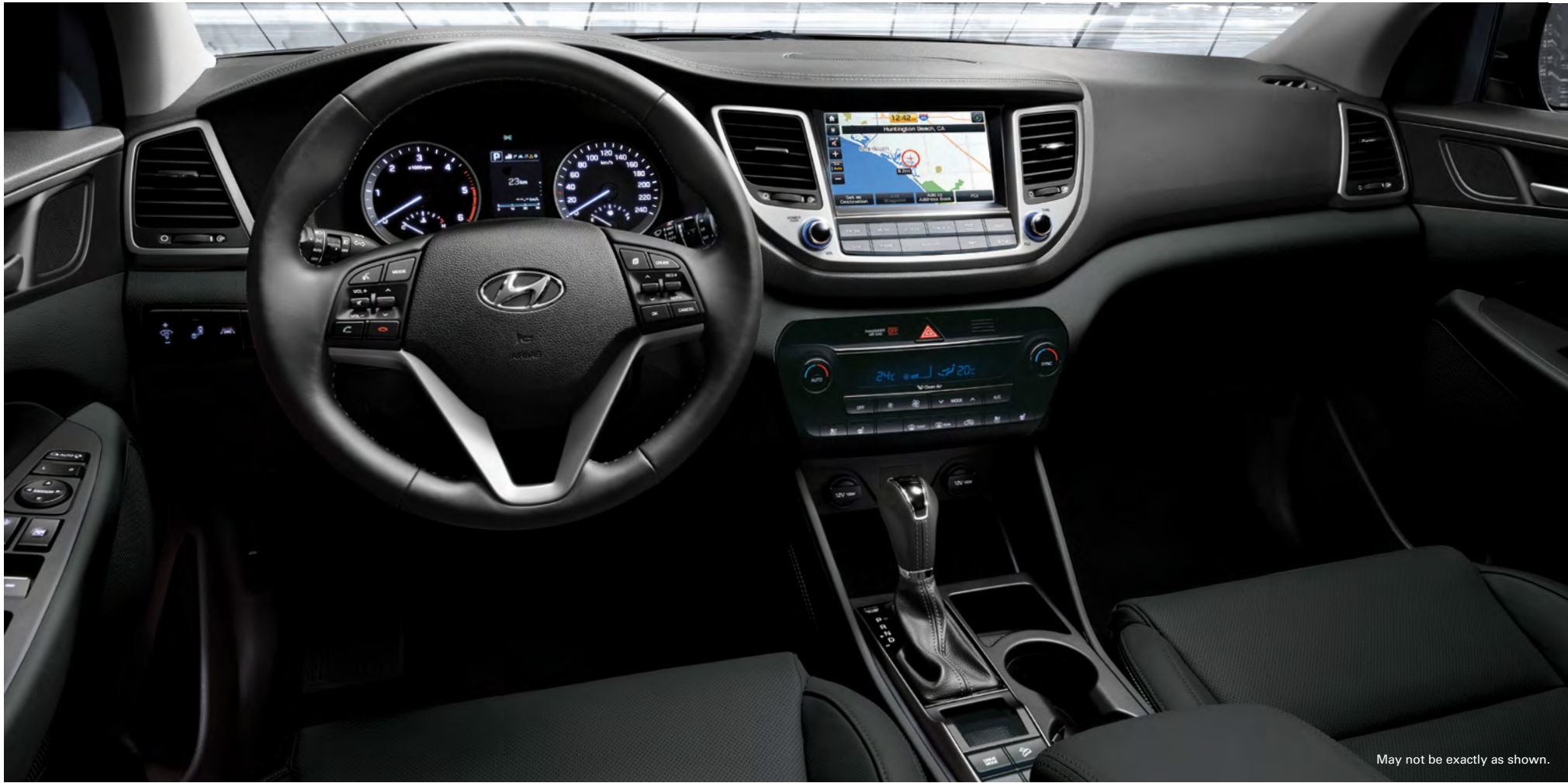
May not be exactly as shown.