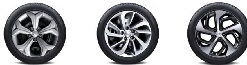
17" Steel Wheel Standard on 2.0L FWD model 17" Alloy Wheel Standard on 2.0L Premium, 2.0L SE and 2.0L Luxury models 19" Alloy Wheel Standard on all 1.6T models

Choice of interior colour depends upon model and/or exterior colour selection. Due to the print production process, the colours shown throughout this brochure may vary slightly from actual hue. Textures may not be exactly as shown. Visit hyundaicanada.com or see your dealer for details.