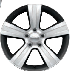
17-inch aluminum with Granite painted pockets Standard on High Altitude®