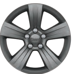
17-inch Mineral Grey aluminum Standard on Sport Altitude II