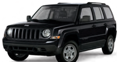
Cloth – Dark Slate Grey (shown right) Standard on Sport