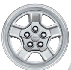
16-inch styled steel Standard on Sport and North Edition