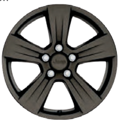
17-inch Low-Gloss Bronze aluminum Standard on 75 th Anniversary