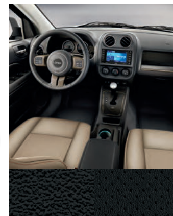
Leather-faced with Ombré mesh inserts – Dark Slate Grey with Tangerine and Pearl accent stitching Standard on 75 th Anniversary