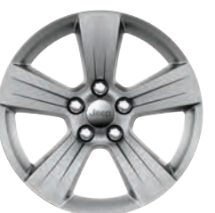
17-inch aluminum Available on Sport and North Edition