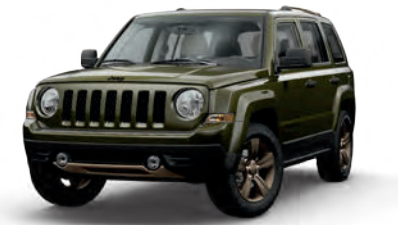
Leather-faced with Ombré mesh inserts – Light Frost Beige with Tangerine and Pearl accent stitching (shown right) Standard on 75 th Anniversary