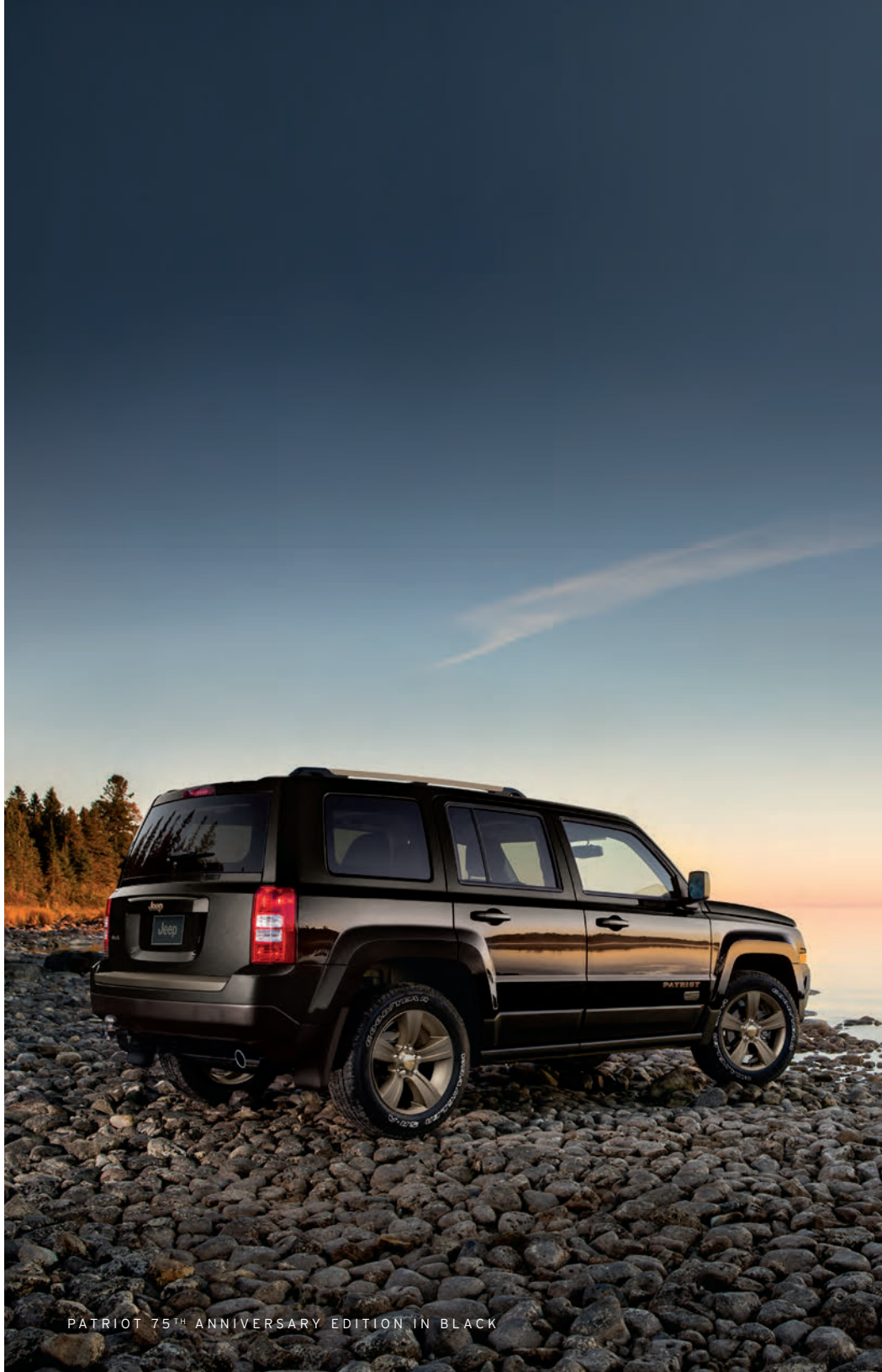
PATRIOT 75 th ANNIVERSARY EDITION IN BLACK