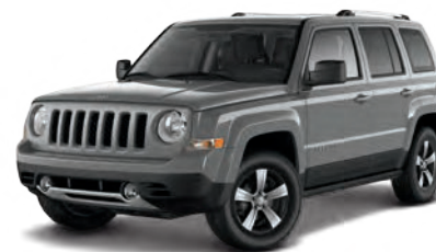
Leather-faced – Light Pebble Beige with Dark Slate Grey accent stitching (shown right) Standard on High Altitude