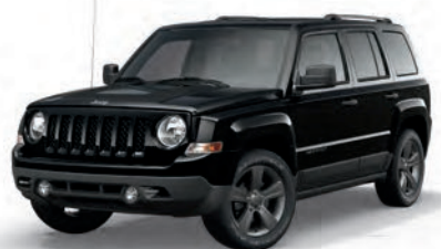
Sport Mesh Cloth – Dark Slate Grey with Light Slate Grey accent stitching (shown right) Standard on Sport Altitude II