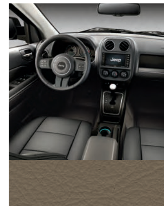
Leather-faced – Dark Slate Grey with Light Slate Grey accent stitching Standard on High Altitude