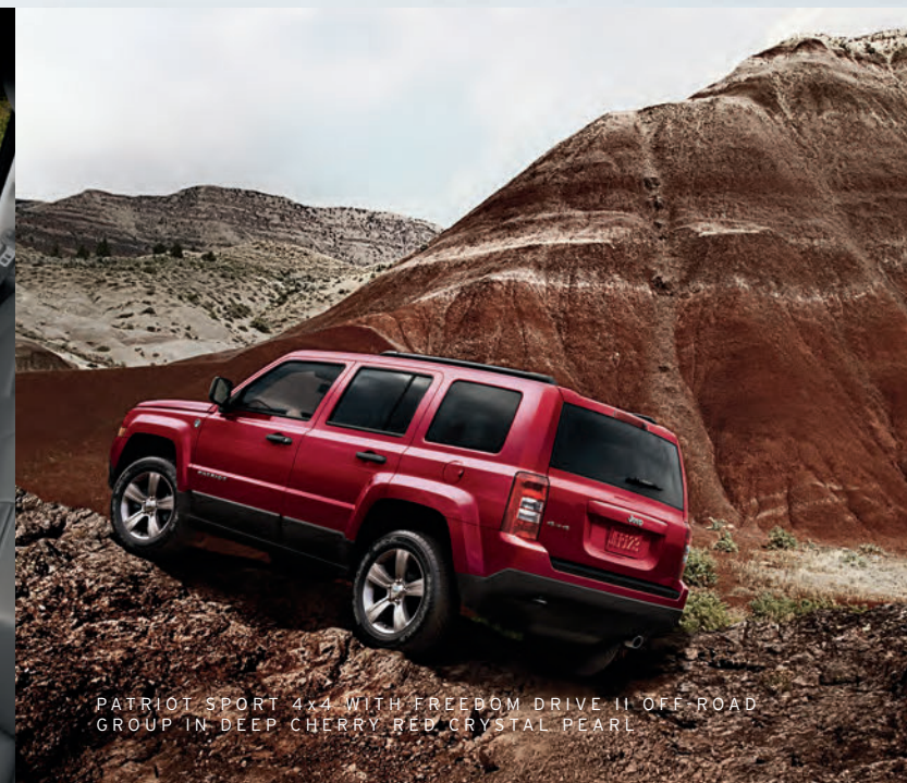
PATRIOT SPORT 4x4 WITH FREEDOM DRIVE II OFF-ROAD GROUP IN DEEP CHERRY RED CRYSTAL PEARL