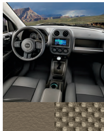
Sport Mesh Cloth – Light Pebble Beige with Tangerine accent stitching Standard on Sport Altitude II