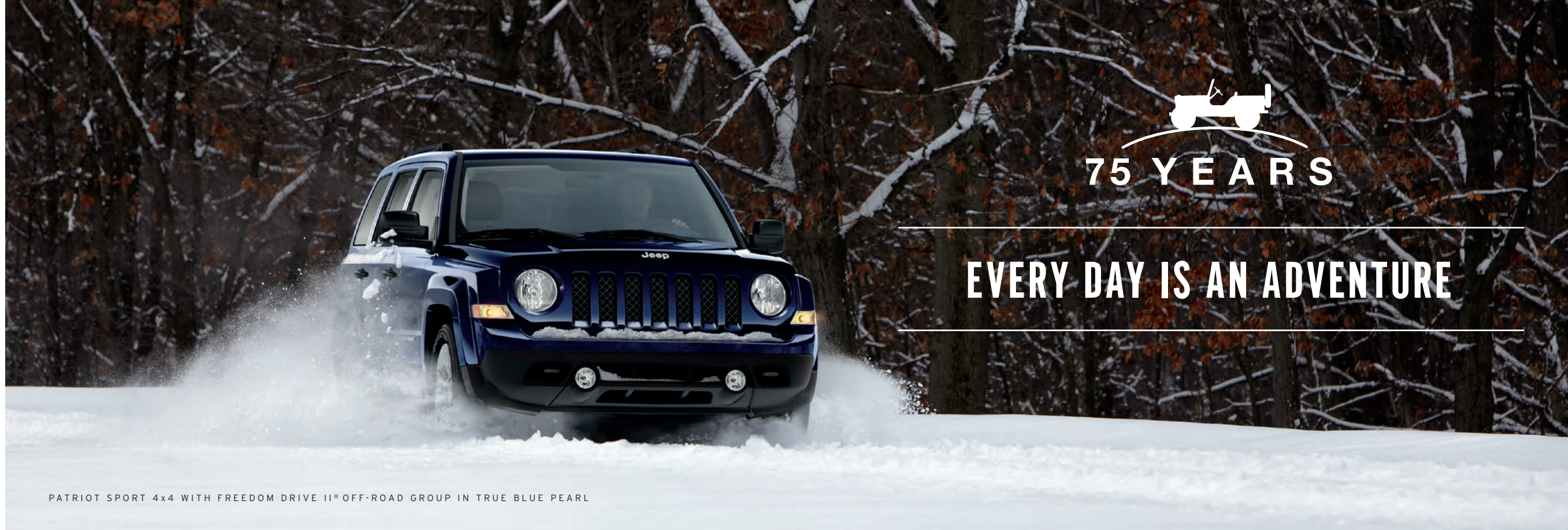
PATRIOT SPORT 4x4 WITH FREEDOM DRIVE II® OFF-ROAD GROUP IN TRUE BLUE PEARL