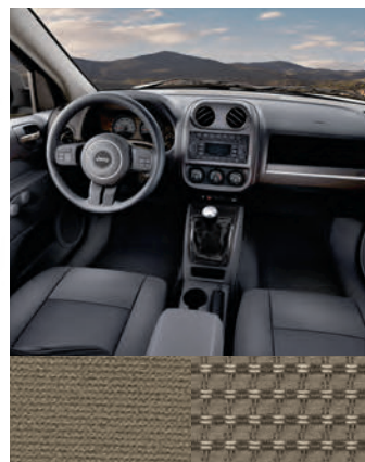
Cloth – Light Pebble Beige Standard on Sport