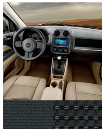
Cloth – Dark Slate Grey Standard on North Edition