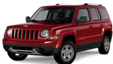
Cloth – Light Pebble Beige (shown right) Standard on North Edition