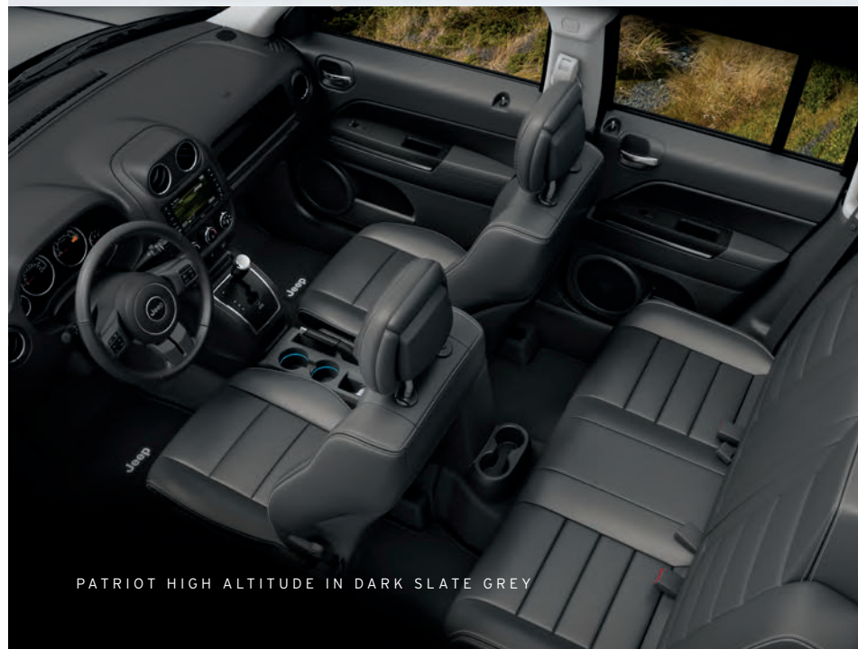
PATRIOT HIGH ALTITUDE IN DARK SLATE GREY