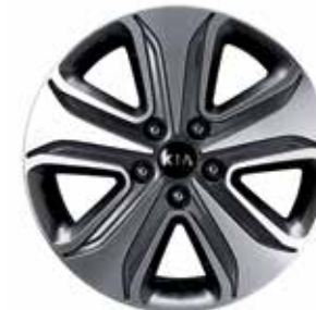
17" alloy wheels