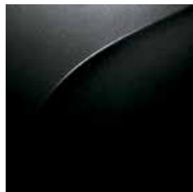
Aurora Black BC/BL