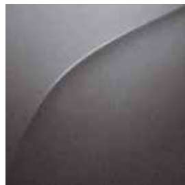
Graphite (M) BC/BL