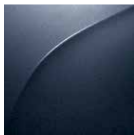
Gravity Blue (M) BC/BL