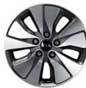
16" alloy wheels