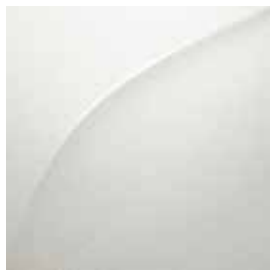
Snow White Pearl (P) BC/BL