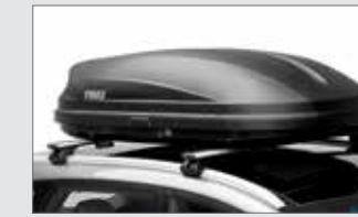
Roof cargo box