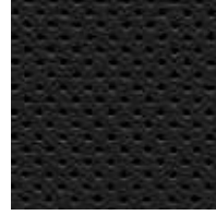
Black Premium Leather (BPL)