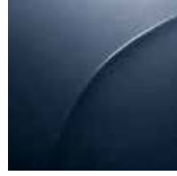
Blaze Blue* BC/BL