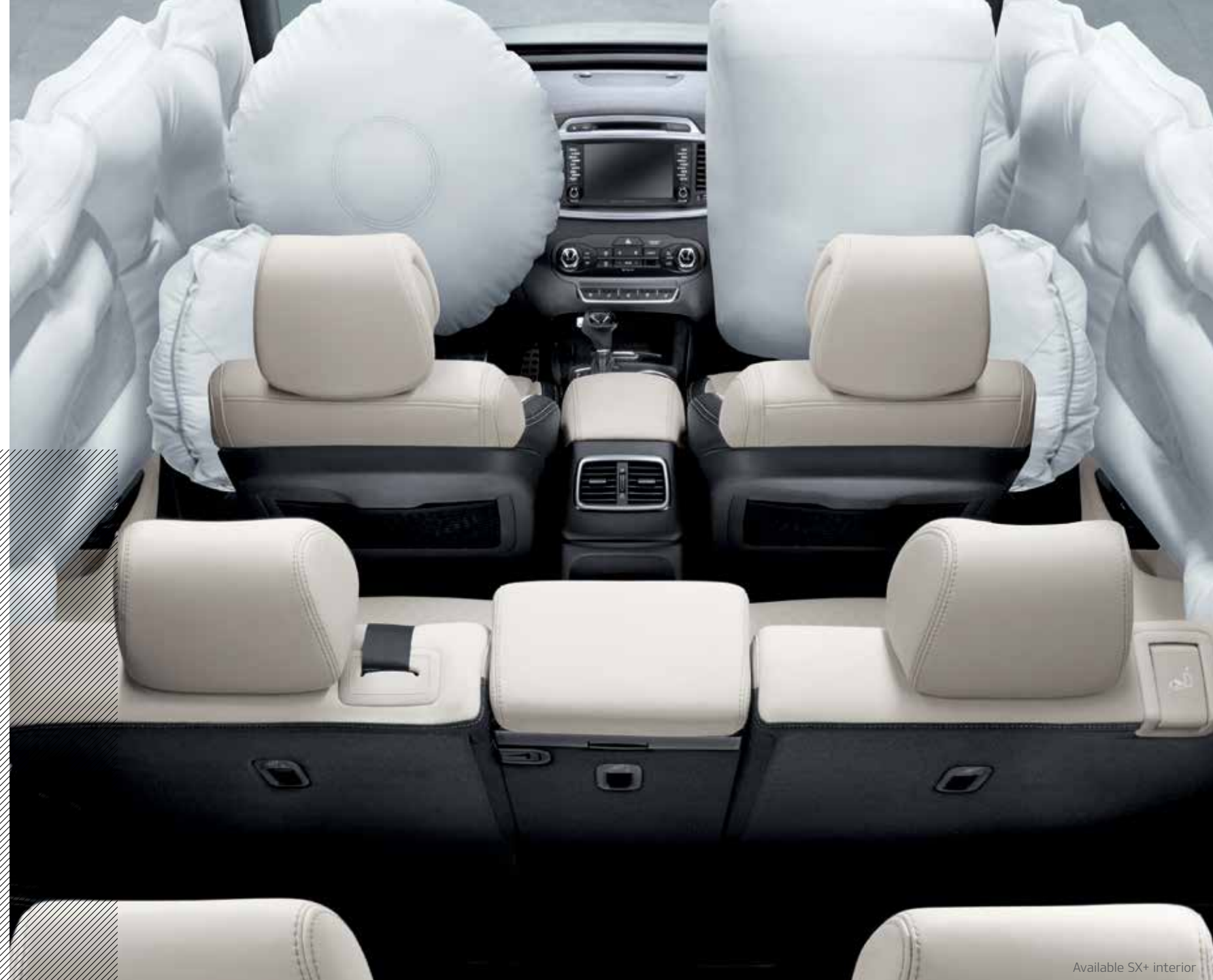
Available SX+ interior

Sorento offers advanced technologies that help the driver become more aware of potential hazards around the vehicle—such as available Blind Spot Detection. 1 Should an accident prove unavoidable, you can take comfort in the fact Kia has given the unthinkable a tremendous amount of thought. A series of passive safety systems are designed to help protect the passenger compartment – from a safety cage design that’s fortified with ultra-high-tension steel to a six-airbag SRS system. Clearly, the more thought Kia puts into Sorento’s safety, the greater your peace of mind.