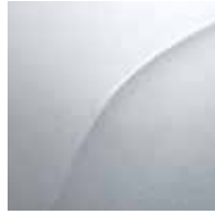
Sparkling Silver* BC/BL/BPL/BNL/WNL