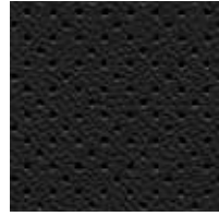
Black Leather (BL)