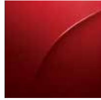
Regency Red* BC/BL/BPL/BNL/WNL