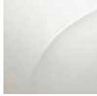
Snow White Pearl* BC/BL/BPL/BNL/WNL