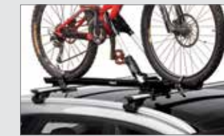
Roof-mounted bike rack