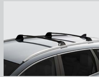
ROOF RACK RAILS & CROSSBARS