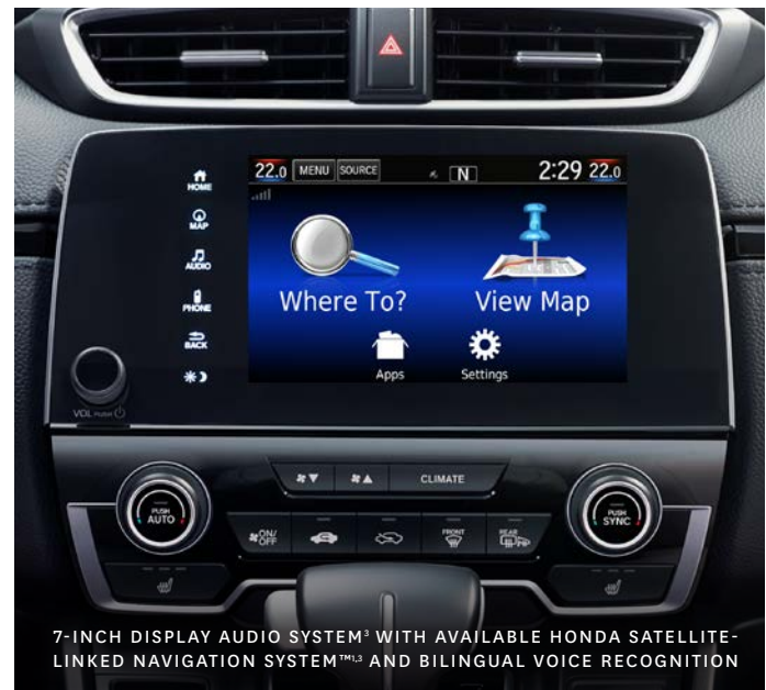
7-INCH DISPLAY AUDIO SYSTEM 1 WITH AVAILABLE HONDA SATELLITE-LINKED NAVIGATION SYSTEM™ 1,3 AND BILINGUAL VOICE RECOGNITION