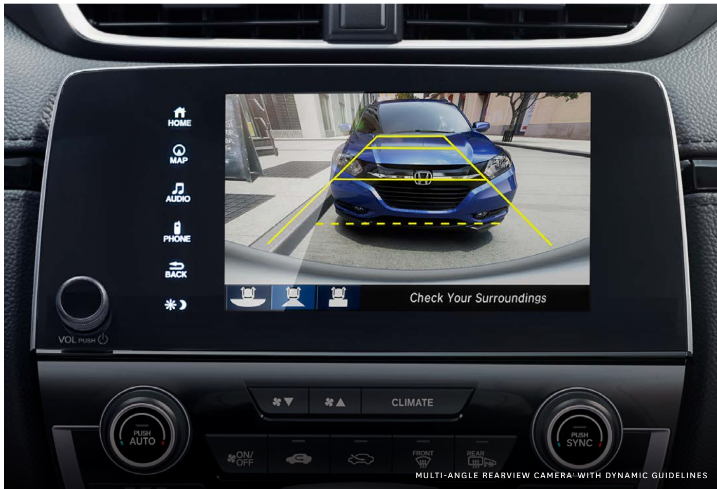
MULTI-ANGLE REARVIEW CAMERA 1 WITH DYNAMIC GUIDELINES