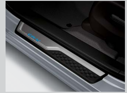
DOOR SILL TRIM, ILLUMINATED