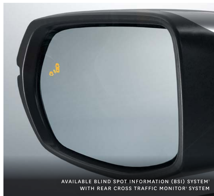
AVAILABLE BLIND SPOT INFORMATION (BSI) SYSTEM 1 WITH REAR CROSS TRAFFIC MONITOR 1 SYSTEM