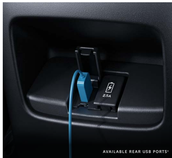
AVAILABLE REAR USB PORTS 2