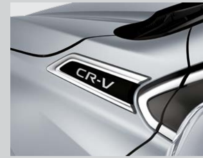
FRONT FENDER GARNISH