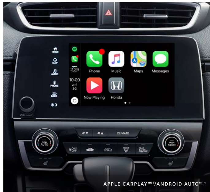
APPLE CARPLAY™ 1,2 /ANDROID AUTO™ 1,2