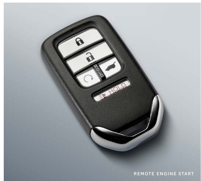
REMOTE ENGINE START