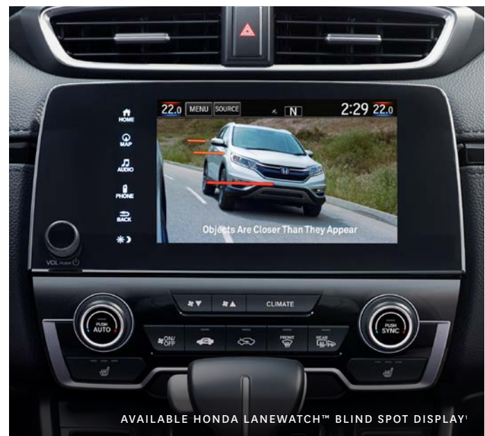
AVAILABLE HONDA LANEWATCH™ BLIND SPOT DISPLAY 1