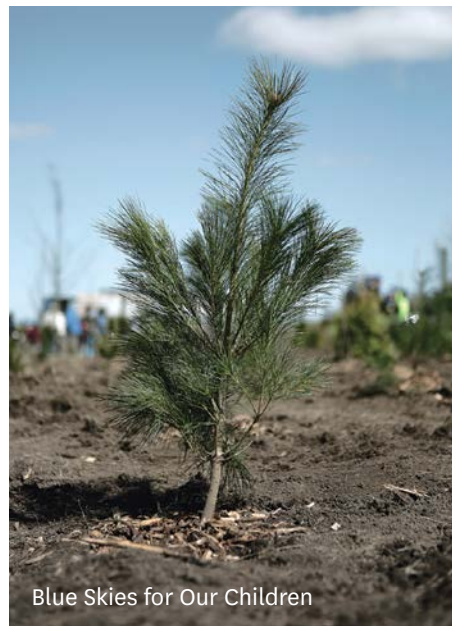
Blue Skies for Our Children