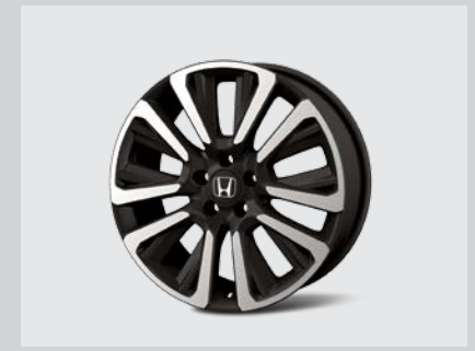
19" ALLOY WHEEL