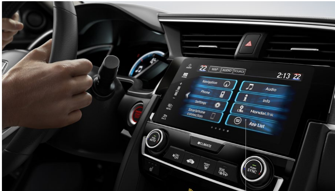
AVAILABLE 7" DISPLAY AUDIO SYSTEM 1