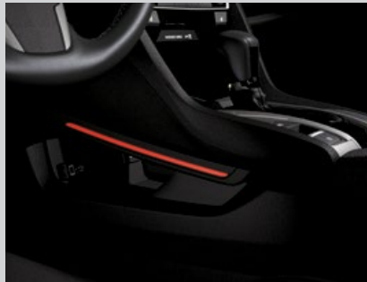
ILLUMINATED CONSOLE (BLUE OR RED)