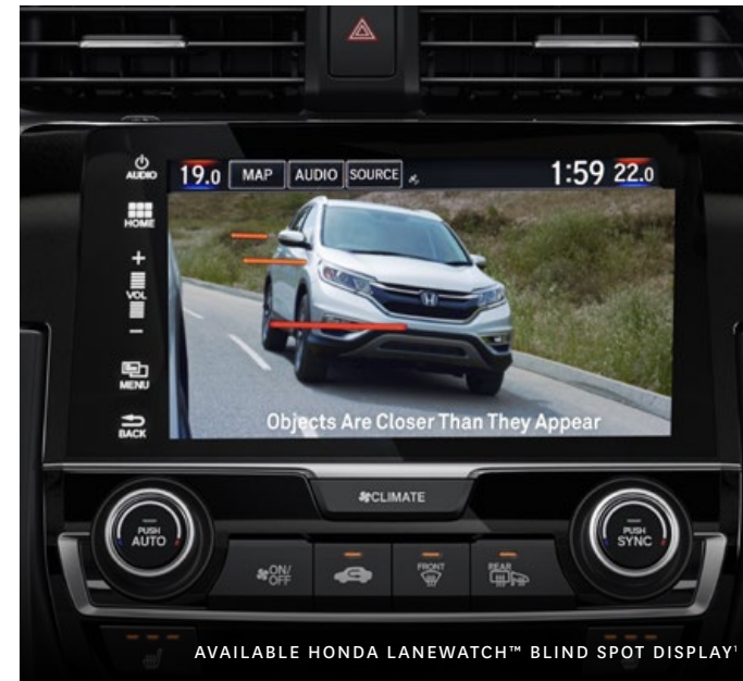
AVAILABLE HONDA LANEWATCH™ BLIND SPOT DISPLAY 1