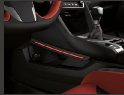
ILLUMINATED CONSOLE, TYPE R