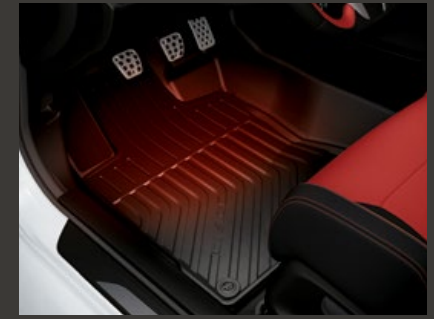
AMBIENT LIGHTING (RED)