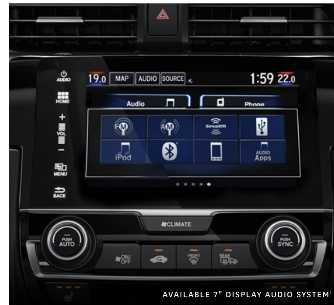
AVAILABLE 7" DISPLAY AUDIO SYSTEM 1