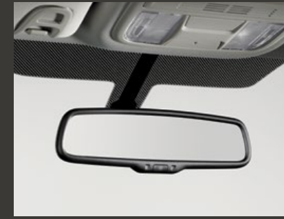
AUTO DAY/NIGHT MIRROR