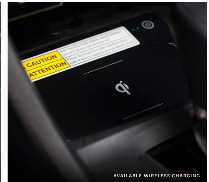
AVAILABLE WIRELESS CHARGING