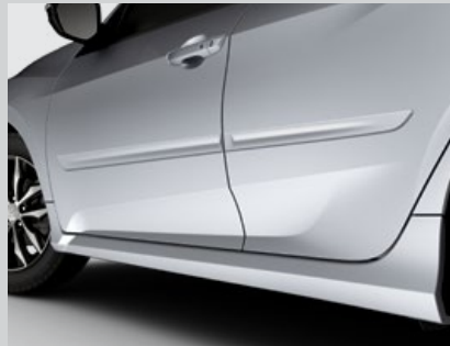
BODY SIDE MOLDING