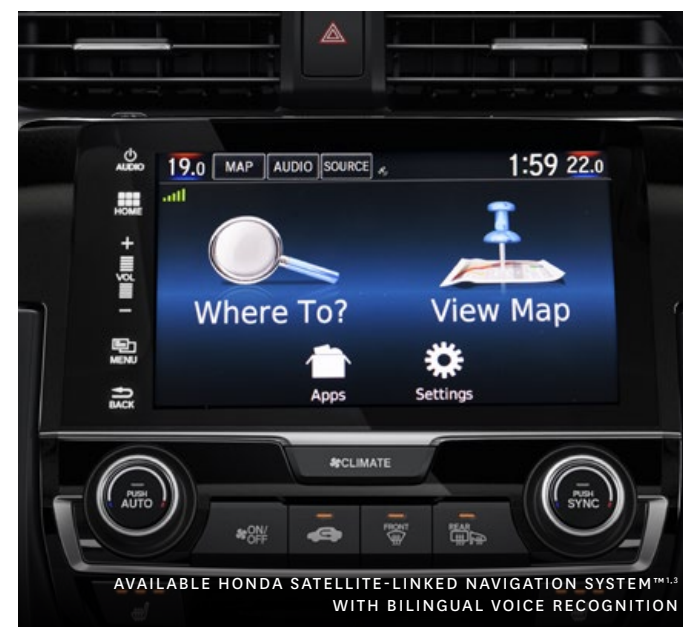
AVAILABLE HONDA SATELLITE-LINKED NAVIGATION SYSTEM™ 1,3 WITH BILINGUAL VOICE RECOGNITION