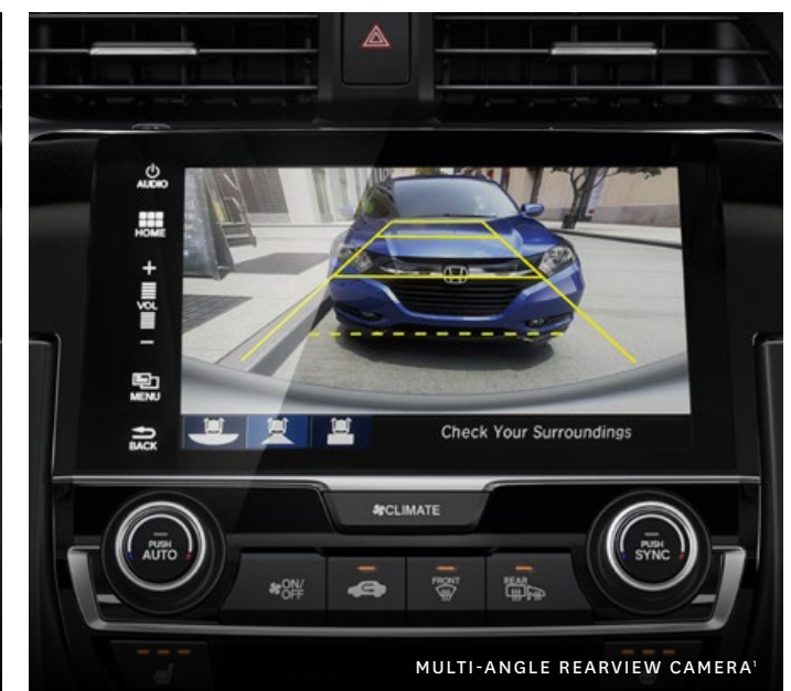
MULTI-ANGLE REARVIEW CAMERA 1