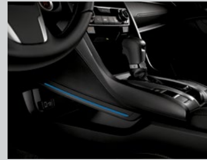
ILLUMINATED CONSOLE (BLUE)