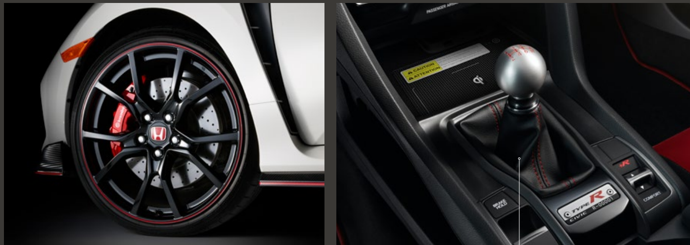
6-SPEED MANUAL TRANSMISSION (MT) WITH REV-MATCH CONTROL