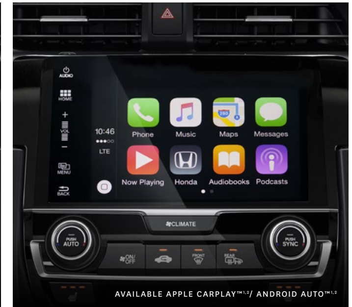
AVAILABLE APPLE CARPLAY™ 1,2 / ANDROID AUTO™ 1,2