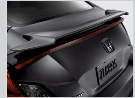
REAR WING SPOILER