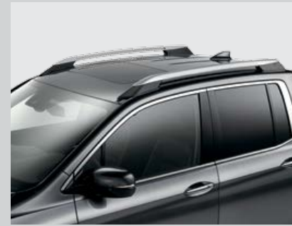
ROOF RACK RAILS, SILVER