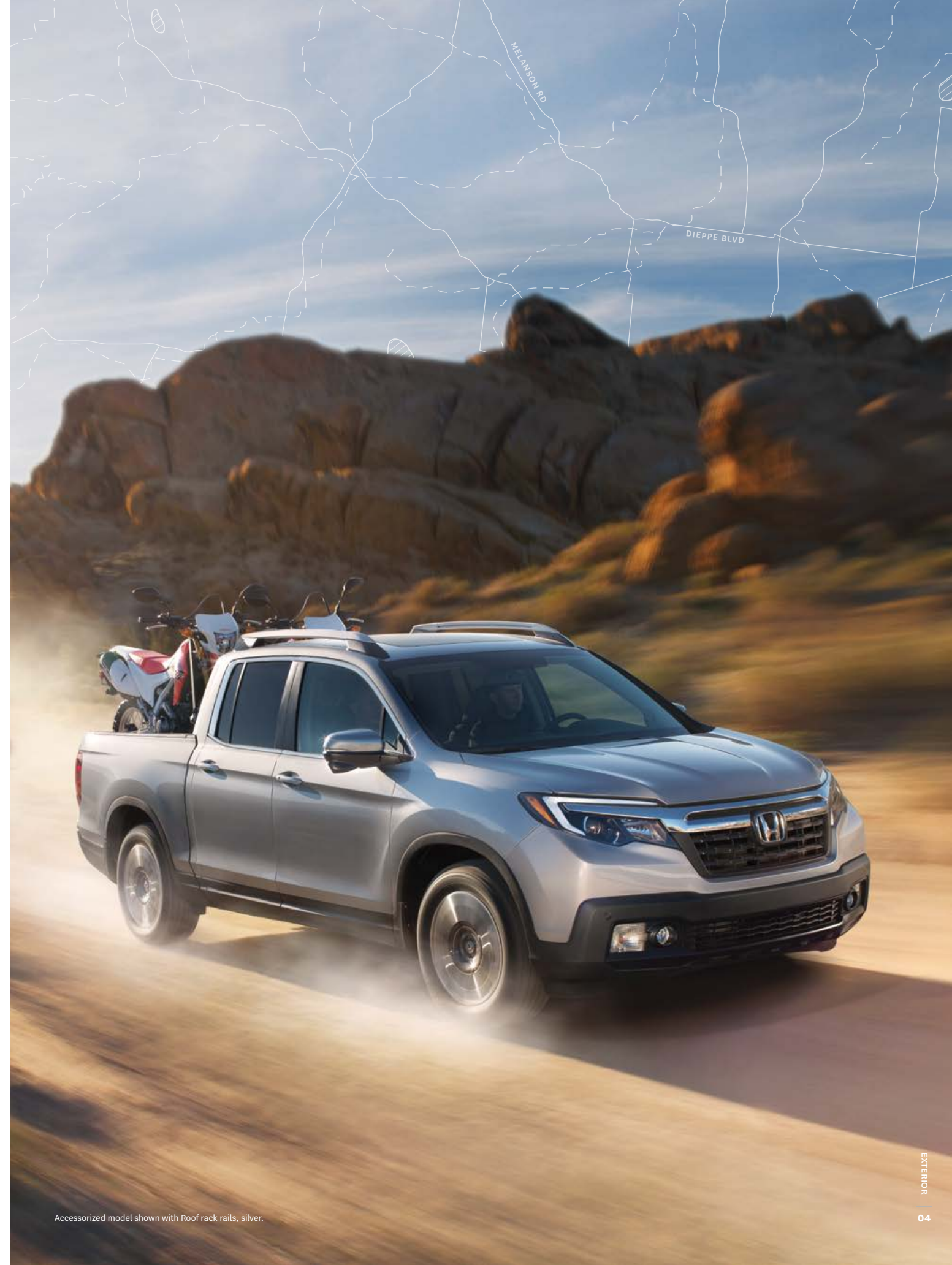
Accessorized model shown with Roof rack rails, silver.