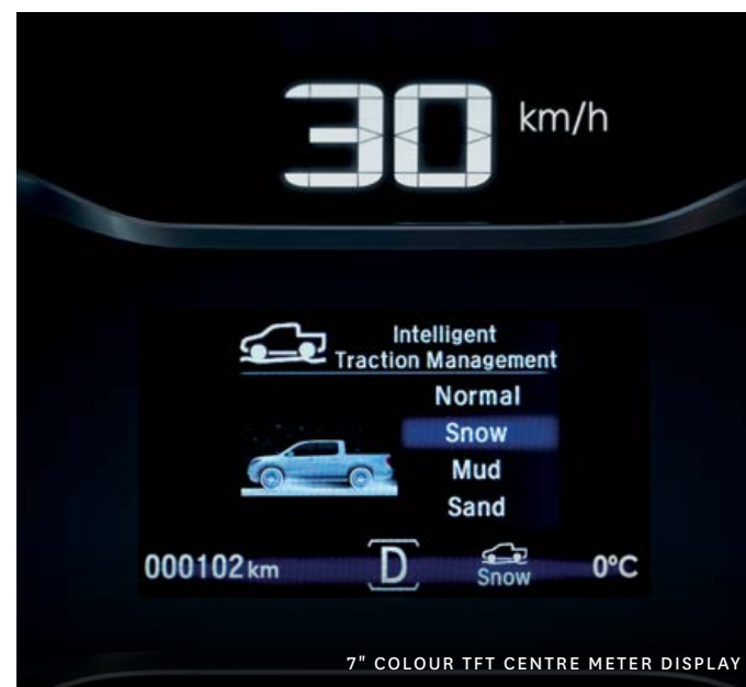
7" COLOUR TFT CENTRE METER DISPLAY