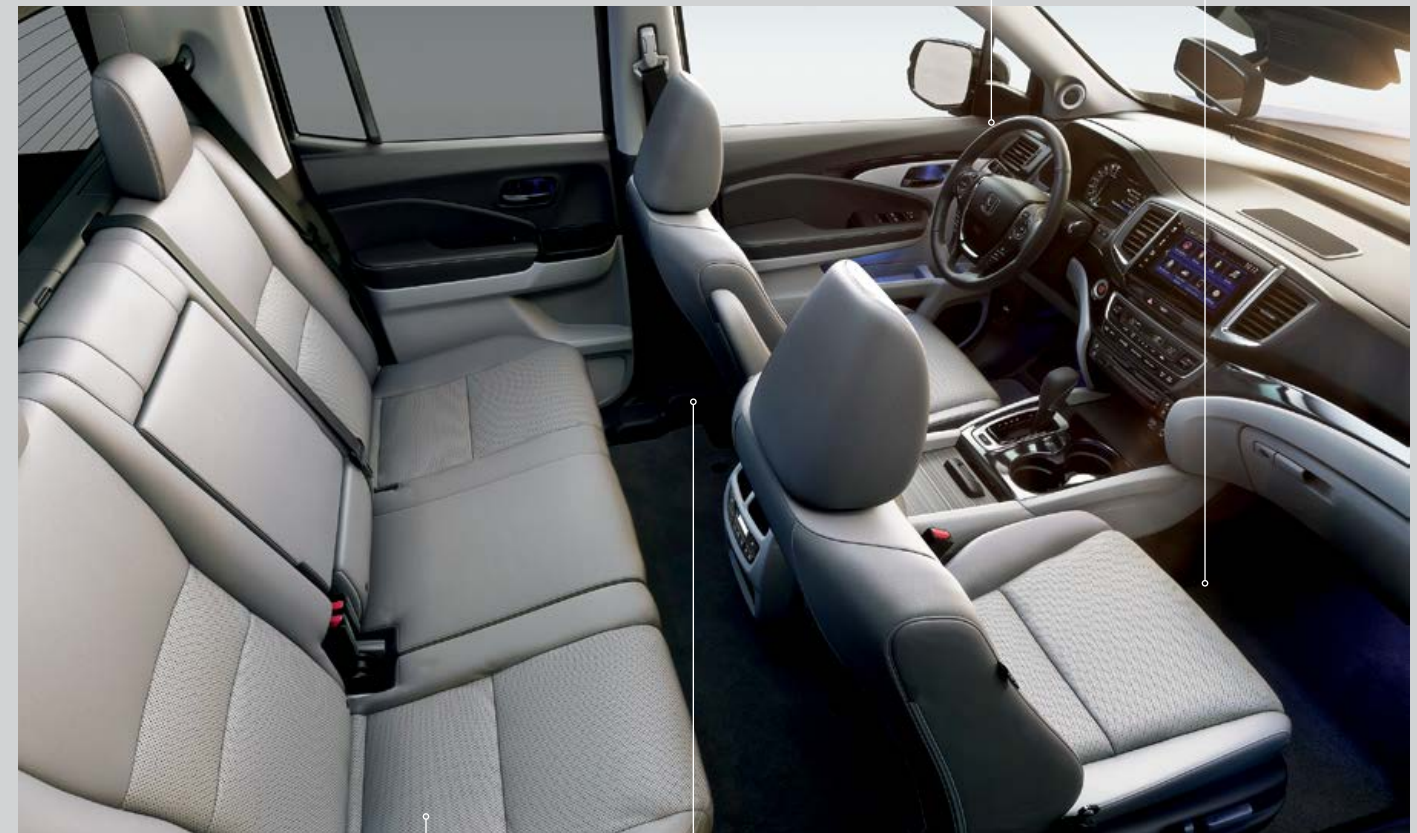
REAR SEAT COVER, 2ND ROW