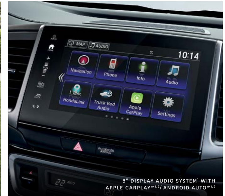
8" DISPLAY AUDIO SYSTEM 1 WITH APPLE CARPLAY ™1,2 /ANDROID AUTO ™1,2