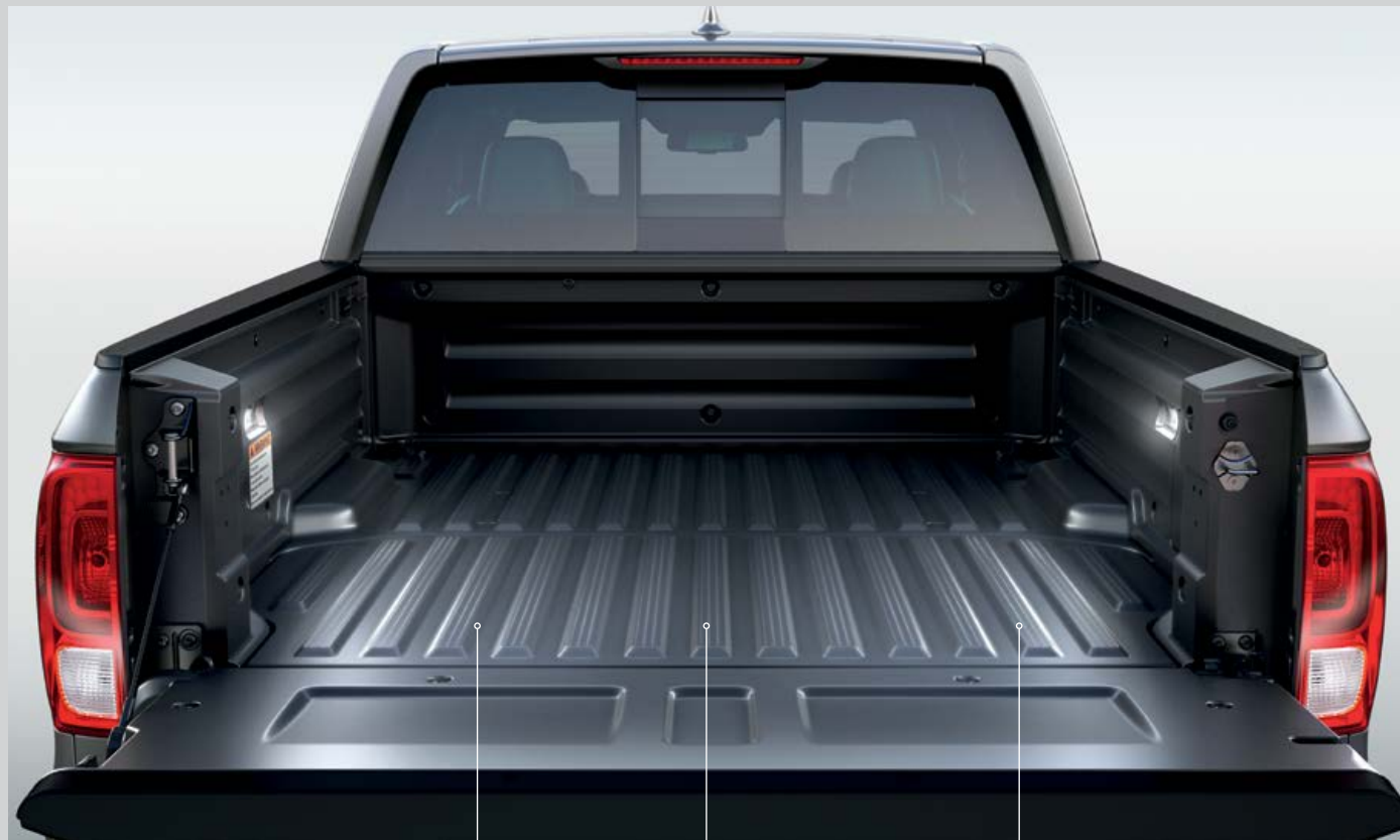
CARGO NET - IN-BED TRUNK™