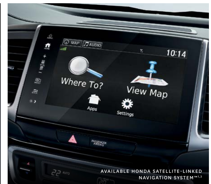
AVAILABLE HONDA SATELLITE-LINKED NAVIGATION SYSTEM ™1,3