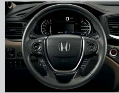
HEATED STEERING WHEEL