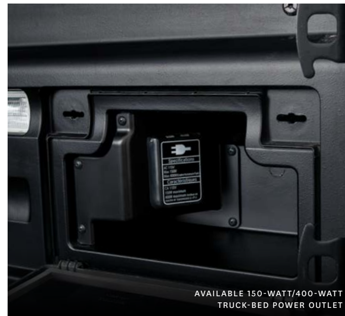
AVAILABLE 150-WATT/400-WATT TRUCK-BED POWER OUTLET