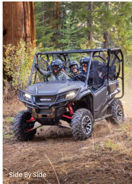
Side By Side