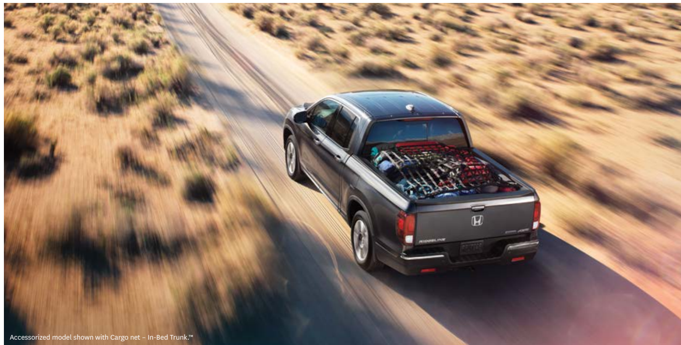
Accessorized model shown with Cargo net - In-Bed Trunk.**