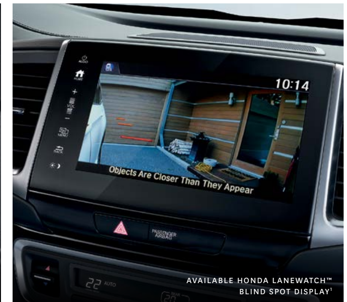
AVAILABLE HONDA LANEWATCH ™ BLIND SPOT DISPLAY 1