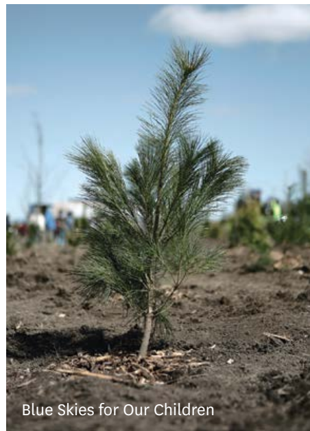
Blue Skies for Our Children