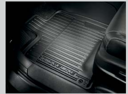
ALL-SEASON FLOOR MATS (HIGH WALL)