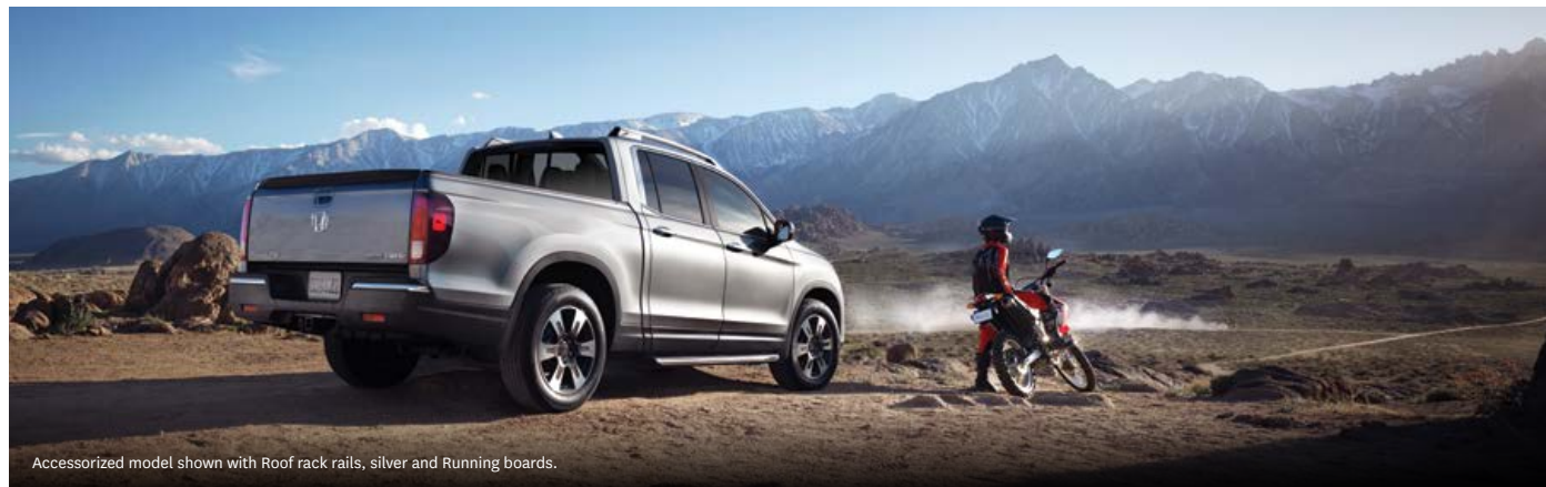
Accessorized model shown with Roof rack rails, silver and Running boards.