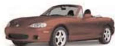
Garnet Red Mica