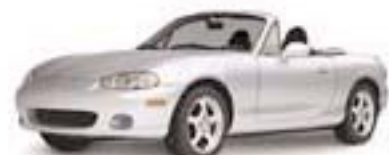
Sunlight Silver Metallic