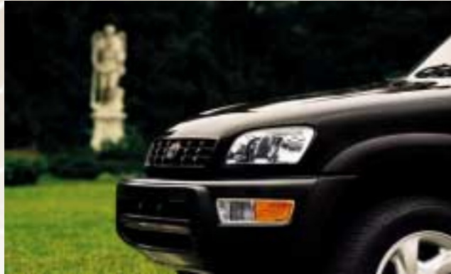
New Multi-Reflector Headlamps Combined with the Redesigned Front Grille and Bumper Give RAV4 a Fresh New Face