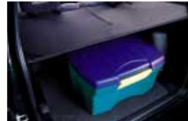
THIS REMOVABLE TONNEAU COVER WILL PROTECT YOUR VALUABLES FROM CURIOUS EYES.