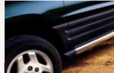
RUGGED AND FUNCTIONAL, THE SIDE SPORTS BAR PROTECTS THE BODYWORK FROM ROCKS AND DEBRIS.