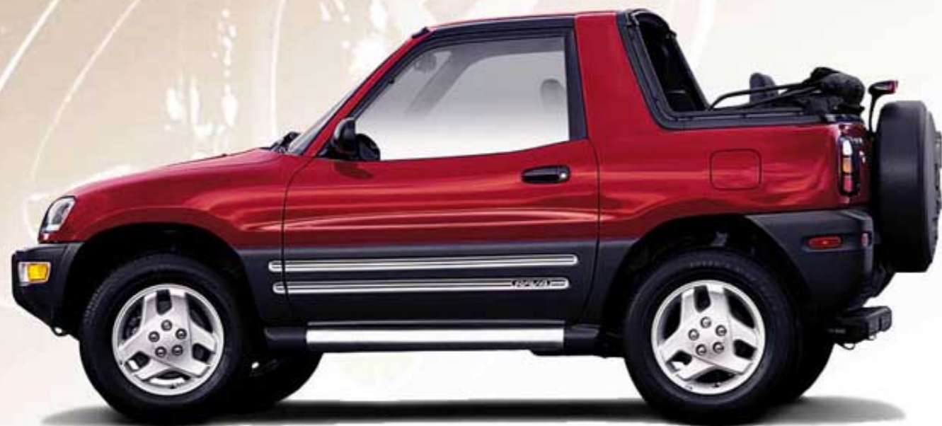
(Optional equipment shown)