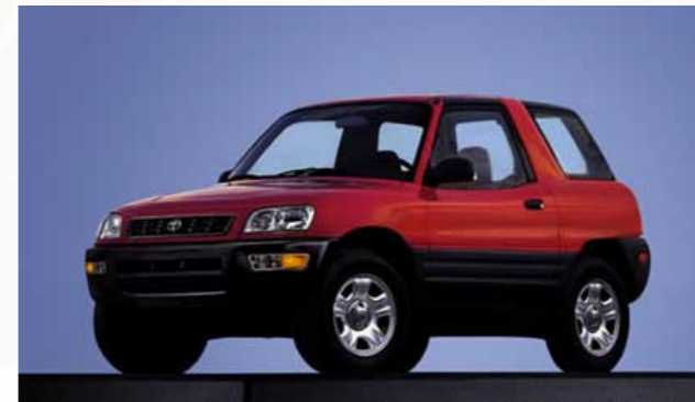
Toyota RAV4 2-Door Shown in Radiant Red