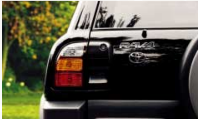
Backing Up, Braking or Turning, Your Intentions are Clear with RAV4's Redesigned Tail Lamps

Enjoy the responsiveness and economy of RAV4's 127 hp, 16-valve engine. Enjoy round-town driving and parking ease thanks to the road-holding traction of front-wheel or full-time 4-wheel drive and standard power rack and pinion steering. Ride in comfort and