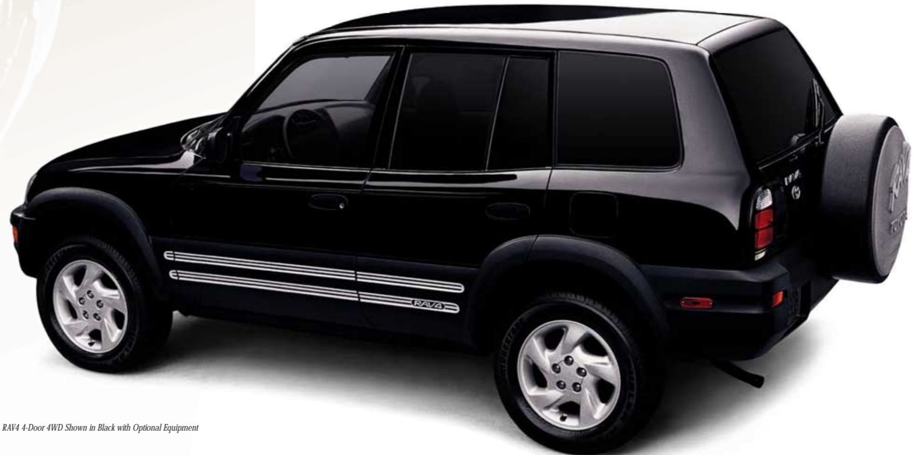
RAV4 4-Door 4WD Shown in Black with Optional Equipment

Enjoy the responsiveness and economy of RAV4's 127 hp, 16-valve engine. Enjoy round-town driving and parking ease thanks to the road-holding traction of front-wheel or full-time 4-wheel drive and standard power rack and pinion steering. Ride in comfort and