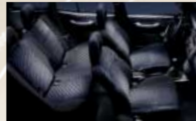
RAV4's Spacious and Comfortable Interior Easily Adapts to Your Active Lifestyle (4-Door Fabric Shown)

*4-door models (31.4 ft 3 2-door models)