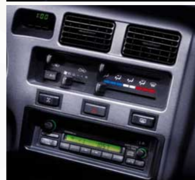
A Sporty New 3-Spoke Steering Wheel Complements RAV4's Stylish and Functional Instrument Panel (Optional Equipment Shown)