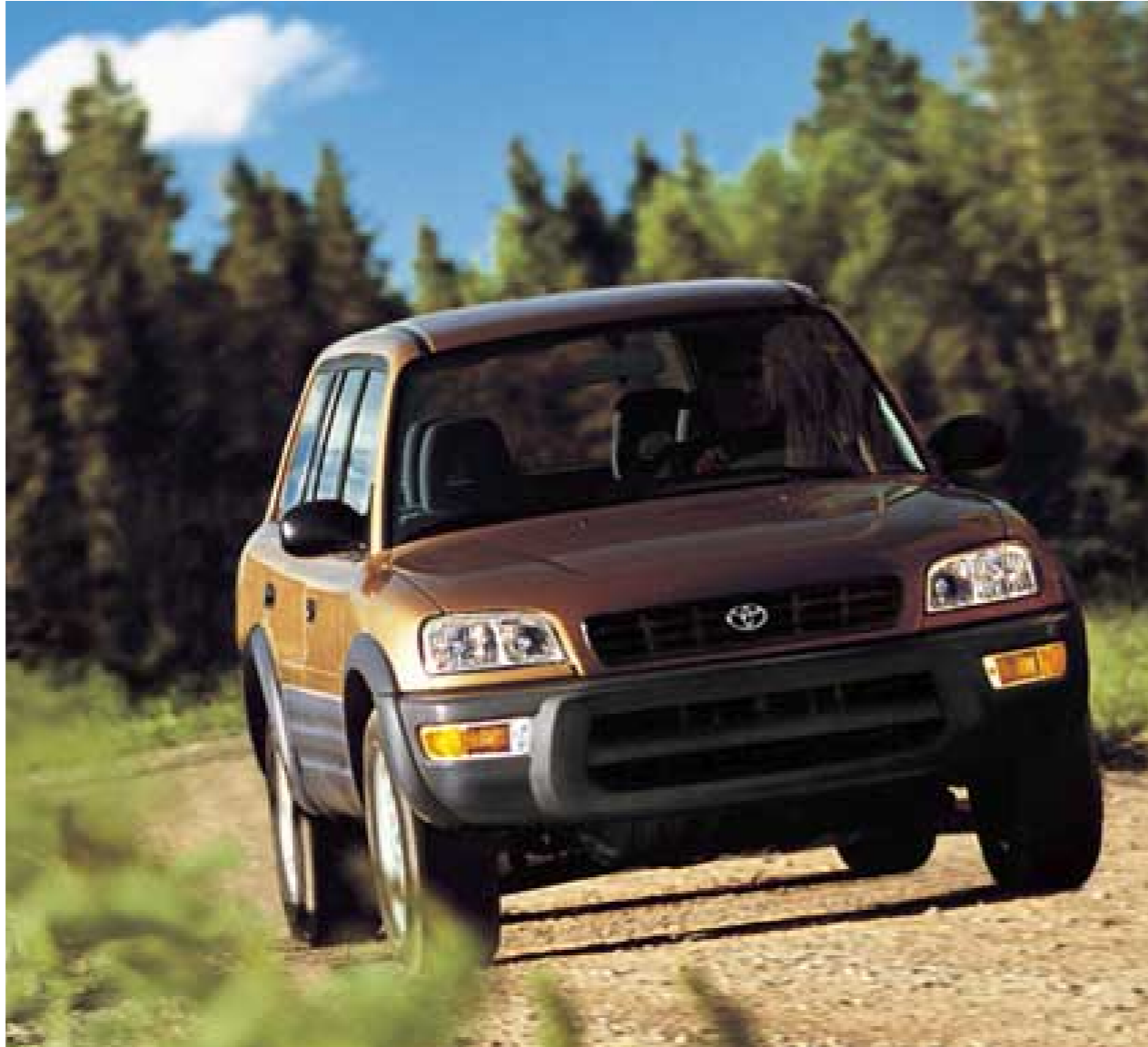
Toyota RAV4 4-Door 4WD Shown in Sunset Metallic with Optional Equipment