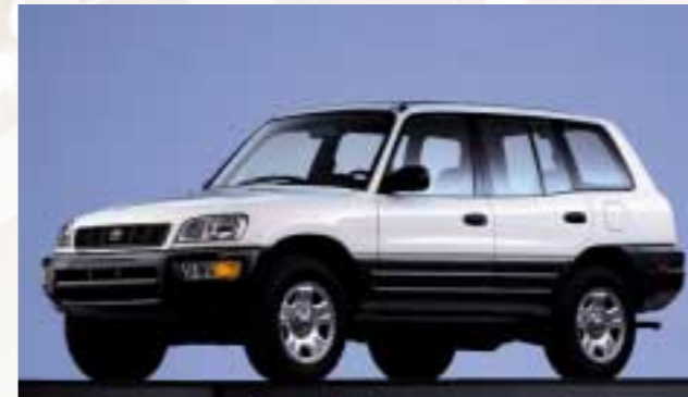
Toyota RAV4 4-Door Shown in Natural White