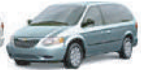
Butane Blue Pearl Coat