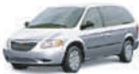
Bright Silver Metallic