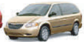
Light Almond Pearl Metallic