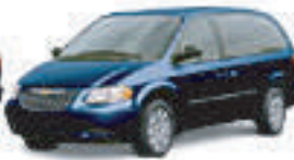
Deep Sapphire Blue Pearl Coat