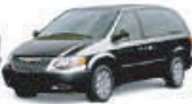
Brilliant Black Crystal Pearl Coat