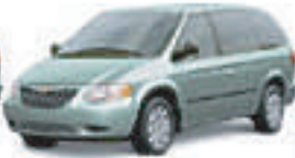
Satin Jade Pearl Coat