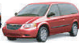
Inferno Red Tinted Pearl Coat