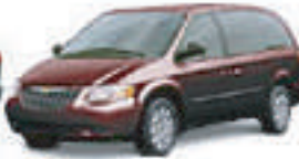
Deep Lava Red Metallic