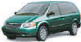
Onyx Green Pearl Coat