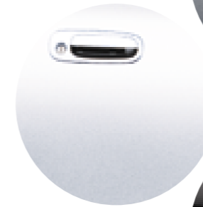
040 Alpine White 3