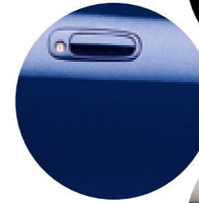
8M6 Spectra Blue Mica 1,2,3