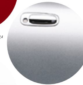
1E7 Silver Streak Mica 1,2