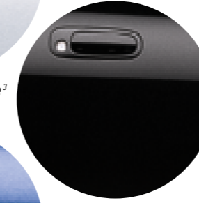
202 Black 1,2