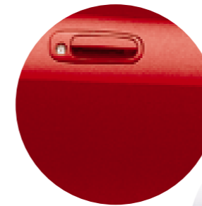
3P0 Absolutely Red 1,2,4