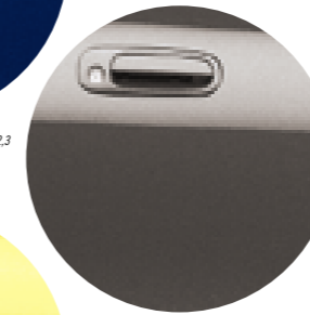
1D2 Thunder Cloud 4