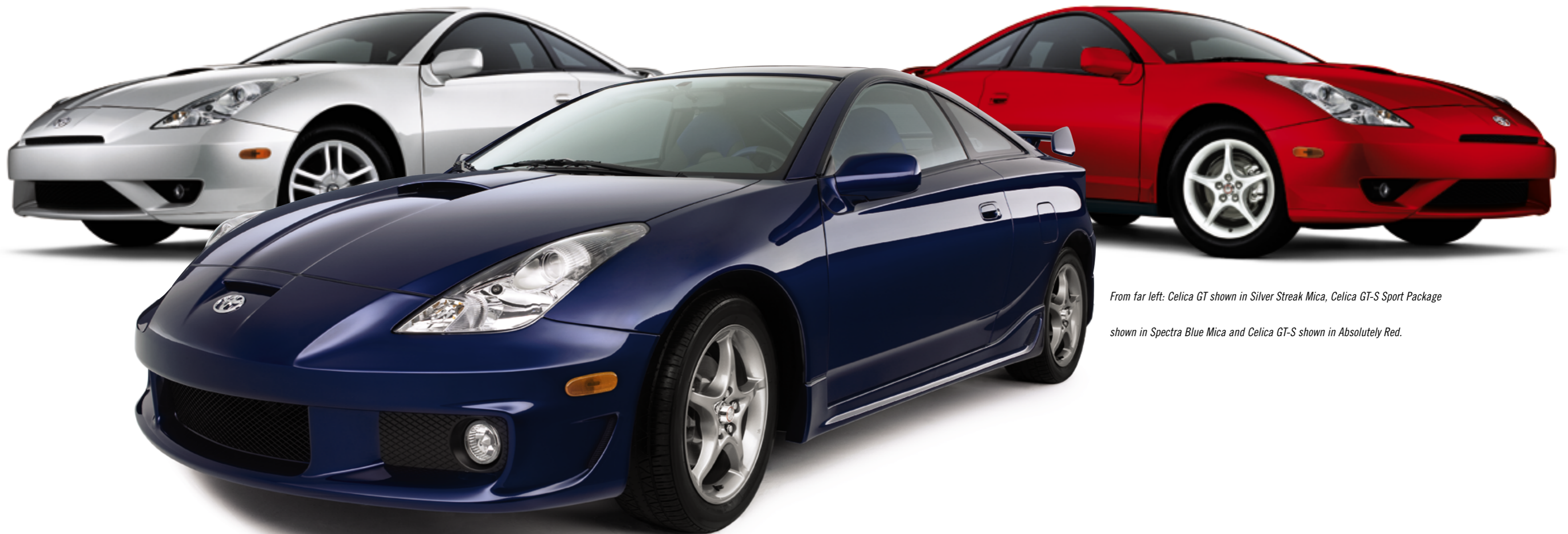
From far left: Celica GT shown in Silver Streak Mica, Celica GT-S Sport Package shown in Spectra Blue Mica and Celica GT-S shown in Absolutely Red.