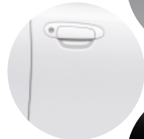
068 Polar White