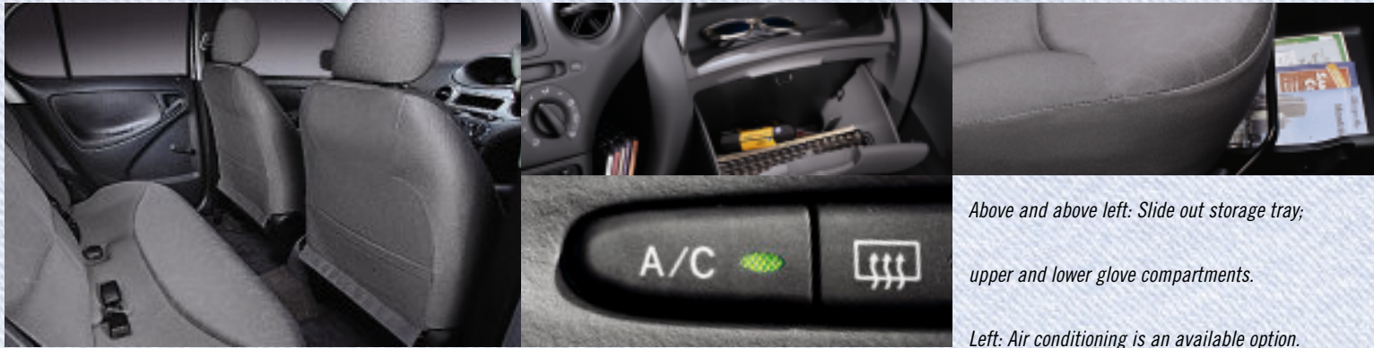
Above and above left: Slide out storage tray; upper and lower glove compartments.