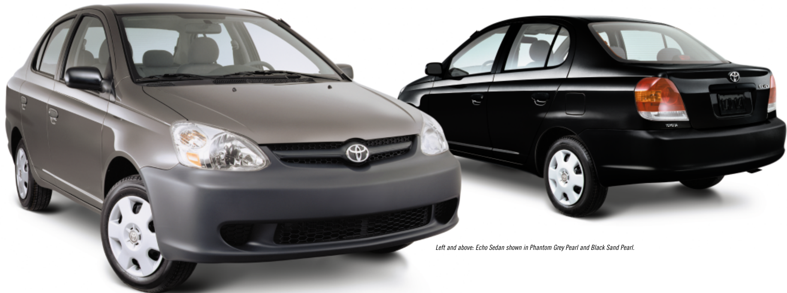
Left and above: Echo Sedan shown in Phantom Grey Pearl and Black Sand Pearl.