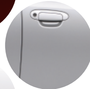
1E7 Silver Streak Mica