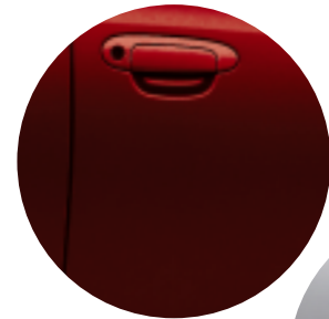
3P1 Impulse Red