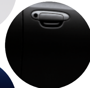
209 Black Sand Pearl