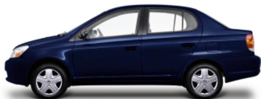
Echo Sedan shown in Indigo Ink.

*Toyota Canada Inc. Every effort has been made to ensure the specifications and equipment shown are accurate based on information available at time of printing. In some cases, certain changes in standard equipment, options or product delays may occur which would not be reflected in this brochure. Toyota Canada Inc. reserves the right to make these changes without notice or obligation. The Toyota website toyota.ca — or your Toyota Dealer is your best source for up-to-date information.