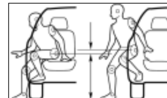
Above: Easy-to-read displays and indicator lights are clustered in a central position, shown with optional equipment. Left: Echo Sedan's high seating position makes getting in and out of the car a breeze.