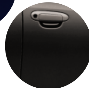
1E3 Phantom Grey Pearl