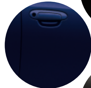
8P4 Indigo Ink