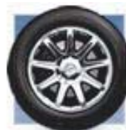
18-inch chrome-clad aluminum wheels standard on 300C