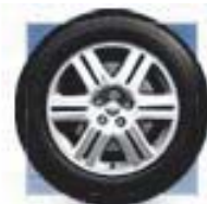
18-inch polished aluminum wheels standard on all 300 AWD models

For more information, please visit www.chrysler.com/300