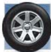
17-inch Machined aluminum wheels standard on 300 Touring