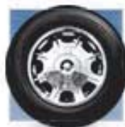
17-inch chrome-clad aluminum wheels standard on 300 Limited