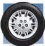
17-inch bolt-on wheel covers standard on 300