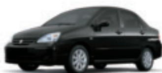
PEARL BLACK METALLIC