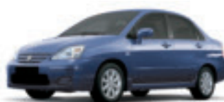
CAT'S EYE BLUE METALLIC