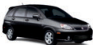
PEARL BLACK METALLIC