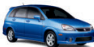
SAPPHIRE BLUE METALLIC