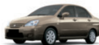
COOL BEIGE METALLIC