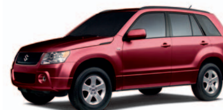
PEARL RED METALLIC