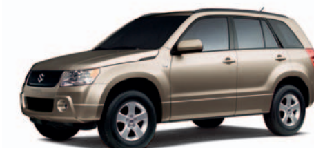
COOL BEIGE METALLIC