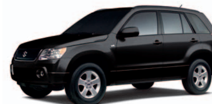
PEARL BLACK METALLIC