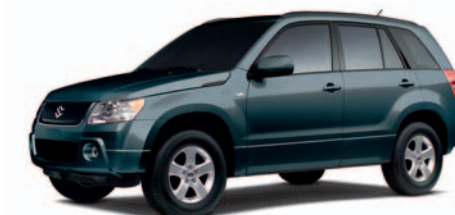
AZURE GREY METALLIC