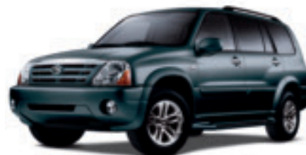
AZURE GREY METALLIC