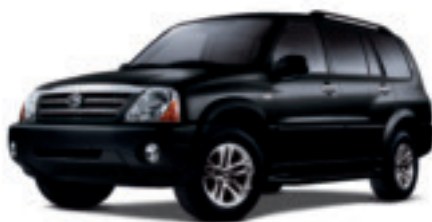
PEARL BLACK METALLIC