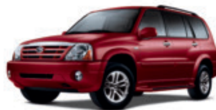
PEARL RED METALLIC