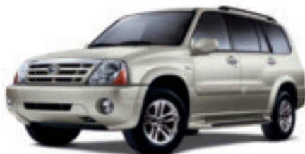
PEARL WHITE METALLIC