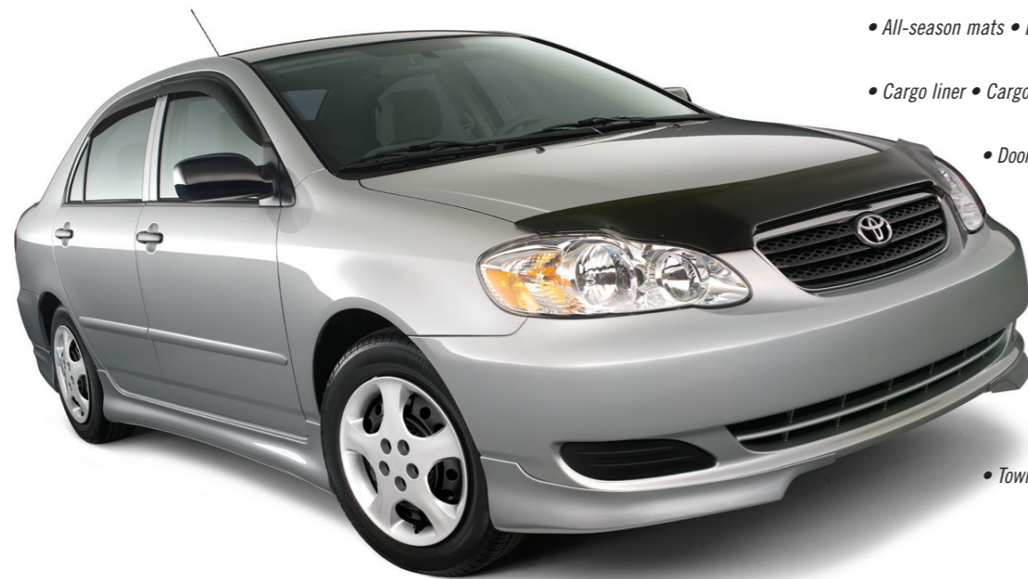
Corolla all dressed up with a rear lip spoiler, a hood deflector and a "body kit" which includes front and rear bumper chins and side skirts.