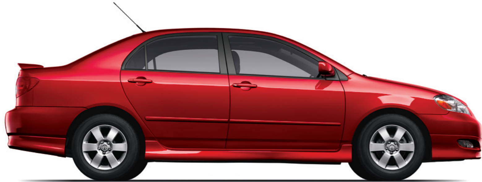
Above: Corolla Sport shown in Impulse Red.