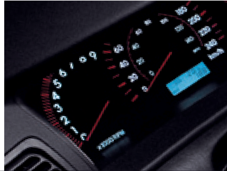
Right: Optitron Electronic Gauges – standard on XRS and LE.

Preceding spread: Corolla XRS shown in Phantom Grey Pearl.