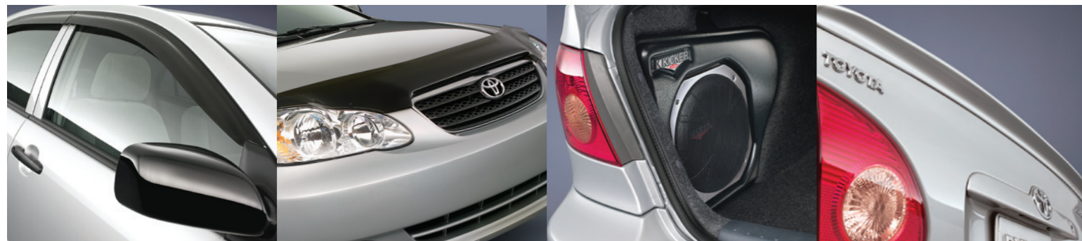
Side window visors

DRESS IT UP. DRIVE IT OUT. Express yourself. Take your Toyota Corolla to a whole new level of self-expression by adding any of the Toyota Accessories custom designed for your model. It's a great way to personalize your new vehicle, optimize its appearance and enhance the performance all at the same time. Ask your Toyota Dealer. To find the Toyota Dealer nearest you go to toyota.ca or call 1-888-TOYOTA-8 .