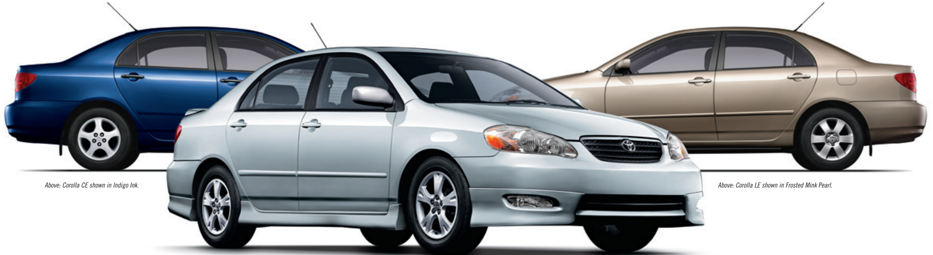
Above: Corolla CE shown in Indigo Ink.

TIME ISN'T THE ONLY THING THAT FLIES WHEN YOU'RE HAVING FUN.