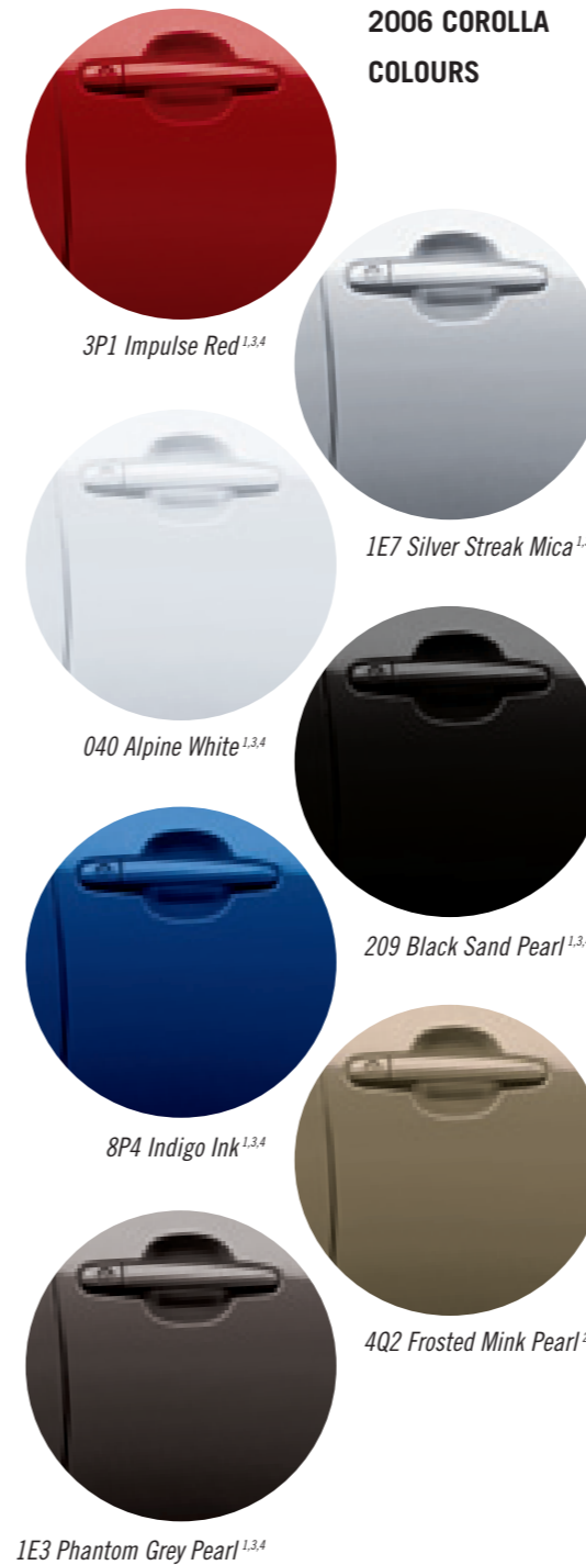
3P1 Impulse Red 1,3,4