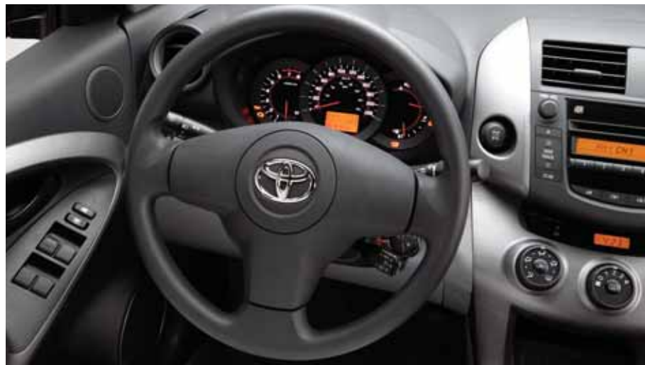
Above top: RAV4 Base model shown in Pacific Blue Metallic and above, the Base model dash.