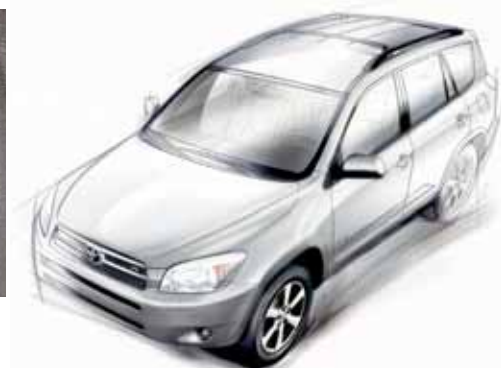
Above top: RAV4 Limited with optional leather interior.