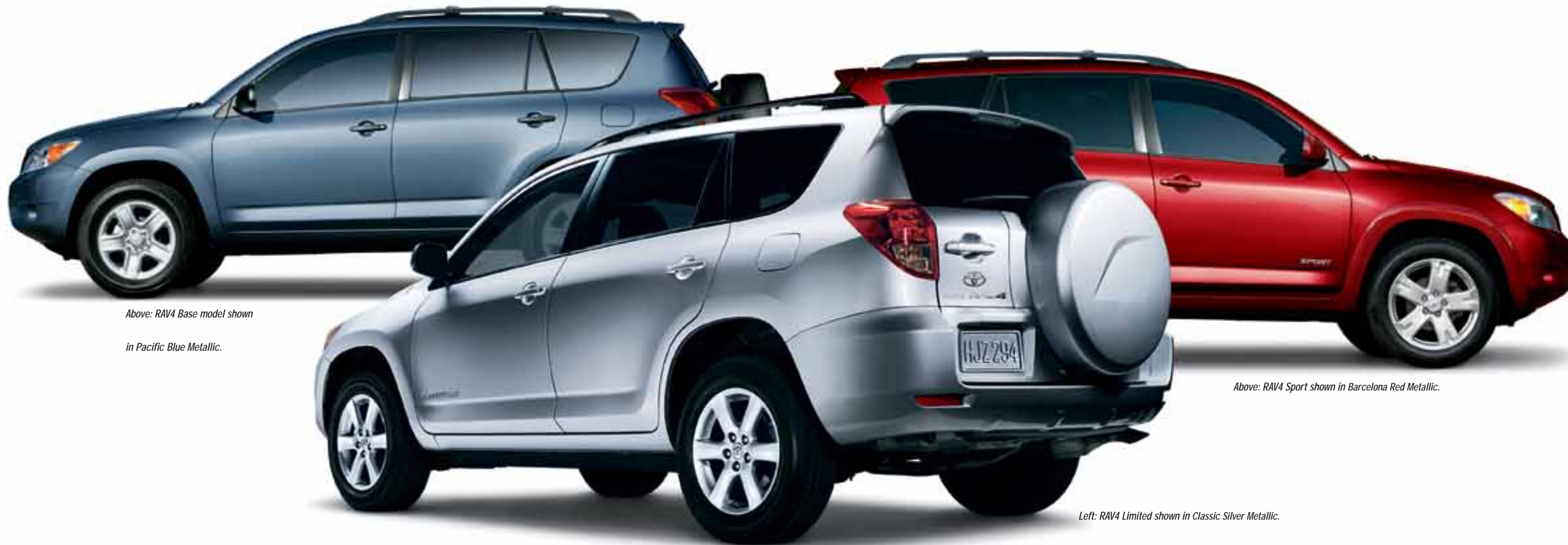
Above: RAV4 Base model shown in Pacific Blue Metallic.