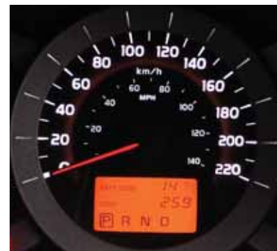
Above from left: RAV4 Sport, RAV4 Sport 18" alloy wheel, RAV4 Sport speedometer. Above top: RAV4 Sport shown in Barcelona Red Metallic.