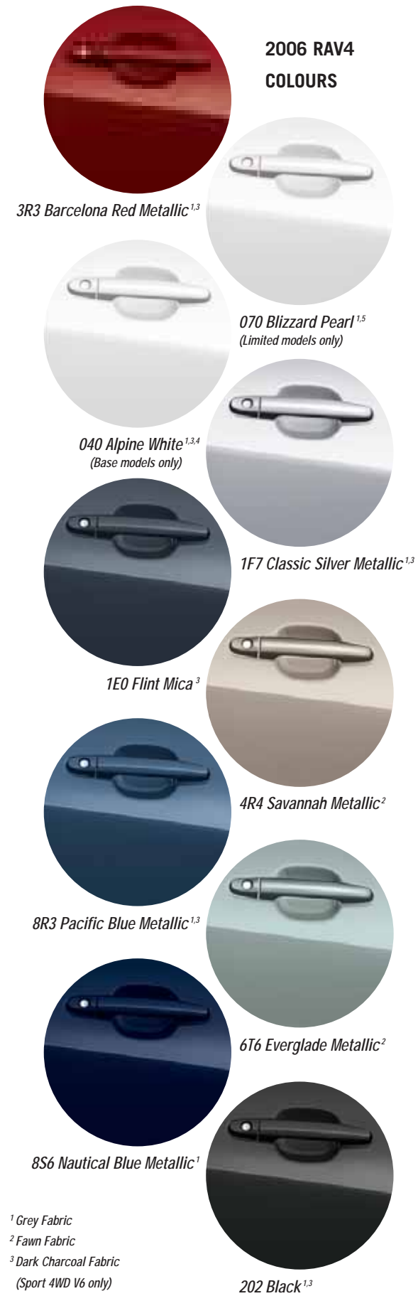
3R3 Barcelona Red Metallic 1,3