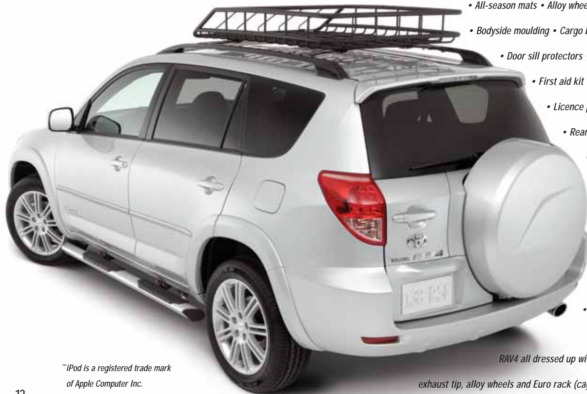
RAV4 all dressed up with side step bars, bodyside moulding, exhaust tip, alloy wheels and Euro rack (cage).

™iPod is a registered trade mark of Apple Computer Inc.