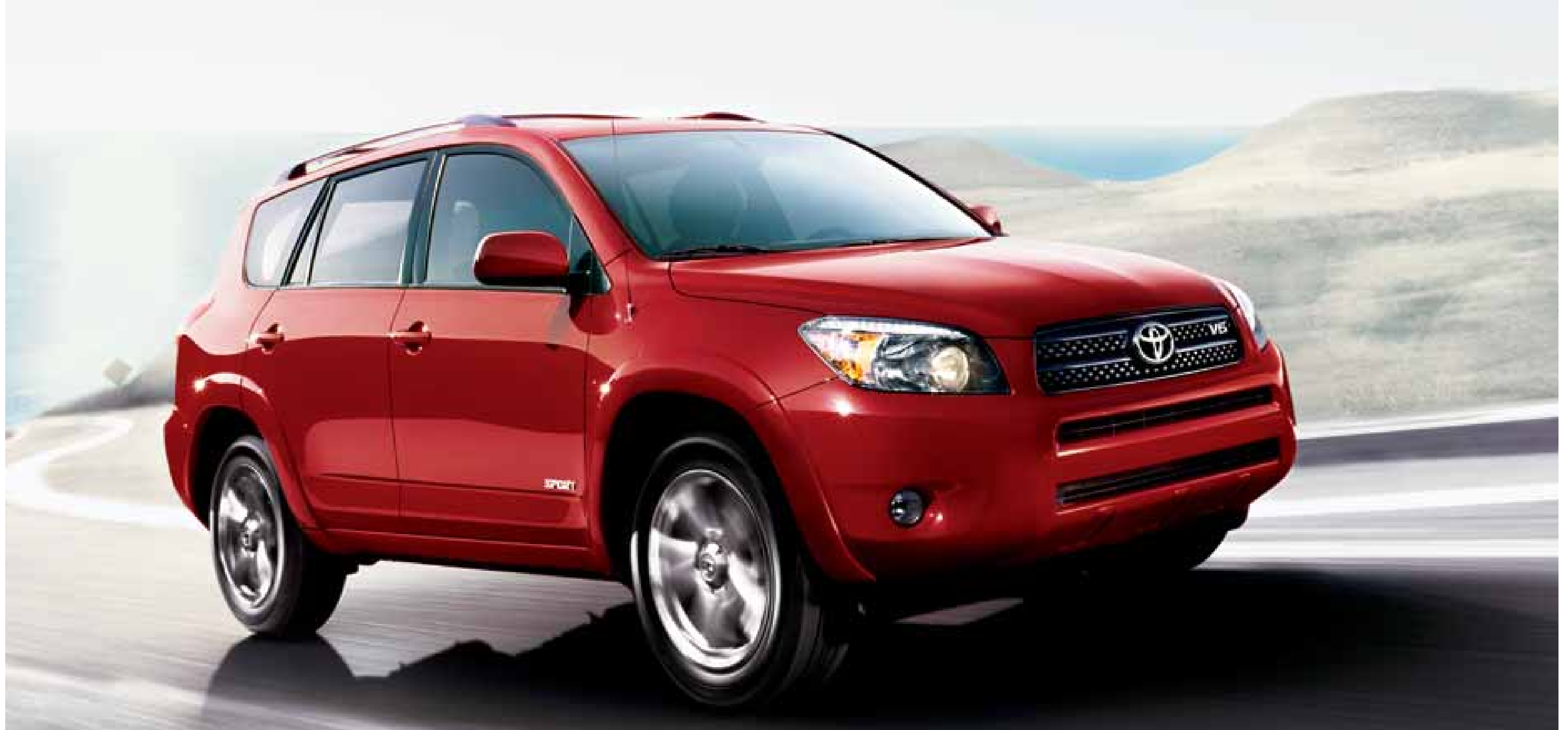
RAV4 SPORT 4WD V6