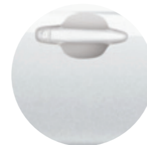
040 Alpine White 1,3