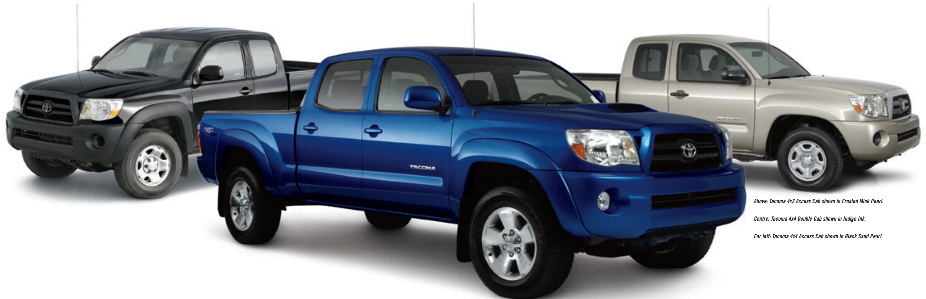
Above: Tacoma 4x2 Access Cab shown in Frosted Mink Pearl.

THERE'S A TACOMA TO OVERCOME EVERY OBSTACLE: MUD PITS, SAND DUNES, EVEN CITY STREETS.