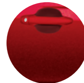
3L5 Radiant Red 1,2,3