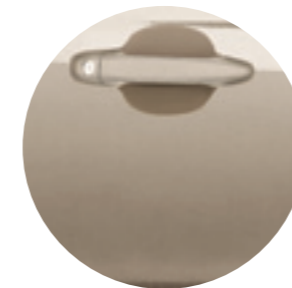
4Q2 Frosted Mink Pearl 2,3