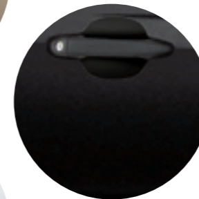
209 Black Sand Pearl 1