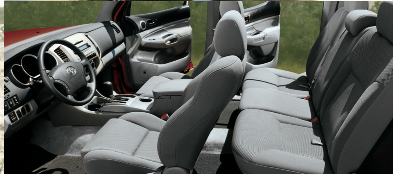
Left and facing page: Tacoma 4x4 Double Cab shown in Radiant Red. Below left: Tacoma Double Cab's capaciously comfortable interior.