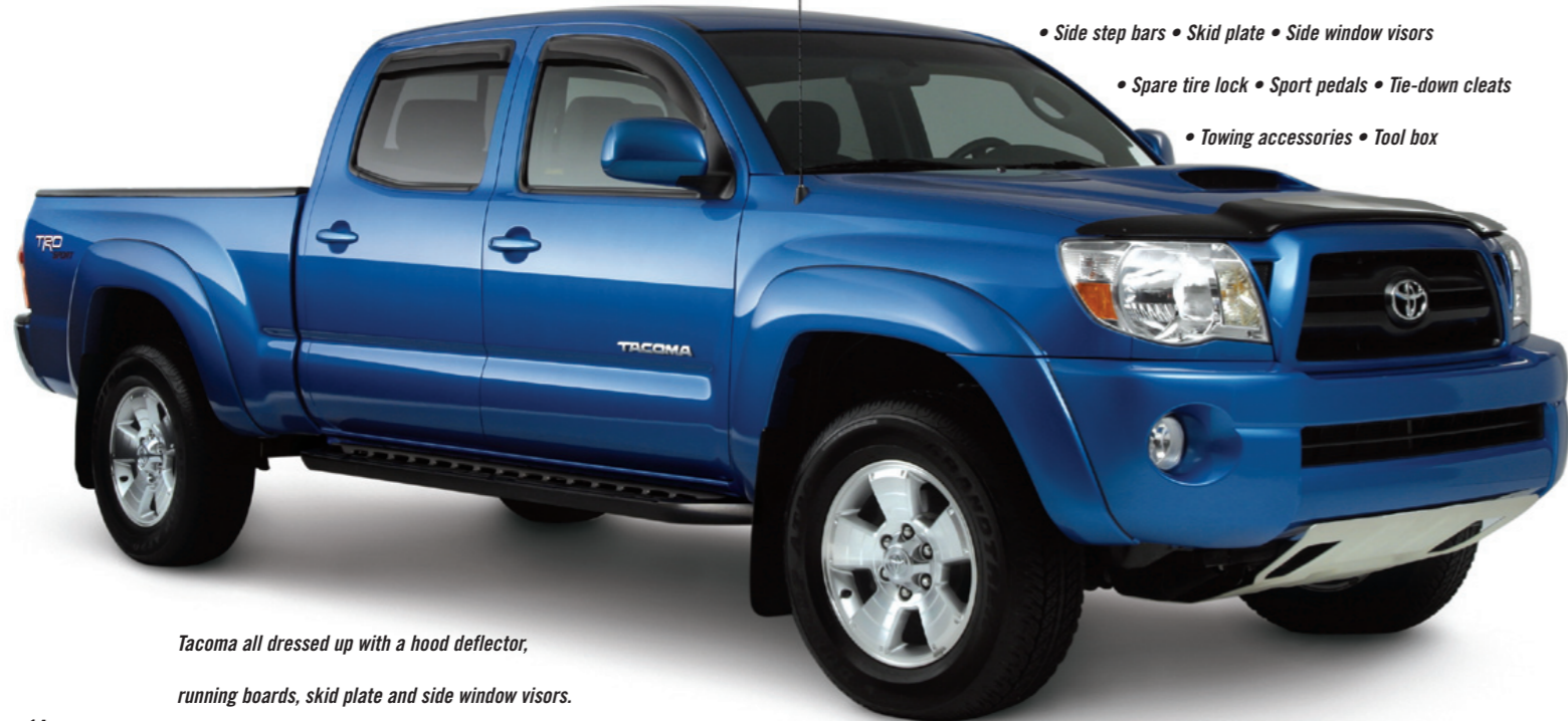
Tacoma all dressed up with a hood deflector, running boards, skid plate and side window visors.