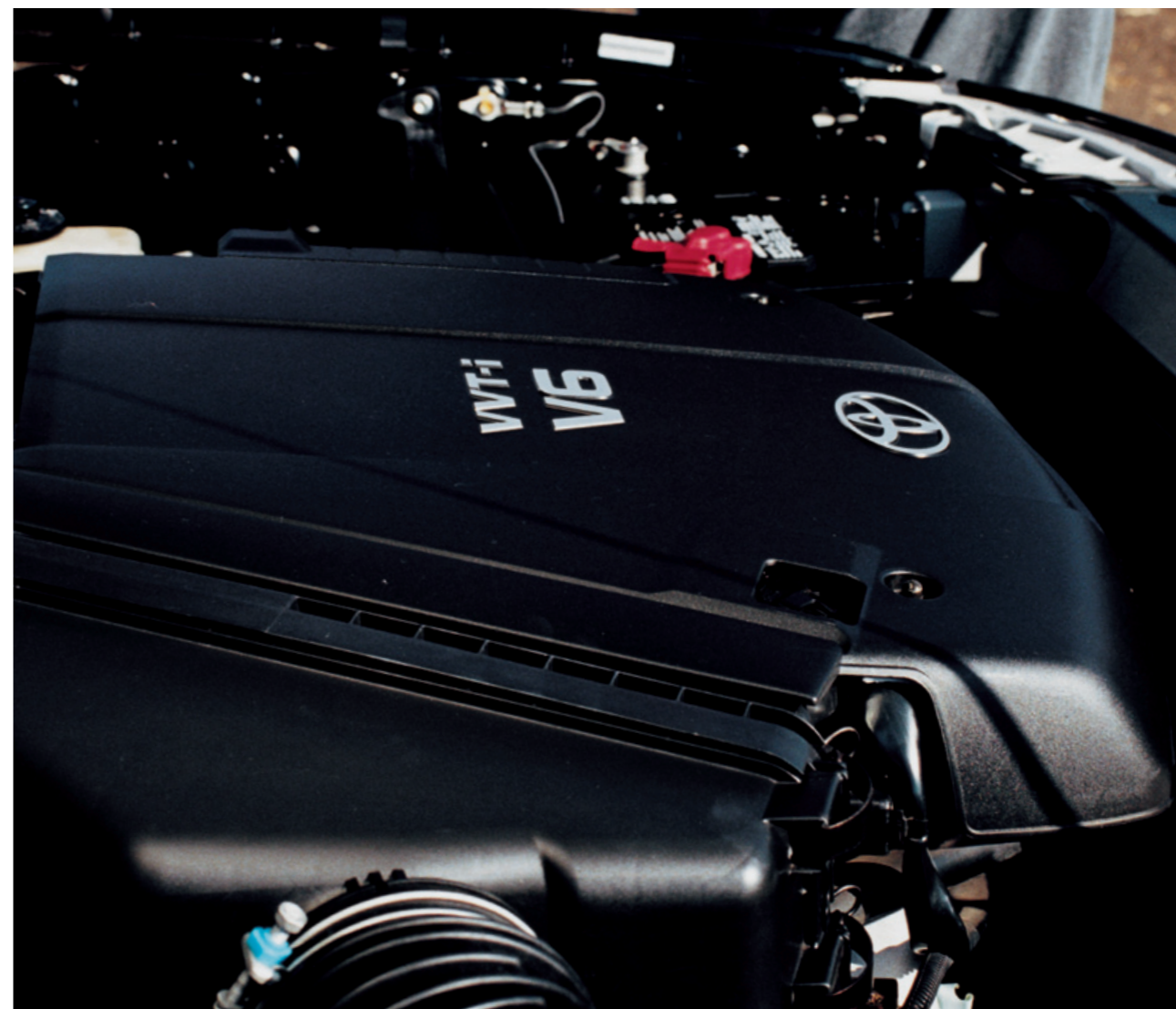
Left: Tacoma's powerful, 236 horsepower engine.

PERFORMANCE. Tacoma offers a 4.0 Litre, 6-cylinder, DOHC, 24-valve, Variable Valve Timing with intelligence (VVT-i), Sequential Multiport Electronic Fuel Injection engine, that churns out 236 horses and 266 lb.ft. of torque. Not to mention a whole lot of sand and mud. Combined with the TRD Off-Road & Towing Package (optional on Access Cab), you've got a truck that can get you and your friends wherever you want to go. Horsepower. An underrated anti-depressant.