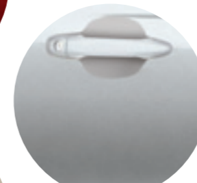
1E7 Silver Streak Mica 1,3