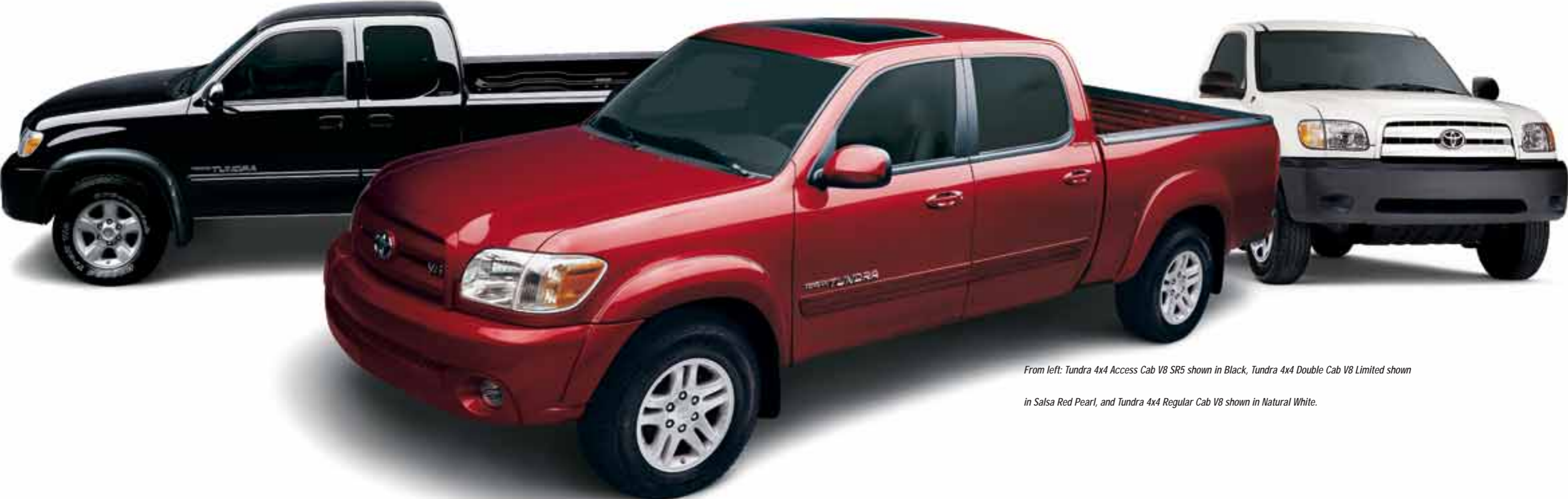
From left: Tundra 4x4 Access Cab V8 SR5 shown in Black, Tundra 4x4 Double Cab V8 Limited shown in Salsa Red Pearl, and Tundra 4x4 Regular Cab V8 shown in Natural White.