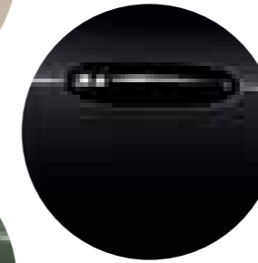
202 Black 1,2,4,5