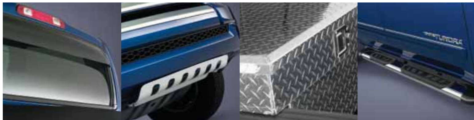
Rear window deflector

DRESS IT UP. DRIVE IT OUT. Explore your options. If you really want to make a new Toyota Tundra into “your new Toyota Tundra” then check out the Toyota Accessories available for your model that will personalize it for you. And whether you choose to enhance the look, the functionality or both, your Toyota Dealer will be happy to help you select the accessories that are right for you. To find the Toyota Dealer nearest you go to toyota.ca or call 1-888-TOYOTA-8.