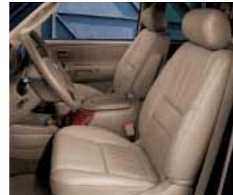
Above top: Tundra 4x4 Access Cab V8 SR5 rear interior.