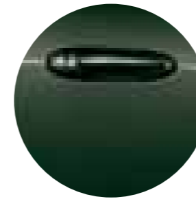
6T8 Timberland Mica 1