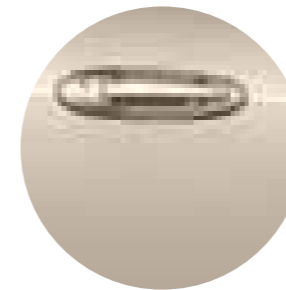
402 Frosted Mink Pearl 1,3