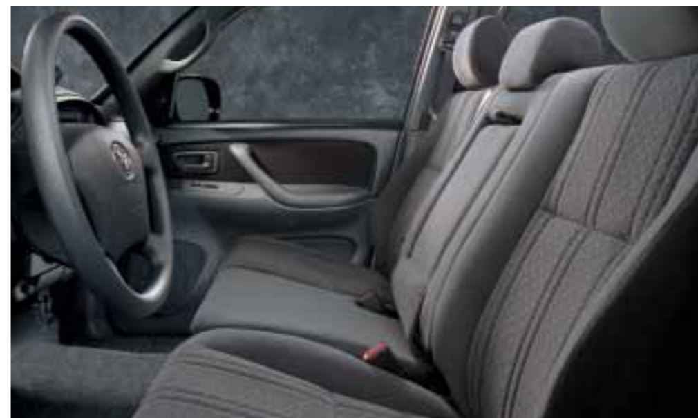
Above top: Tundra 4x4 Double Cab V8 Limited leather interior with Premium JBL AM/FM/Cassette, 6-disc in-dash CD changer with 8-speakers. Left: 4x4 Double Cab V8 SR5 bench seat shown in Dark Grey fabric.