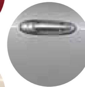
1D6 Silver Sky 2