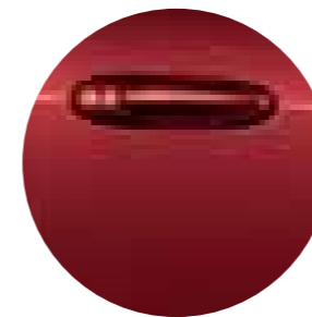
303 Salsa Red Pearl 1,2,4