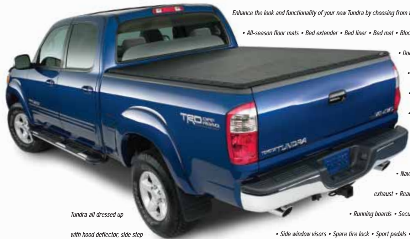
Tundra all dressed up