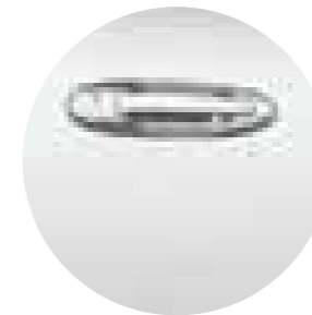
056 Natural White 1,2,4