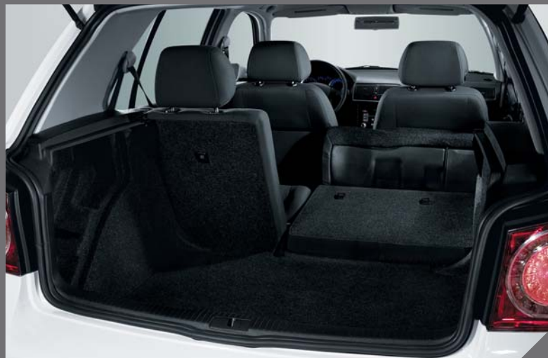
Split folding rear seat