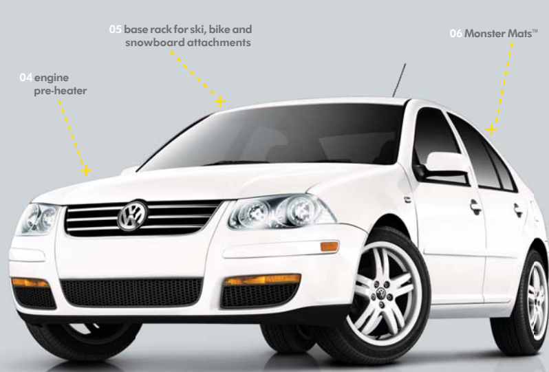
05 base rack for ski, bike and snowboard attachments