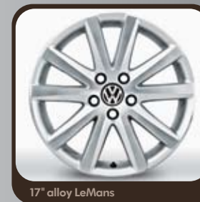
17" alloy LeMans

S = Standard P 1 = Comfortline Package P 2 = Highline Package O = Optional