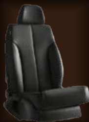
Leatherette Comfort Seat