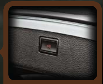
Power Tailgate button