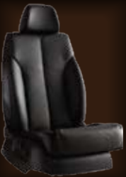
Leather Comfort Seat

Not radically different from the leather comfort seats, just upholstered in leatherette instead. Your skin will never know the difference.