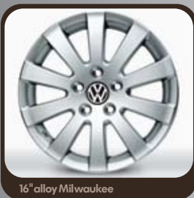
16" alloy Milwaukee