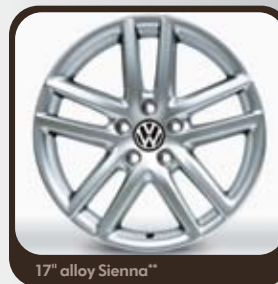
17" alloy Sienna**

*Airbags are supplemental restraints only and will not deploy under all crash circumstances. Always use safety belts and seat children in the rear, using restraint systems appropriate for their size and age. **Available accessory wheel.