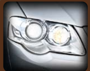
Bi-Xenon AFS Headlights