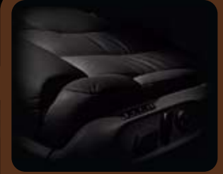
12-way power driver seat**