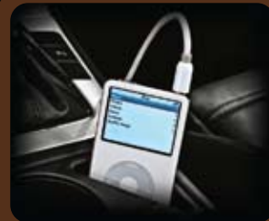
Auxiliary Input Jack

It's not easy to follow a Passat. Unless you're a satellite.