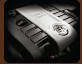
2.0T FSI Engine 10.1 L/100 km city/6.8 L/100 km hwy

At the heart of every Passat is the ultra efficient and uber powerful FSI engine. It's 30% more fuel efficient than conventional engines because it doesn't waste a single drop of fuel. Its straight injection system pumps fuel directly into the combustion chamber in both the Passat's 2.0 Turbo, 200hp, 4-cylinder turbo engine and its 3.6L, 280hp, 6-cylinder. Less waste. Less lag time. And that means lower emissions, lower L/100 kms (3.6L – 7.0L/100 km HWY, 4-cylinder – 6.8 L/100 km). What's more, the 3.6L engine is mounted transversely to fit into the same amount of space as the 4-cylinder, creating extra legroom inside the cabin. Faster. Smarter. Bigger. By German engineering.