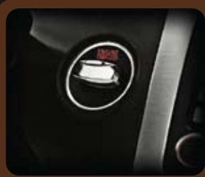
Push Start Ignition

Blue Dash Lighting Volkswagen's signature blue hue illuminates some very impressive numbers in the Passat. To truly appreciate them we suggest renting a test track or flight runway at night.