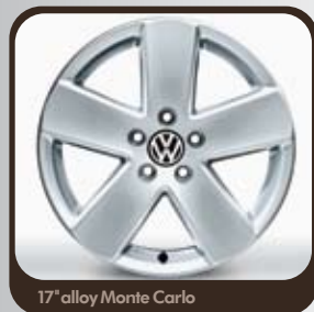
17" alloy Monte Carlo