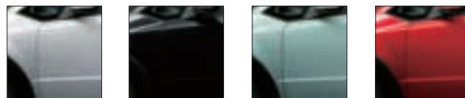
Silky Silver Metallic