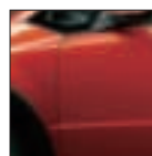
Copper Pearl Metallic