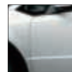
Pearl White Metallic