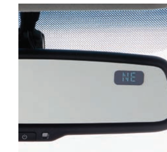
Electrochromic Mirror with Compass