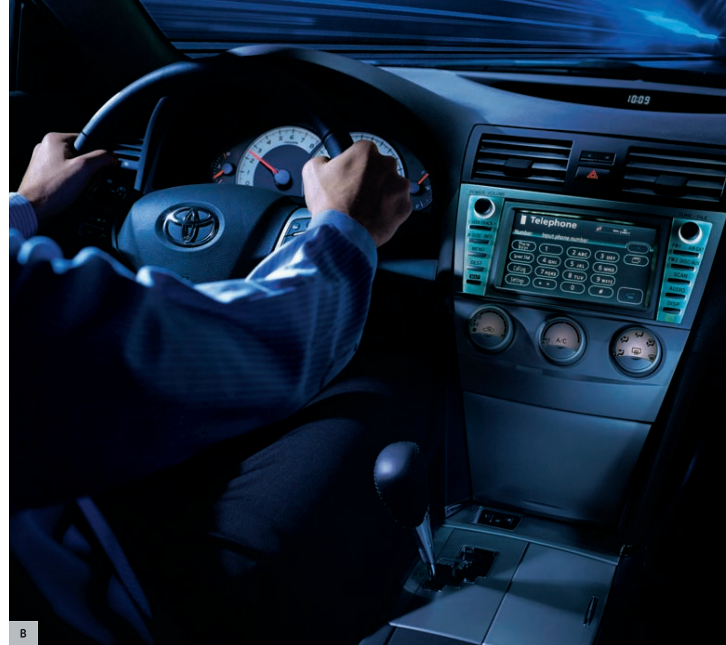
A SE V6 shown in Classic Silver Metallic. B SE V6 interior shown in Dark Charcoal with optional equipment. C Available DVD navigation system. 5

The sleek and sporty lines of Camry SE define its personality and fuels your passion for performance. The available 268 hp 3.5-litre Dual VVT-i V6 engine proves it, boasting a 6-speed automatic transmission with a sequential Multi-Mode shifter. Camry SE is not content just to pass other sedans. It strives to surpass them all.