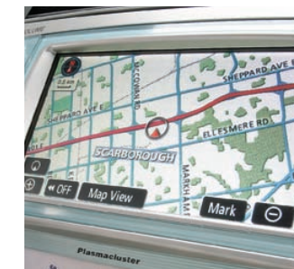
Navigation System 5