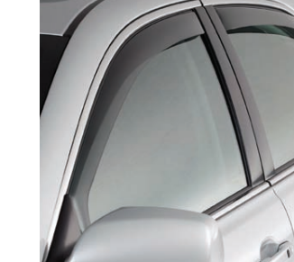
Side Window Visors