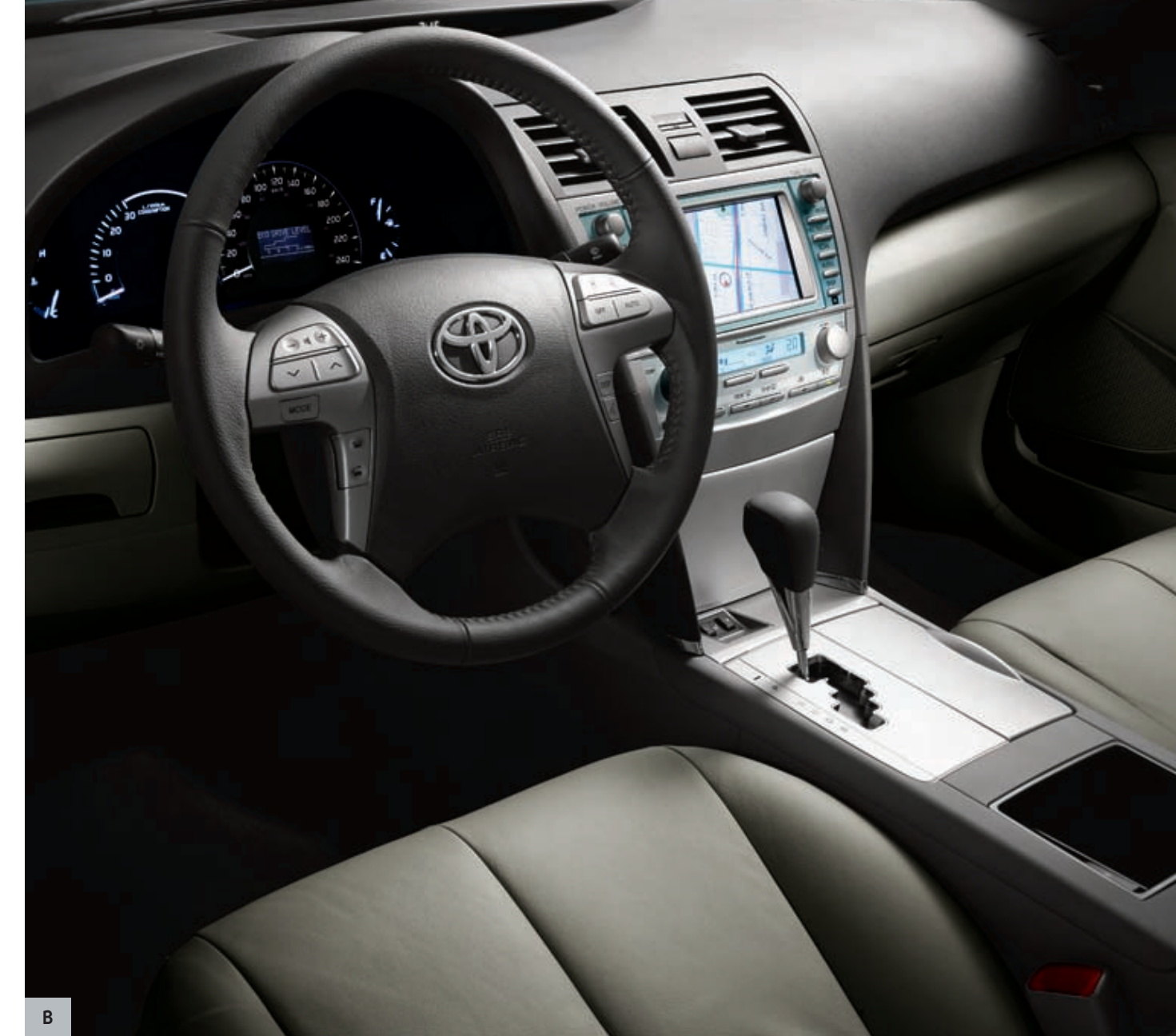
A Camry Hybrid shown in Magnetic Grey Metallic. B Camry Hybrid interior shown in Ash leather and optional voice-activated DVD navigation system. 5

Clean lines. Cleaner air. Clean conscience. Camry with Hybrid Synergy Drive produces nearly 70% fewer smog-forming emissions. 1 And, with a 5.7/5.7 city/highway L/100 km rating, Camry Hybrid lets you stretch your trips between fill-ups, giving you more kilometres on a tank.