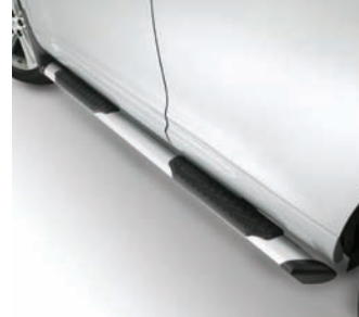
Side Step Bars