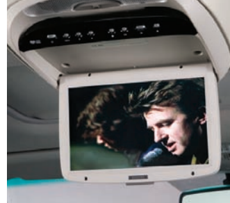
10.2" iPod™ Ready DVD