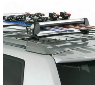
Roof Rack Ski Adapter