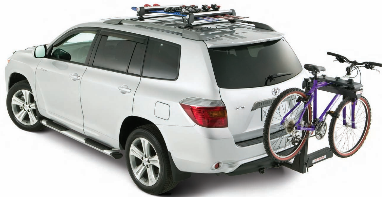
ACCESSORIES SHOWN Highlander all dressed up with Roof Rack Ski Adapter, Side Step Bars, Side Window Visors and 2" Swing Away Bike Adapter.