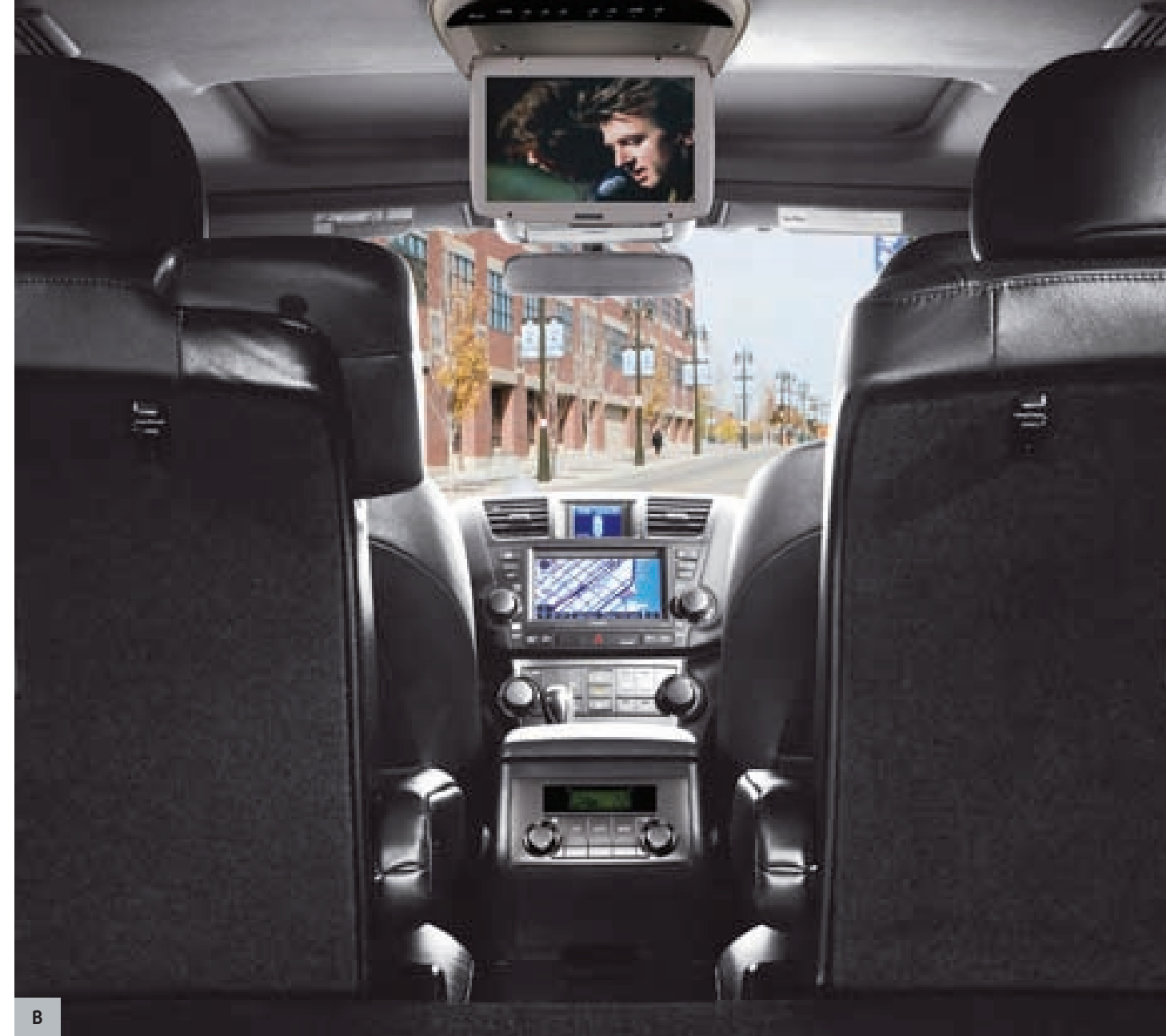
A 4WD V6 Sport shown in Magnetic Grey Metallic. B 4WD V6 Sport interior shown in Black leather with accessory DVD navigation 6 and rear seat DVD entertainment system.

Highlander 4WD V6 Sport makes a strong design statement from every angle with sporty features including a sleek rear spoiler, 19-inch aluminum alloy wheels and sport-tuned suspension. Feel the performance of the 3.5-litre 270-hp V6 engine and full-time 4WD system, while enjoying the power tilt/slide moonroof with sunshade and heated driver and front passenger captain seats.