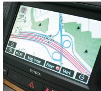
Navigation System 6