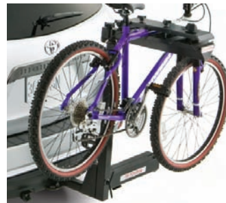
2" Swing Away Bike Adapter