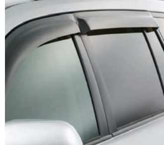
Side Window Visors