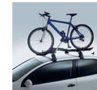
Barracuda Bike Rack