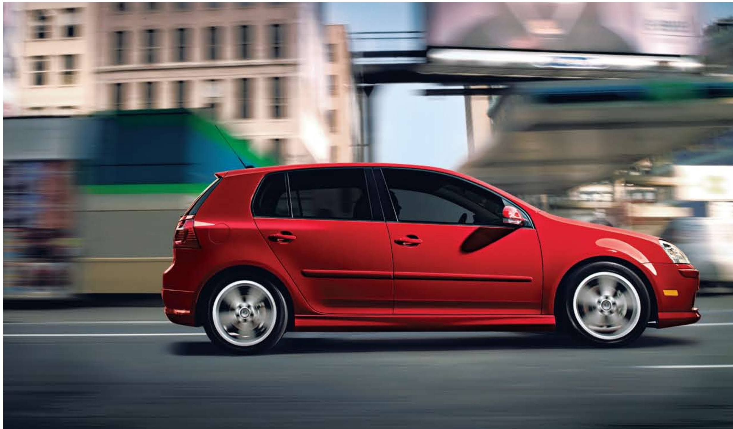
Vehicle shown with sport styling body kit and 17" Goal wheels.