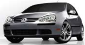
United Grey Metallic