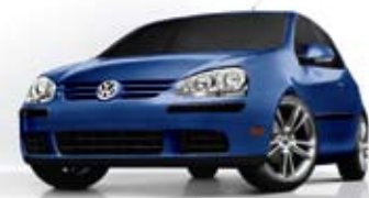
Shadow Blue Metallic