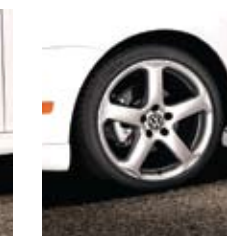
Karthoum 18" alloy wheels