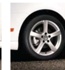
Goal 17" alloy wheels