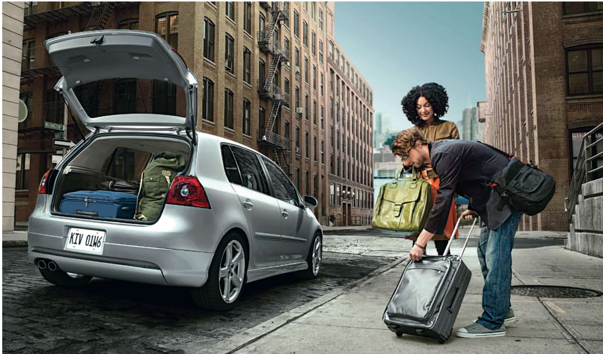
Vehicle shown with sport styling body kit and 18" Karthoum wheels.