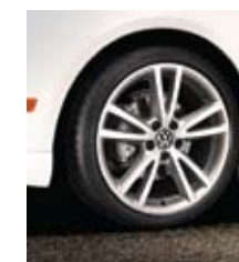
Vision V 18" alloy wheels