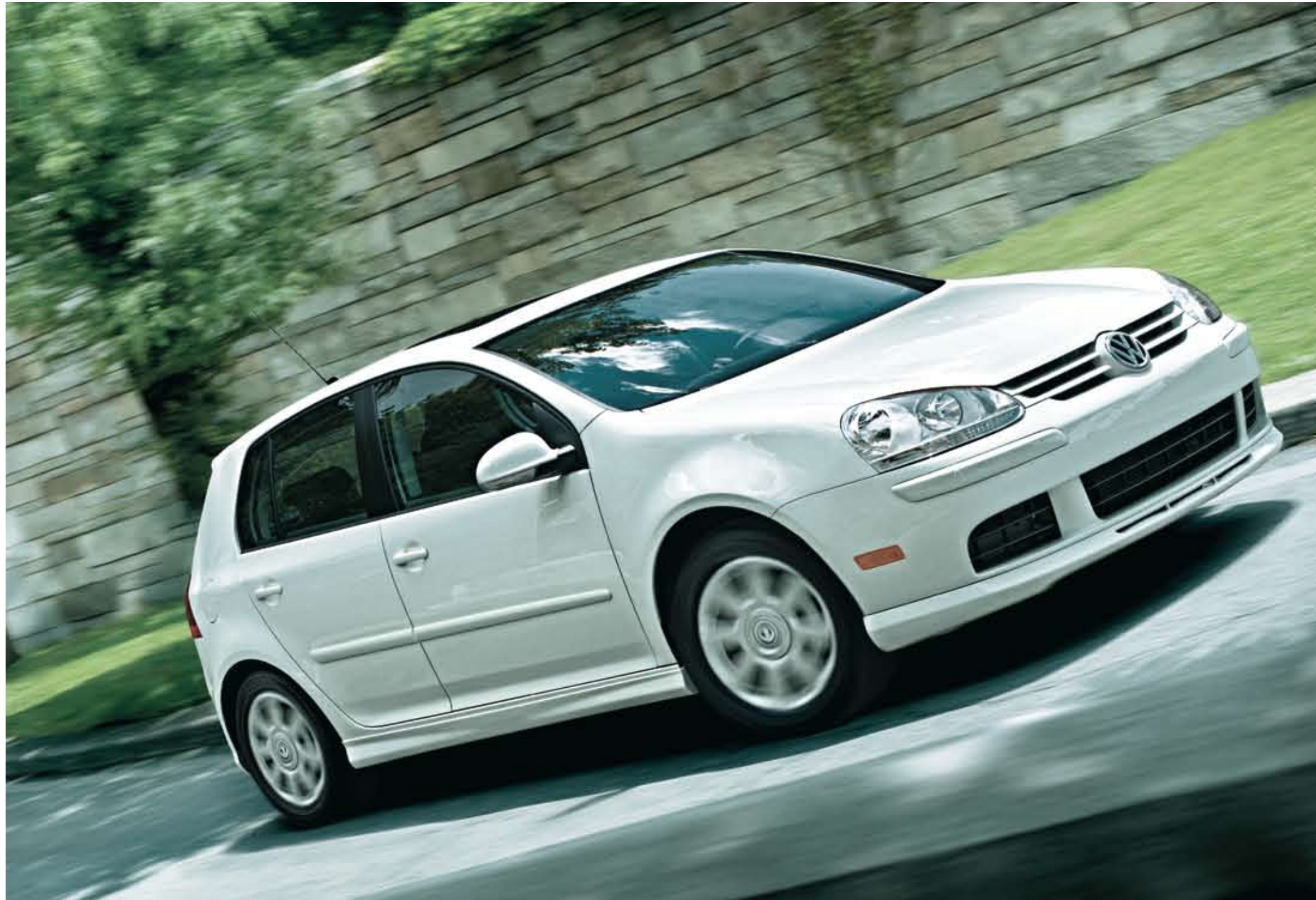
Vehicle shown with sport styling body kit.