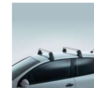
Base Roof Rack