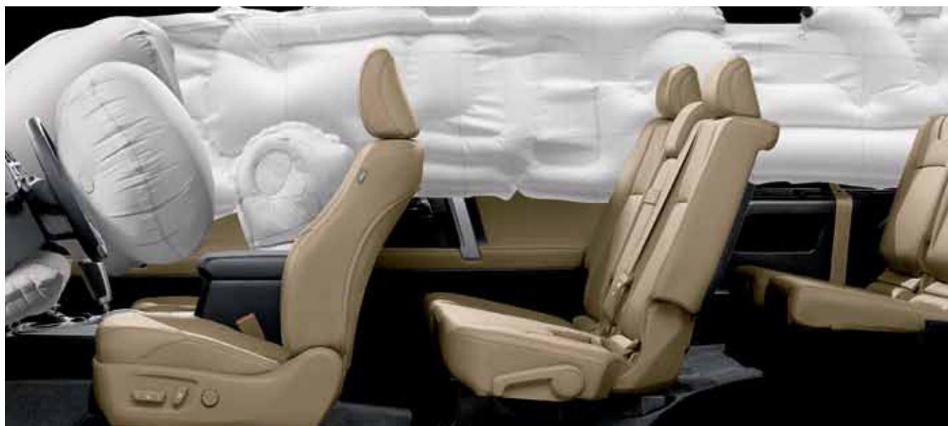
4Runner SR5 V6 interior with Limited Package shown in Sand Beige Leather.

Vehicles that take on difficult terrain have to be more than just tough. The new 4Runner comes standard with eight airbags, including front seat-mounted side airbags and front and second-row Head/Roll-Sensing Side Curtain Airbags (RSCA) with cut-off switch.