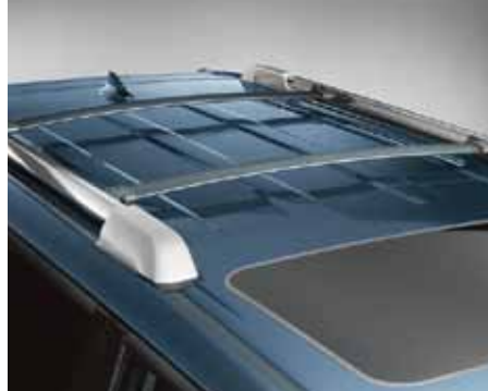
Roof Rail Crossbars