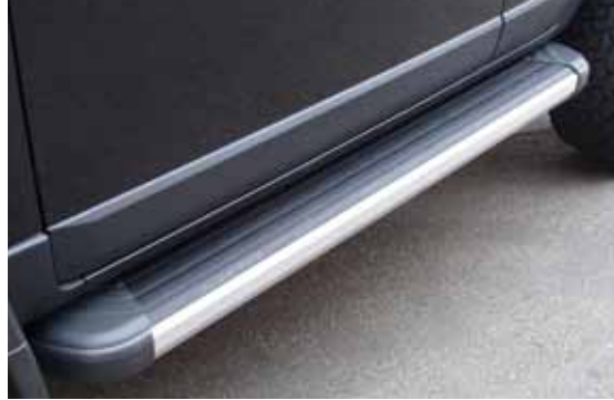
Running Boards Not only do running boards assist in entering a vehicle, they also help protect the lower body from road debris.