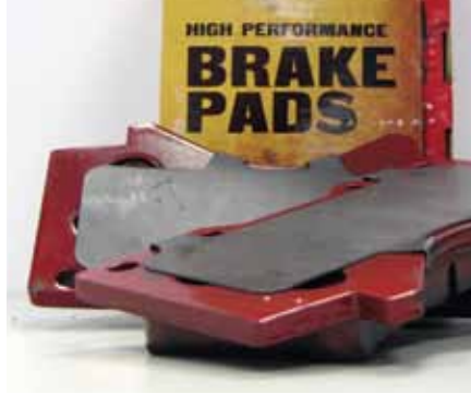
TRD Brake Pads