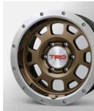
TRD 16" Off-Road Beadlock Style Wheel