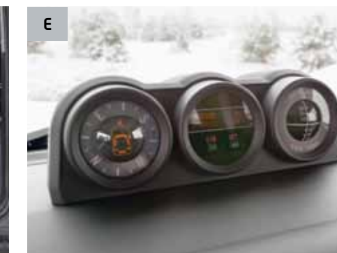
C. Steering wheel with Bluetooth ®3 and audio controls. D. The spacious 1.89 cubic metres of cargo space comes in handy for storing all your gear. E. Available with the Off-Road Package, the dash mounted multi-information display features an outside temperature gauge, inclinometer and compass to help you familiarize yourself with your outside surroundings.