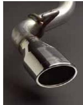
TRD Cat Back Exhaust