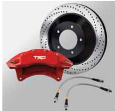
TRD Big Brake Kit The TRD high performance brake kit delivers confidence-inspiring performance, as well as improved stopping distance and enhanced pedal feel.