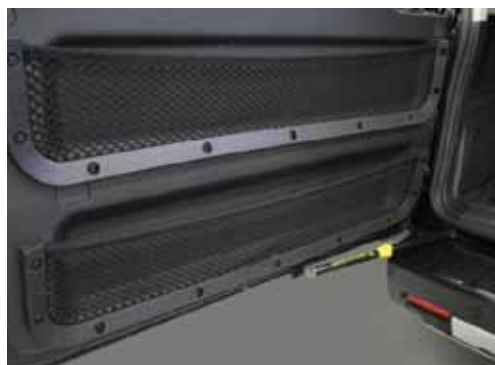
Rear Door Storage The Rear door storage nets are perfect for securing small to medium sized objects.