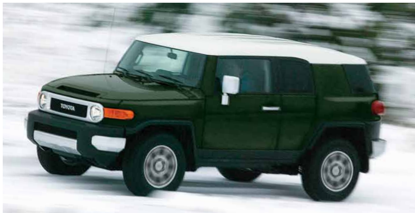
FJ Cruiser shown in Army Green.

The rugged FJ Cruiser is loaded with advanced safety features to help keep you in control, whether you're cruising the smooth city roads, or tackling the Canadian wilderness. With the safety of six standard airbags, coupled with the ample performing power of FJ's V6 engine, packing 270 lb ft 5 of torque, you'll have the peace of mind to focus on the adventurous roads ahead.