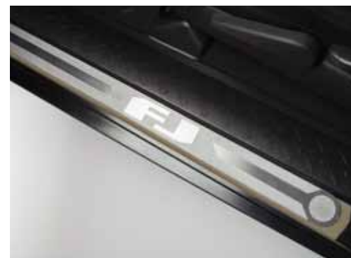
Door Sill Protectors These stylish door sill protectors are not only functional, but offer a styling accent that is immediately noticed when entering the vehicle.