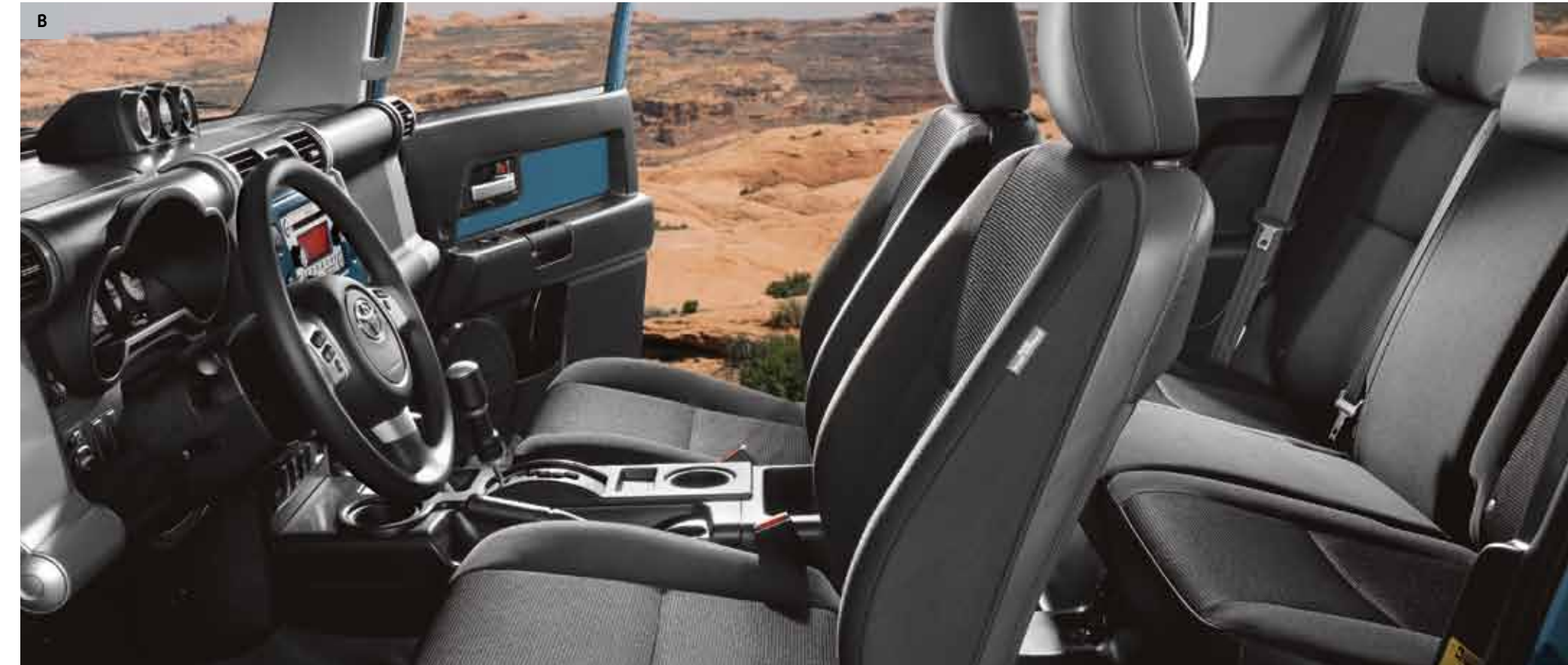
FJ Cruiser shown in Silver Fresco Metallic.