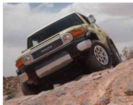
FJ Cruiser with optional equipment shown in Quick Sand.

CORROSION PERFORATION - 5 YEARS UNLIMITED DISTANCE Any sheet metal found, under normal use, to have developed a perforation from corrosion due to defects in material or workmanship.