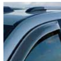
Side Window Air Deflectors