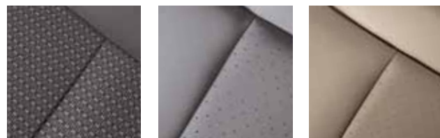
Aunde Cloth, Aero Grey TL