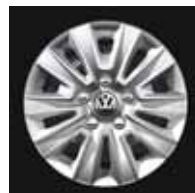
16" Thistle Steel Wheel TL