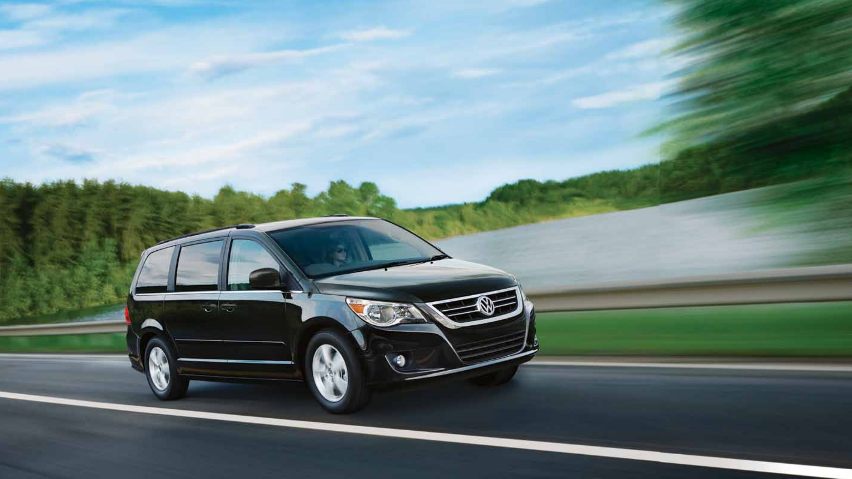
Highline shown with optional 17" alloy wheels.