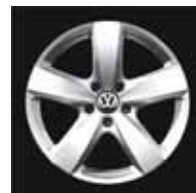
17" Soho Alloy Wheel CL/HL Optional