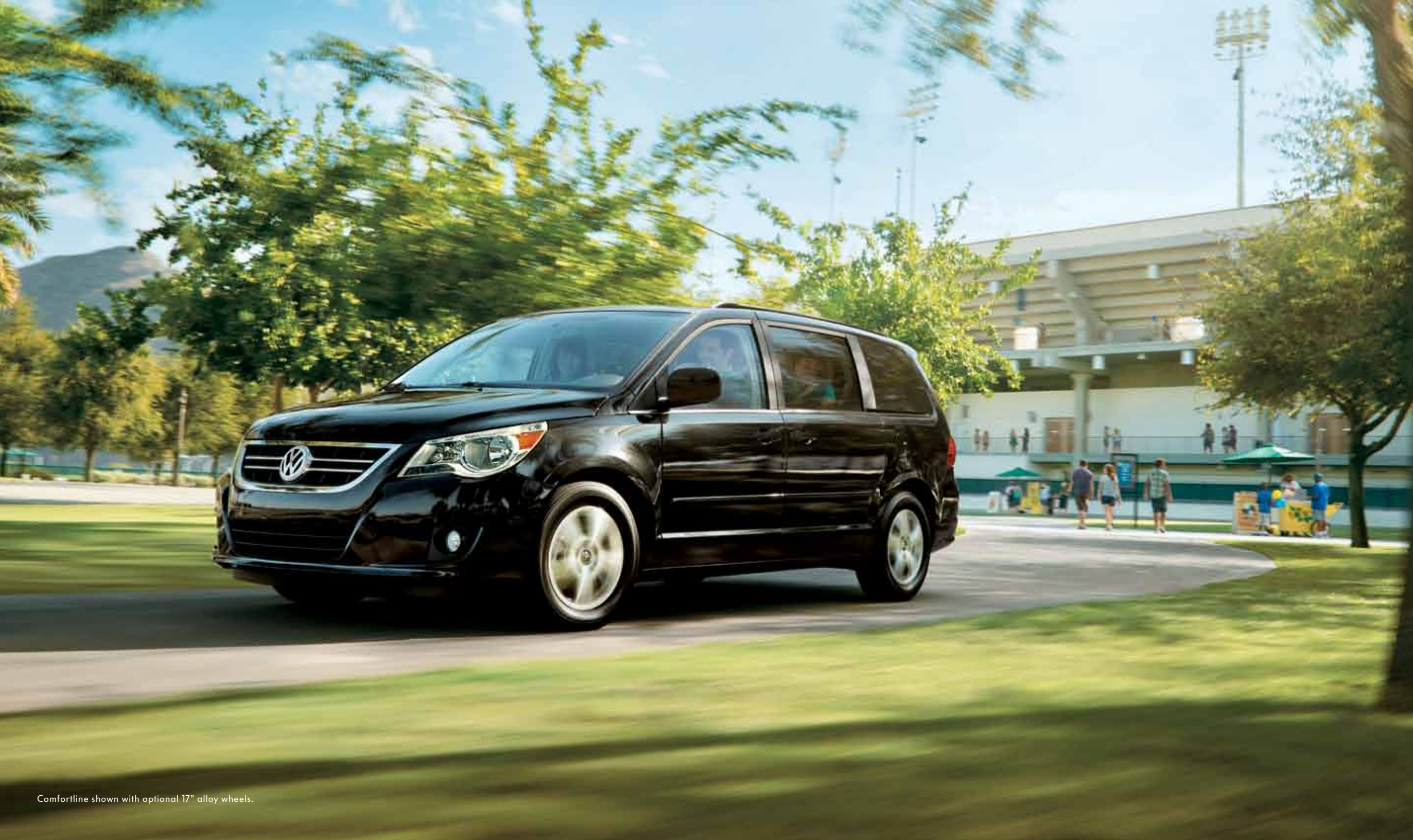
Comfortline shown with optional 17" alloy wheels.