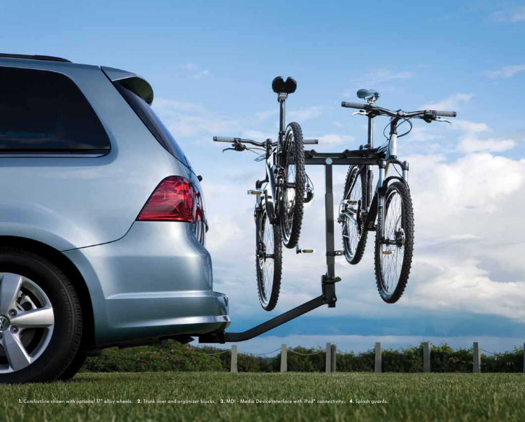
1. Comfortline shown with optional 17" alloy wheels. 2. Trunk liner and organizer blocks. 3. MDI - Media Device Interface with iPod® connectivity. 4. Splash guards.