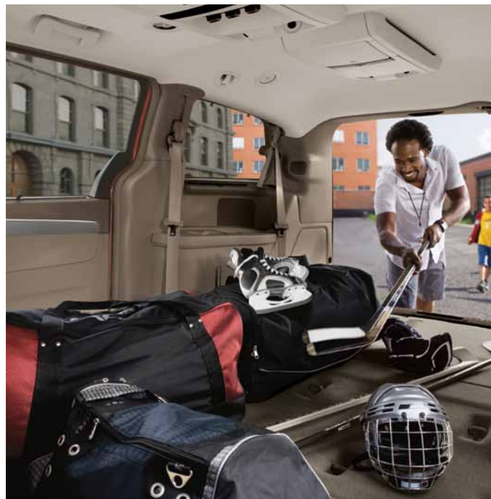
2011 Routan > Interior/Engine