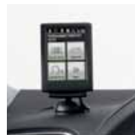
Bluetooth® Hands-Free Facility