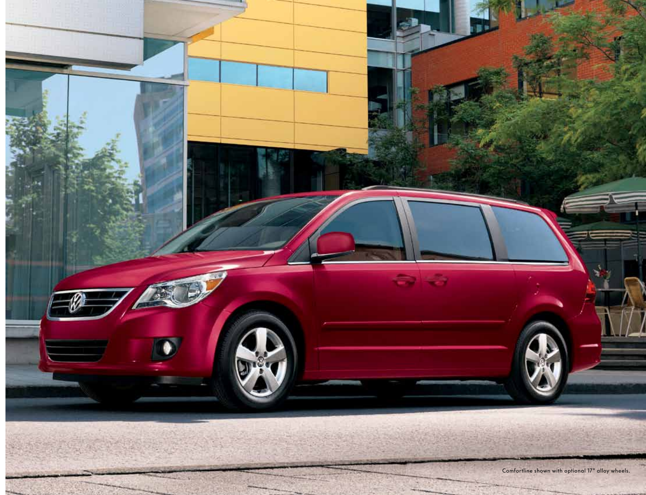
Comfortline shown with optional 17" alloy wheels.