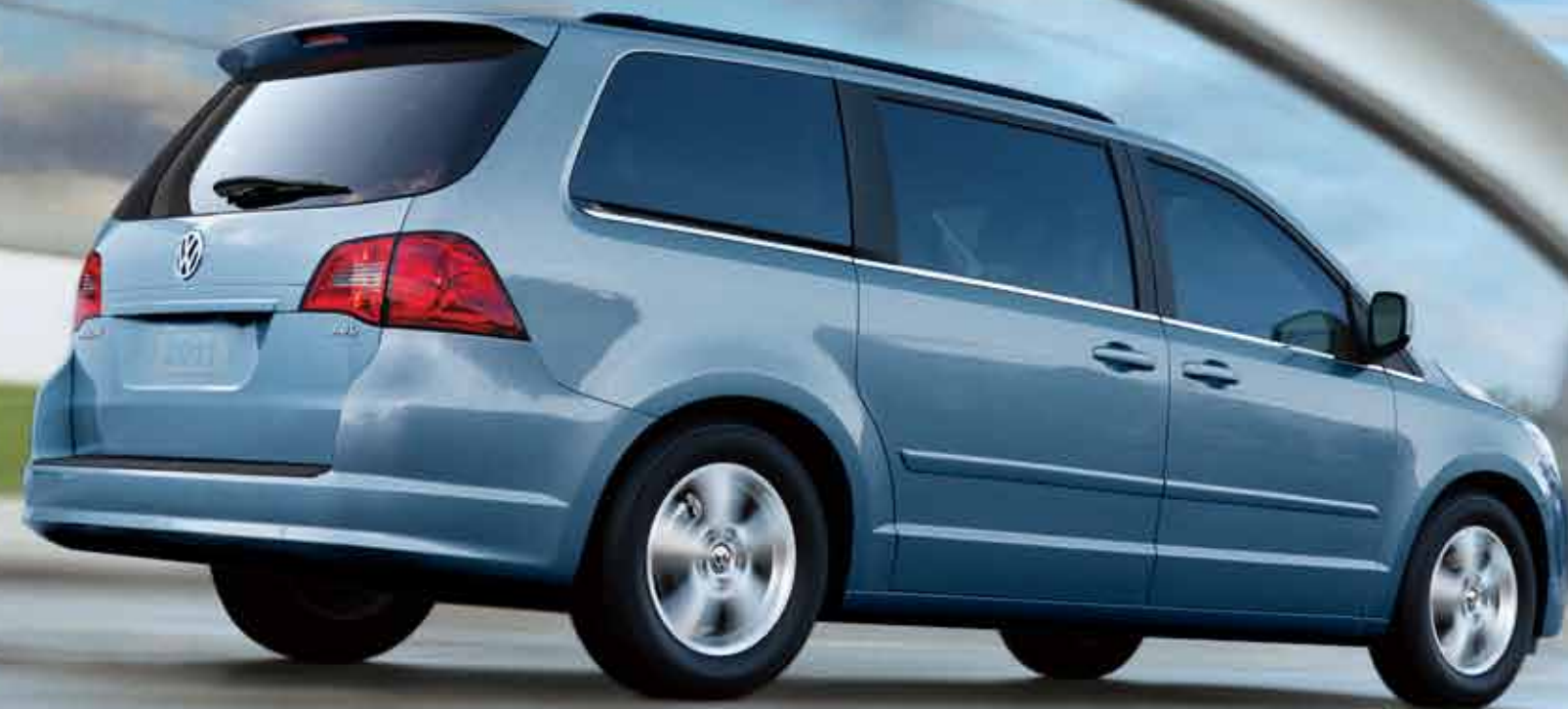
Comfortline shown with optional 17" alloy wheels.