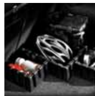
Trunk Liner and Organizer Blocks