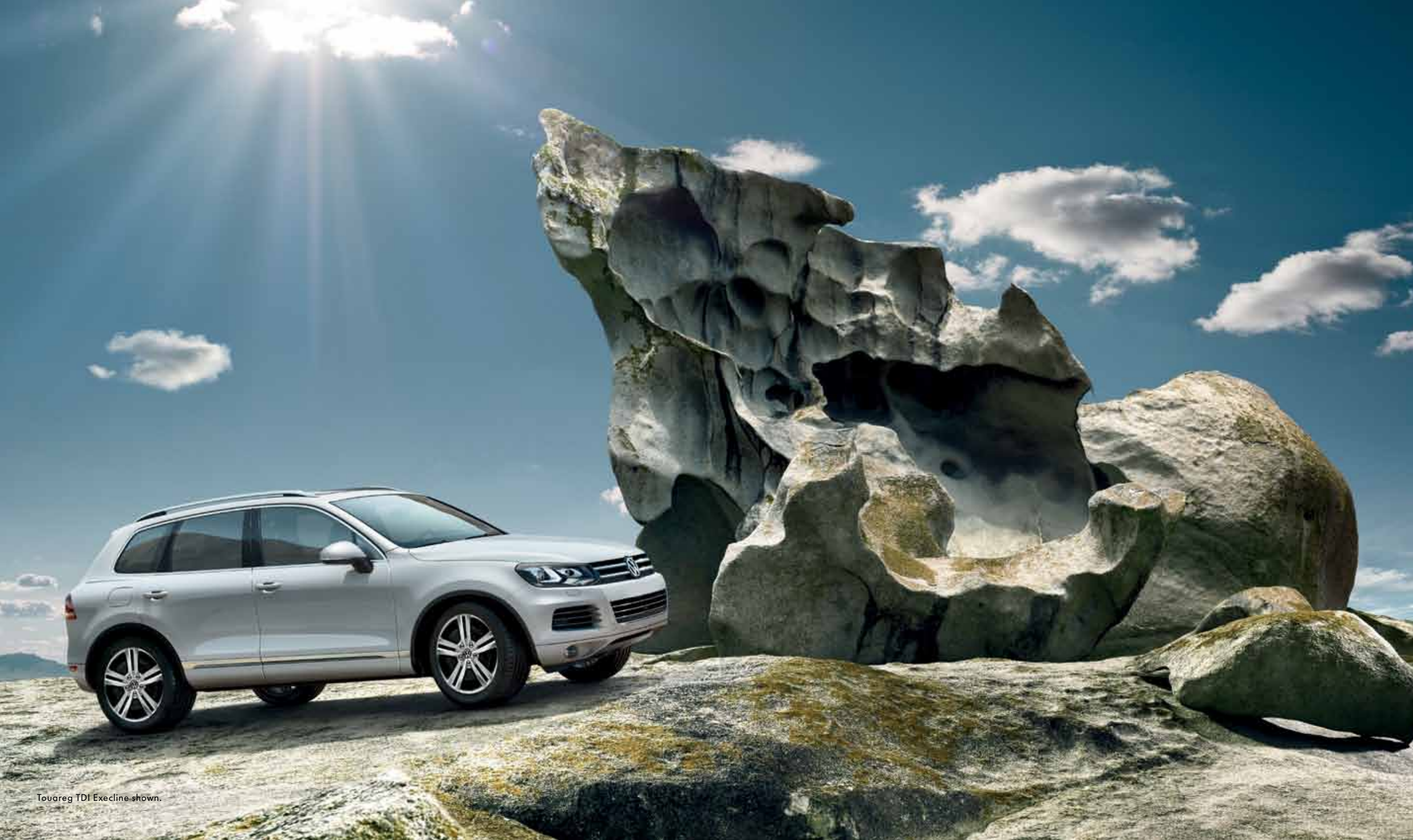
Touareg TDI Execline shown.