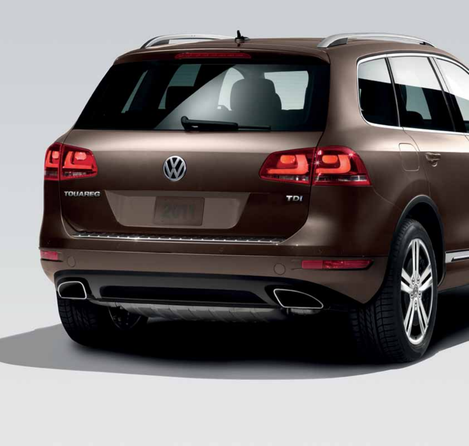
1. Touareg TDI Clean Diesel Execline.