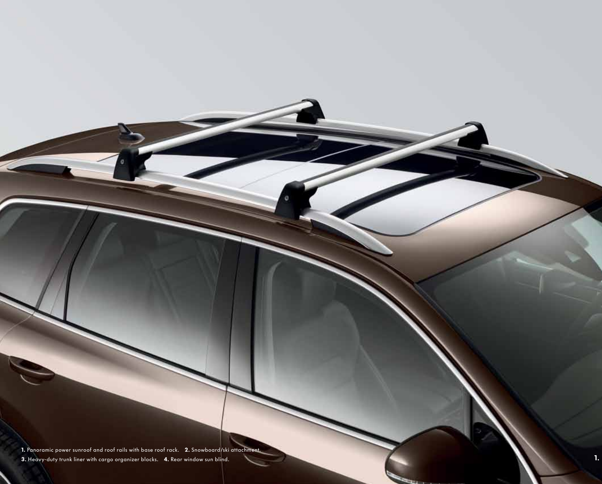
1. Panoramic power sunroof and roof rails with base roof rack. 2. Snowboard/ski attachment. 3. Heavy-duty trunk liner with cargo organizer blocks. 4. Rear window sun blind.