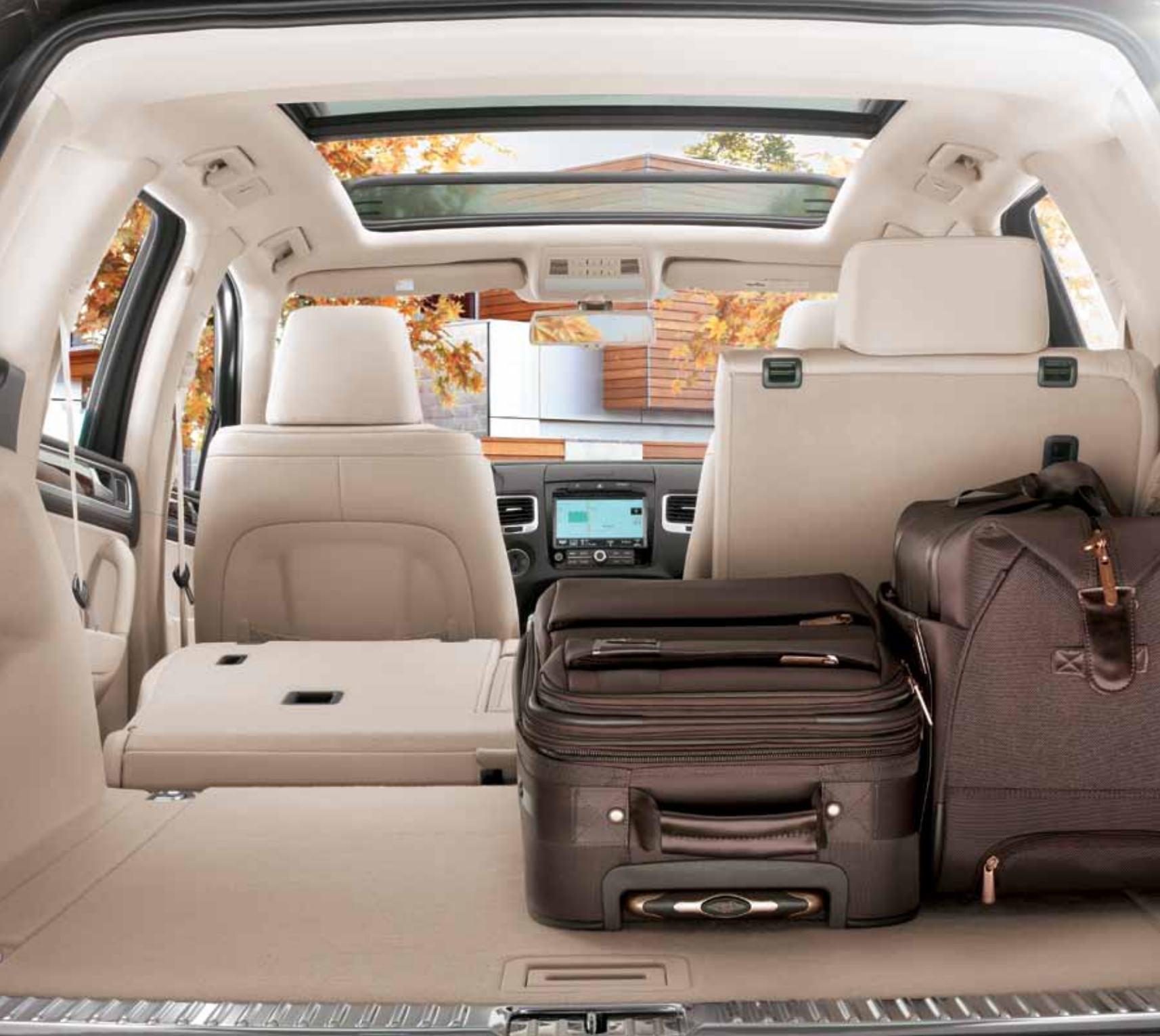
1. 60/40 split-folding rear seats. 2. Panoramic power sunroof. 3. Sliding rear seats with recline.