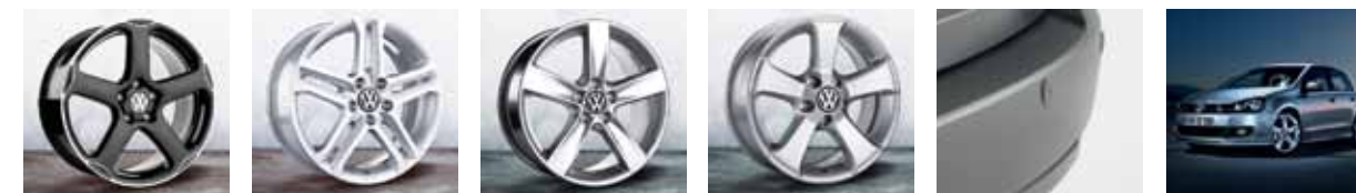
18" Karthoum alloy wheel, black