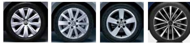
15" wheel with full wheel cover TL and TL+