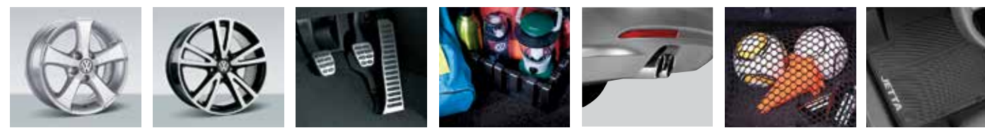
16" Sima wheel