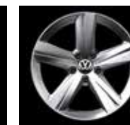
17" Sonoma alloy wheel CL