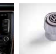
Valve stem caps