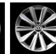
17" Salamanca alloy wheel HL