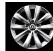
16" San Jose alloy wheel TL