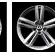
18" Bristol alloy wheel Sport Package