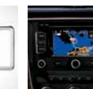
RNS 510 navigation system