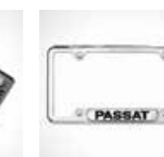
Polished stainless steel license plate frame – Passat