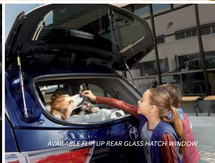
AVAILABLE FLIP UP REAR GLASS HATCH WINDOW