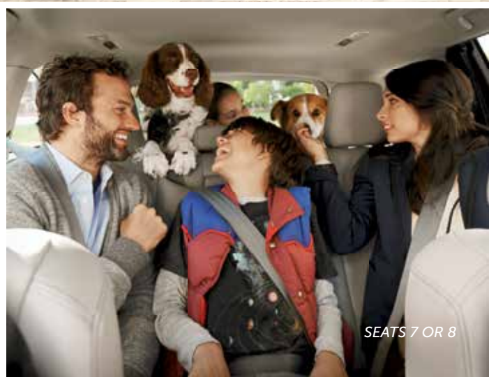
SEATS 7 OR 8