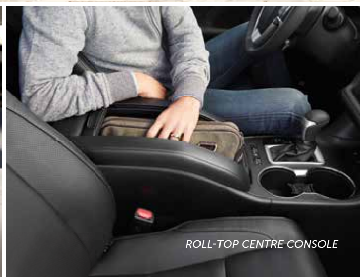
ROLL-TOP CENTRE CONSOLE