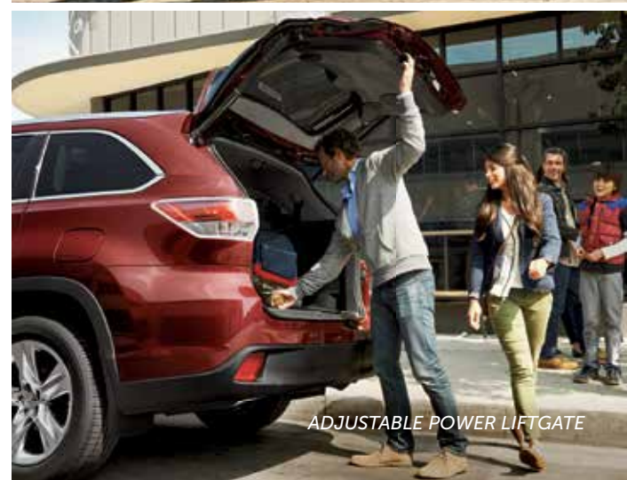
ADJUSTABLE POWER LIFTGATE