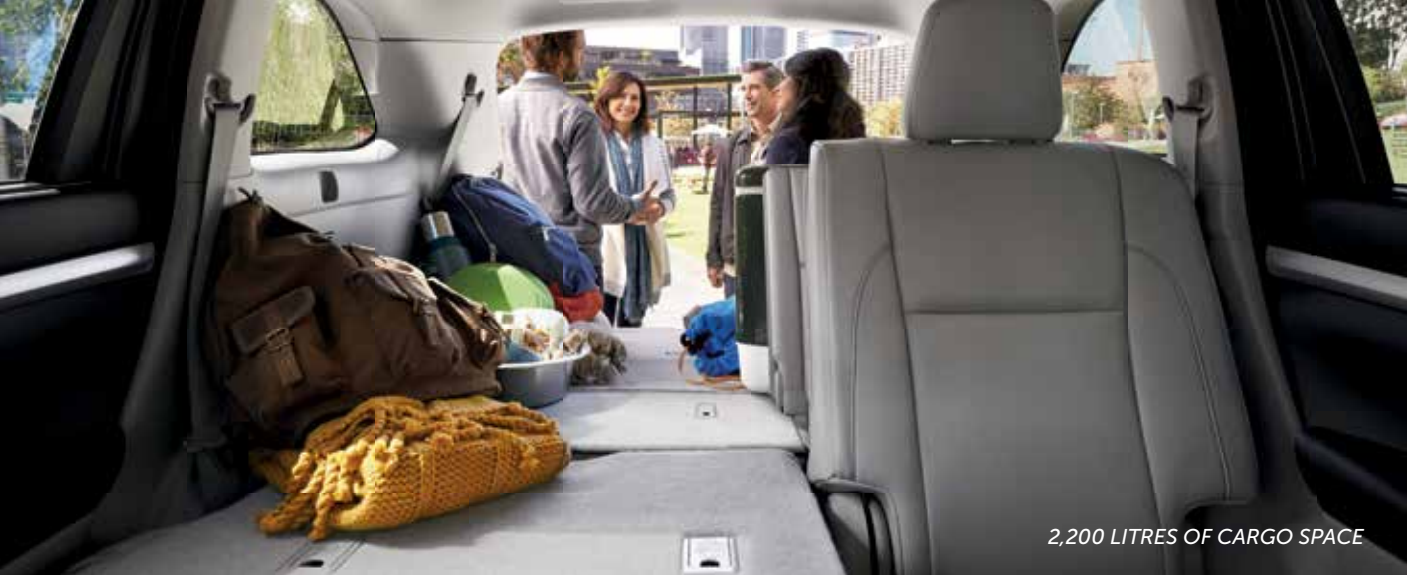
2,200 LITRES OF CARGO SPACE