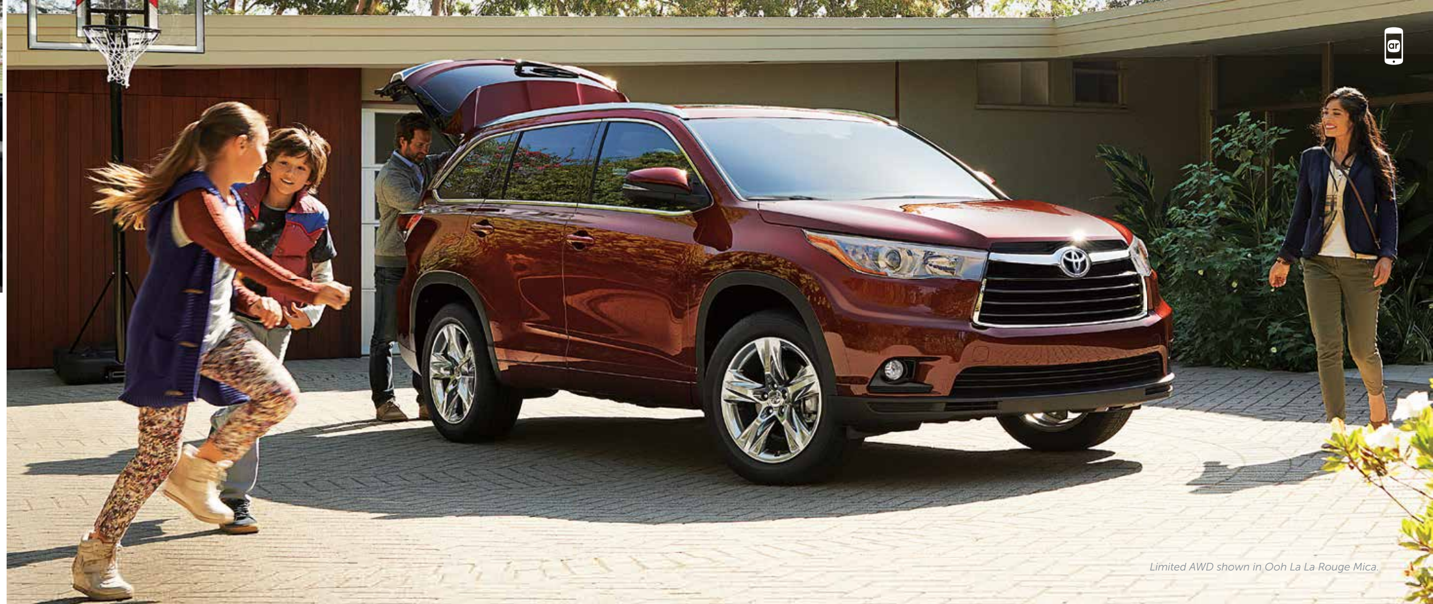
Limited AWD shown in Ooh La La Rouge Mica.

Highlander offers exceptional versatility to adapt to your ever-changing plans. For starters, the available power liftgate has an innovative height-adjustment memory feature that can be easily set to open to your preferred height every time. Inside, it comfortably seats up to 8 passengers, while the Limited models seat up to 7. The 1-step second-row sliding seat function makes it incredibly easy for third-row seat passengers to enter and exit the vehicle. The second and third-row seatbacks also recline so passengers can unwind on those especially long trips. We've even left enough room for a convenient foldable side table on the available second-row captain seats. Wherever your imagination takes you today, Highlander is ready to get you there.