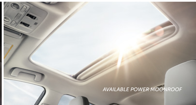
AVAILABLE POWER MOONROOF