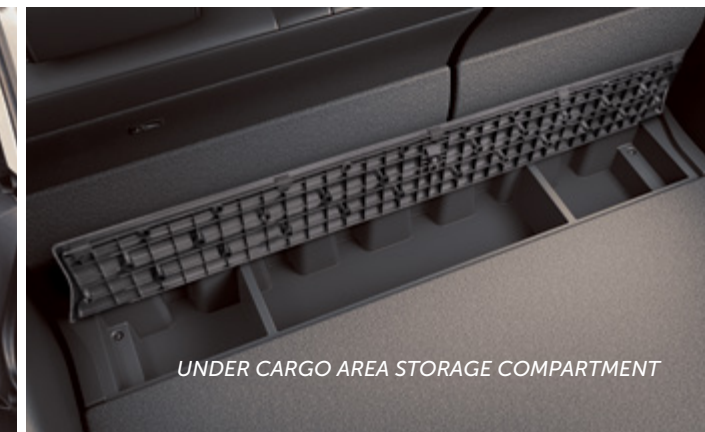
UNDER CARGO AREA STORAGE COMPARTMENT