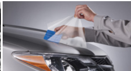
Paint Protection Film