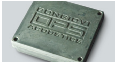
Bongiovi Acoustics DPS