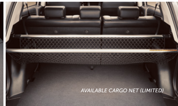
AVAILABLE CARGO NET (LIMITED)