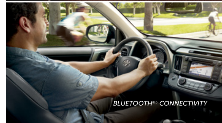
BLUETOOTH ®3 CONNECTIVITY