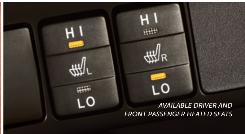
AVAILABLE DRIVER AND FRONT PASSENGER HEATED SEATS