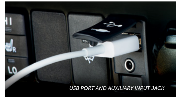
USB PORT AND AUXILIARY INPUT JACK

JBL® DISPLAY AUDIO SYSTEM 4 WITH NAVIGATION 5 The available JBL® Display Audio System 4 features a 6.1-inch touch-screen with Bluetooth ®3 wireless music streaming, and a unique "text-to-speech" feature that converts text messages from your phone into voice messages, which play through the vehicle's speaker system.