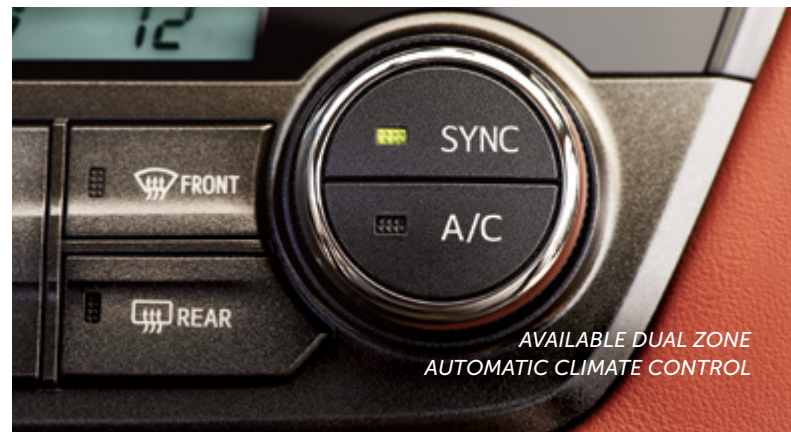
AVAILABLE DUAL ZONE AUTOMATIC CLIMATE CONTROL