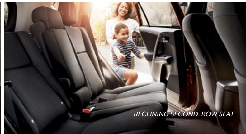
RECLINING SECOND-ROW SEAT