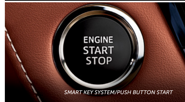
SMART KEY SYSTEM/PUSH BUTTON START