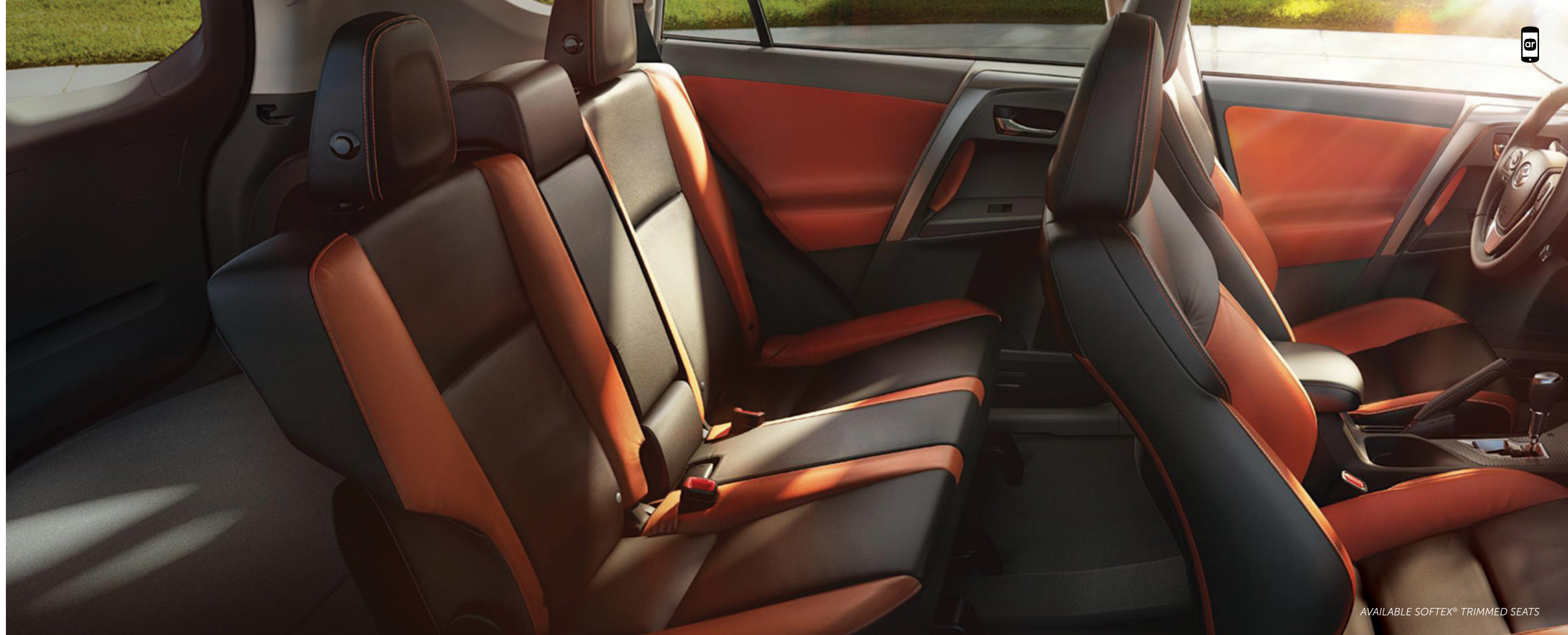
AVAILABLE SOFTEX® TRIMMED SEATS

Let's face it – we could all use a little more playtime. And the 2015 RAV4 will help you do just that. Its incredible styling, versatility, advanced technology, and enhanced features make every ride as exciting as the last. Its spacious interior offers added legroom for rear seat passengers, thanks to sleek front seatbacks. An acoustic glass windshield, and sound absorption materials featured throughout the vehicle help to prevent noise from entering the cabin, creating a whisper-quiet ride. With thoughtful interior features, available French stitching on the premium seats, metallic-toned gauges, and an available illuminated front cupholder, RAV4 offers an interior that's so cozy you won't want the ride to end, even on those really long road trips.