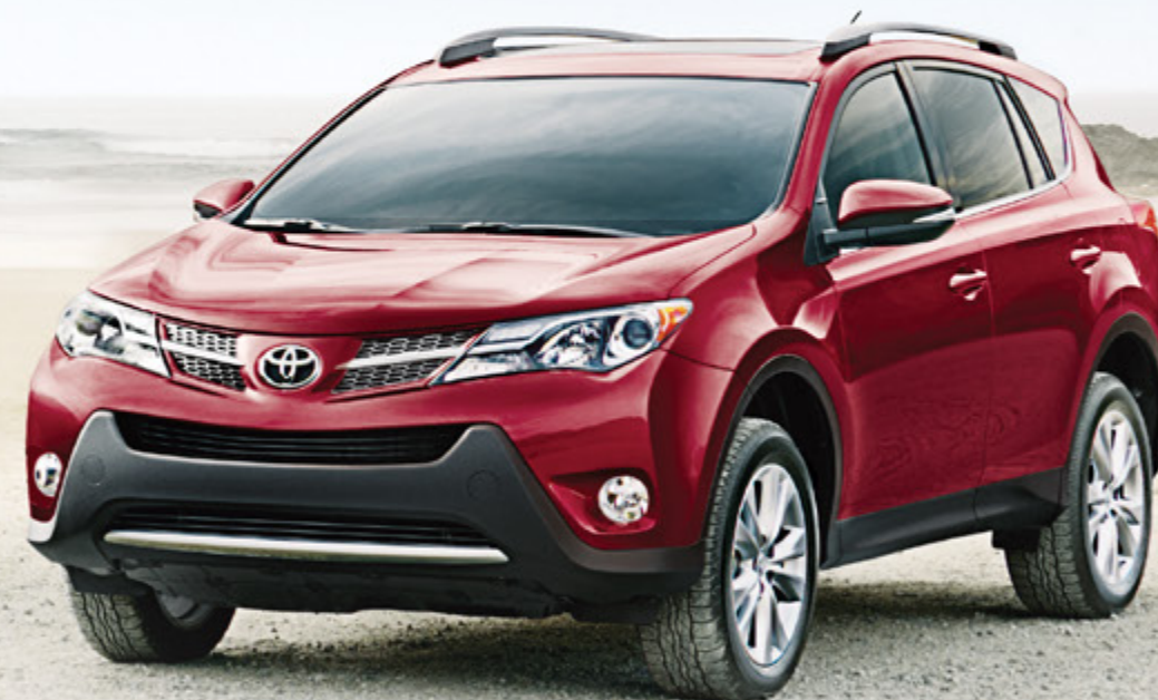
RAV4 LE with Upgrade Package shown in Black. XLE shown in Blue Crush Metallic. Limited shown in Barcelona Red Metallic.