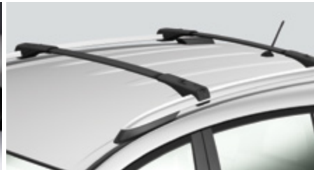
Roof Rack - Cross Bars