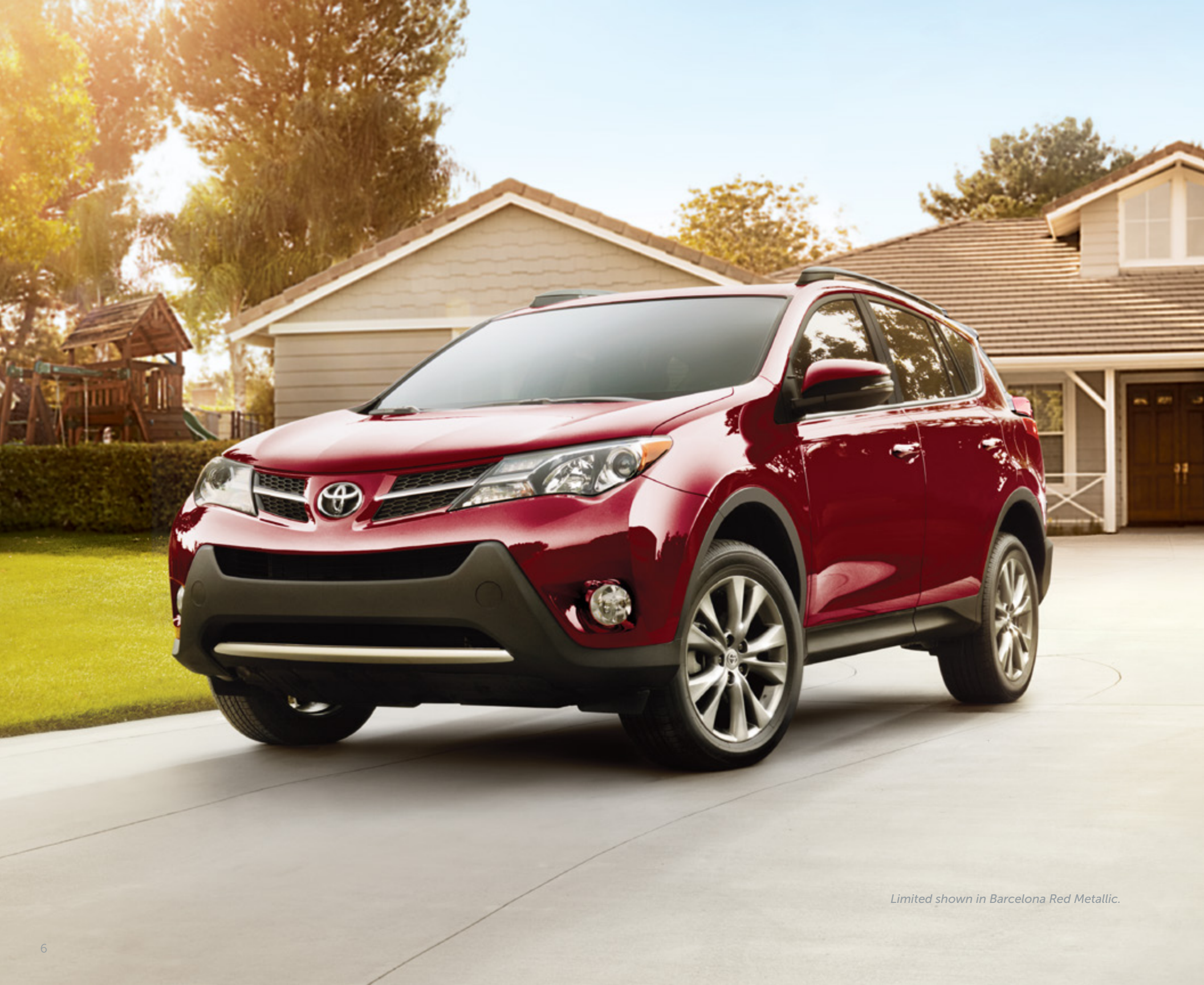
Limited shown in Barcelona Red Metallic.