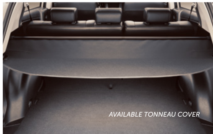
AVAILABLE TONNEAU COVER

Some of the best adventures happen at the last minute. RAV4 is flexible, with rear seatbacks that easily fold flat to create an impressive 2080 litres of cargo space.