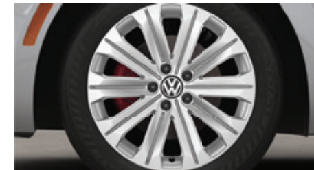
18" Spokane wheel