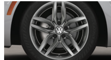
17" Helix wheel