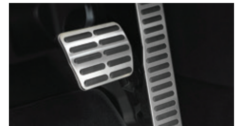
Sport pedal cap set