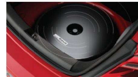
Spare tire subwoofer