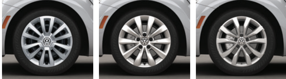
16" Propeller steel wheel TL+