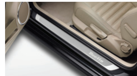
Door sill protection trim with logo