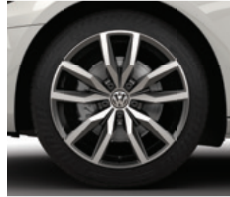
18" Lisboa alloy wheel HL