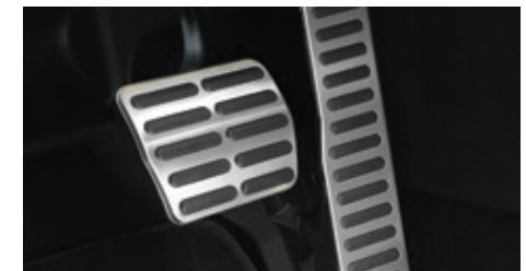
Sport pedal caps