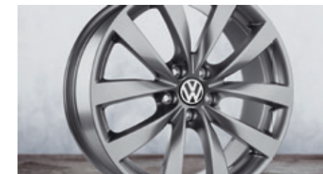
19" Sagitta wheel