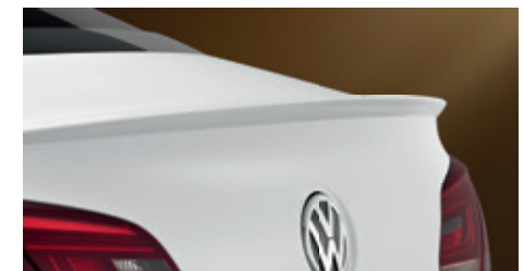
Rear lip spoiler