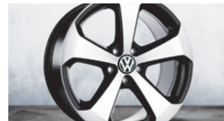
18" Thunder wheel