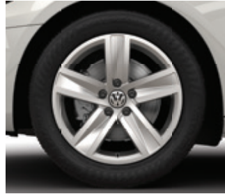
17" Kent alloy wheel SL