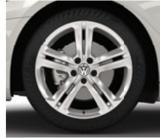
18" Mallory alloy wheel SL/HL R-Line Package