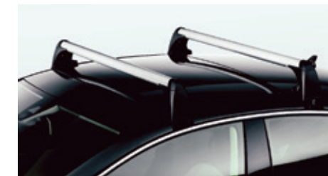
Base carrier bars