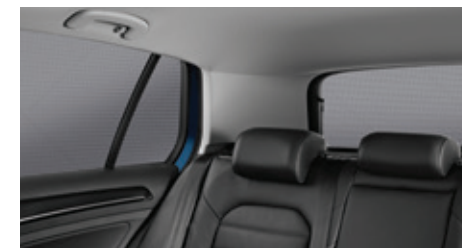
Rear and hatch window sunshades