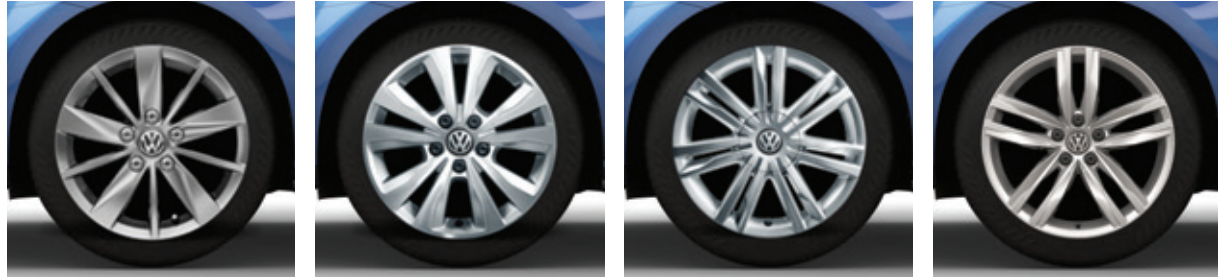
15" Lyon alloy wheel TL