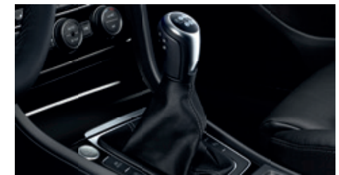
Gear shift knob