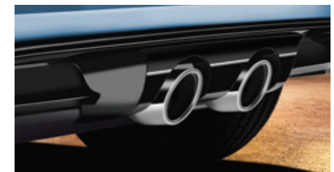
Rear valance – centre twin-exit exhaust