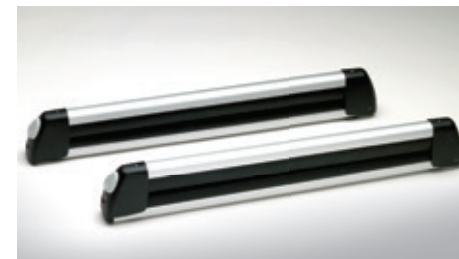
Base carrier bars and snowboard/ ski attachment