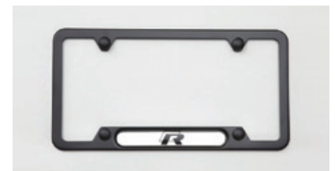
Licence plate frame

Select accessories shown on 2015 Golf but are available for and compatible with the 2016 Golf R.