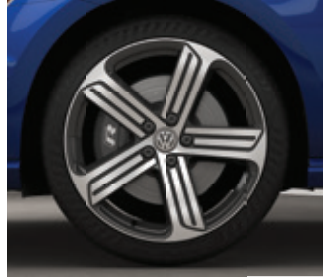
19" Cadiz alloy wheel 5-door