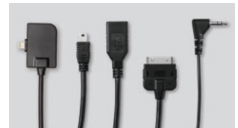
USB to Apple® Lightning connector