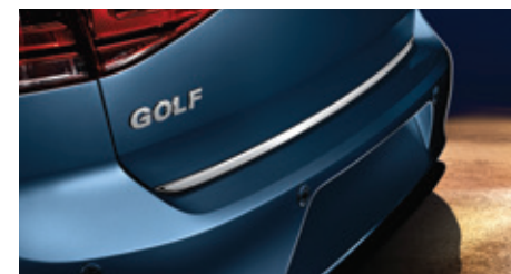
Chrome rear accent strip