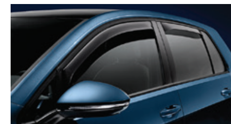
Side window deflectors