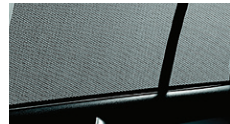
Rear and hatch window sunshades