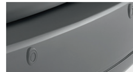
Park Distance Control