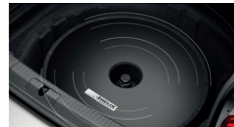
Spare tire mount subwoofer