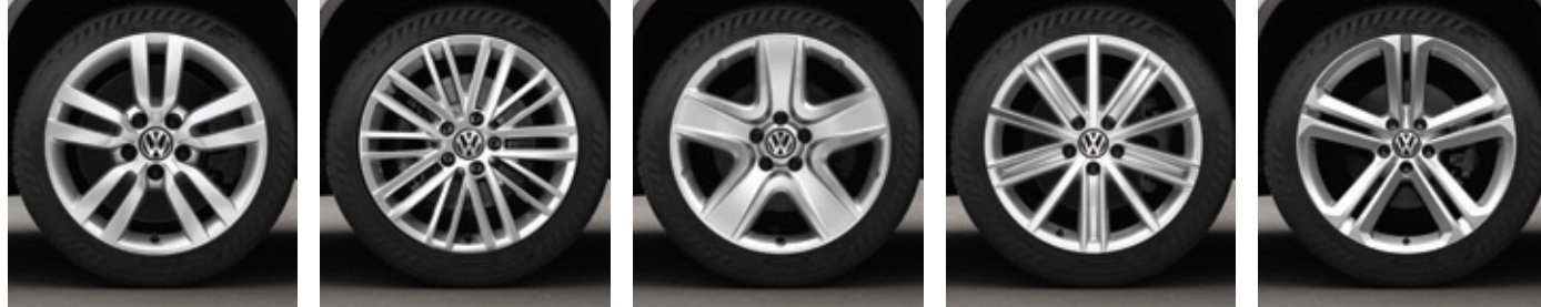
16" Portland alloy wheel TL 17" Fortaleza alloy wheel SE 18" Pasadena alloy wheel CL 18" New York alloy wheel HL 19" Mallory alloy wheel HL R-Line Package