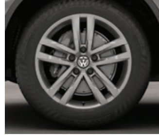
19" Salvador alloy wheel HL