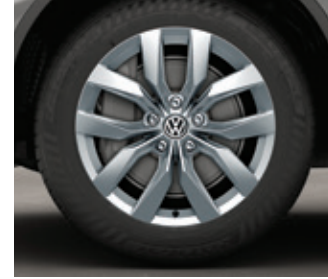
20" Masafi alloy wheel EL