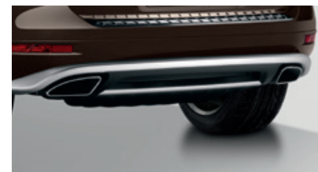
Chrome-look rear accent strip