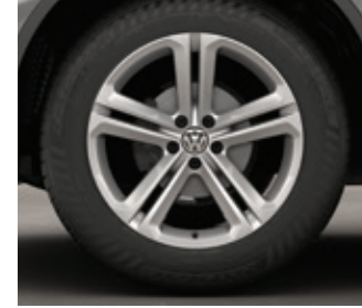
20" Mallory alloy wheel HL/EL R-Line Package