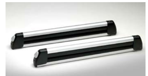
Base carrier bars and snowboard/ski attachment