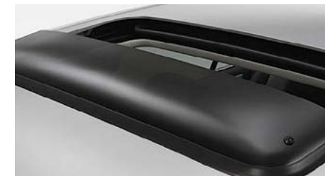
Sunroof air deflector