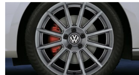
18" Rotary wheel