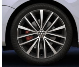
17" Joda Black alloy wheel GLI