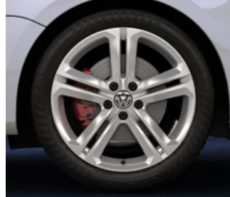
18" Mallory alloy wheel Autobahn