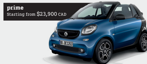
prime Starting from $23,900 CAD