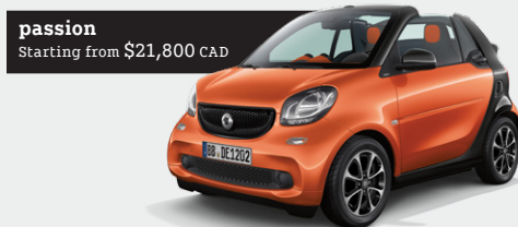
passion Starting from $21,800 CAD