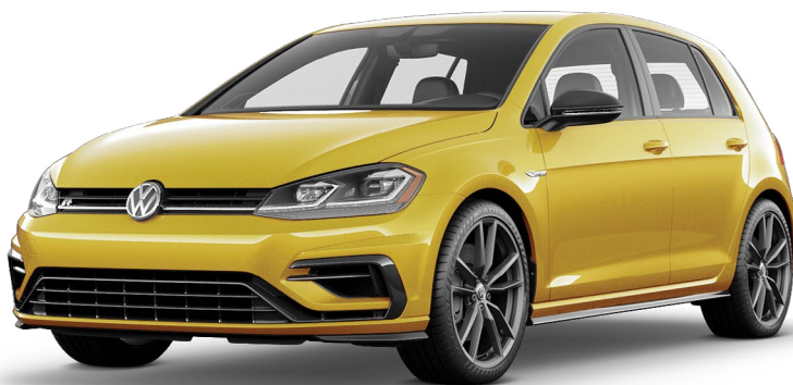
Golf R in Ginster Yellow with 19" Pretoria alloy wheels

Adjust suspension and steering stiffness according to road conditions and driving style. Set the optimal ride with your choice of preset driving modes, or mix and match to create your own.