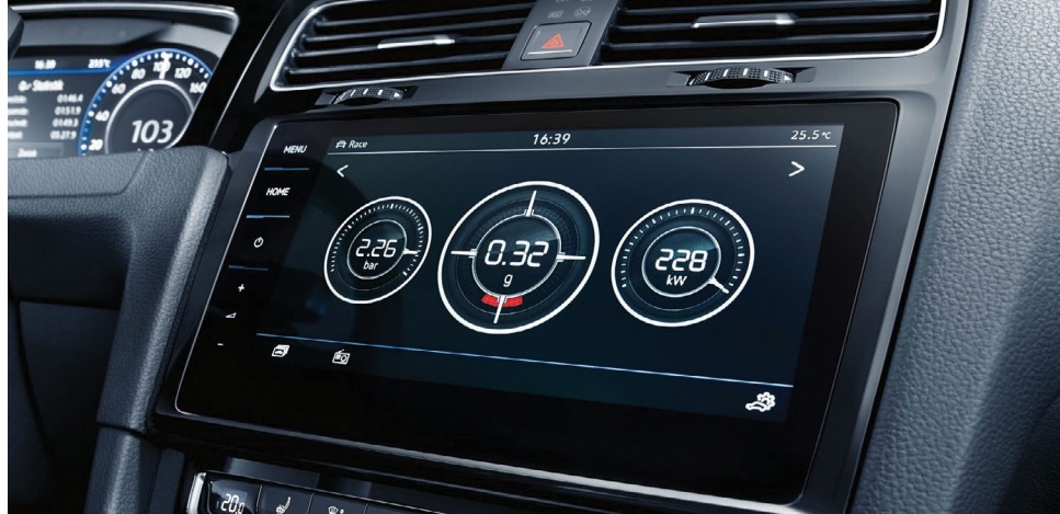
8.0" touchscreen infotainment system

*Please drive safely and obey all traffic laws, including speed limits.