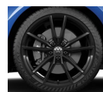
19" Pretoria black alloy wheels (Black Styling Package)