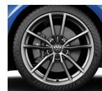
19" Pretoria alloy wheels