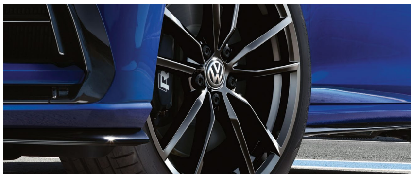
Golf R in Lapiz Blue Metallic with 19" Pretoria alloy wheels