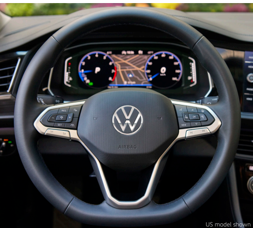
US model shown

The Jetta comes equipped with a variety of features to help keep you confident behind the wheel. Hit the road with confidence, thanks to driver assistance features like Front Assist with Autonomous Emergency Braking and Pedestrian Detection † and available Blind Spot Monitor with Rear Traffic Alert.