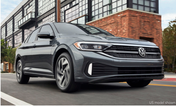
US model shown