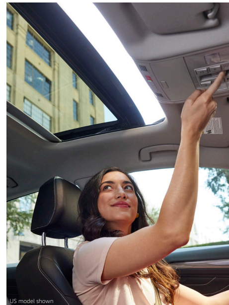
US model shown

Stand out with standard features like LED headlights, heated front comfort seats, and 16" alloy wheels—or step up to the available Sport Package and make a real statement with premium options like Jetta's Rail 2 Rail Power Sunroof, 10-colour interior Ambient lighting, Sport bumper, and Volkswagen Digital Cockpit Pro.