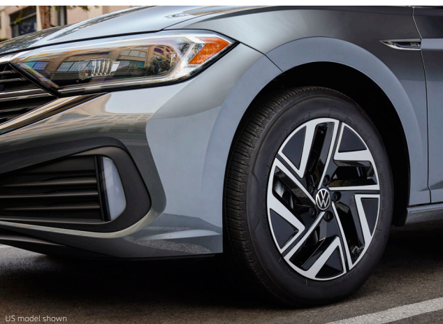
US model shown

Titan Black Leather HL Vulcano Brown with Titan Black inserts Leather HL