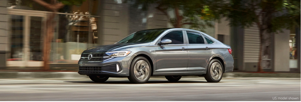
US model shown