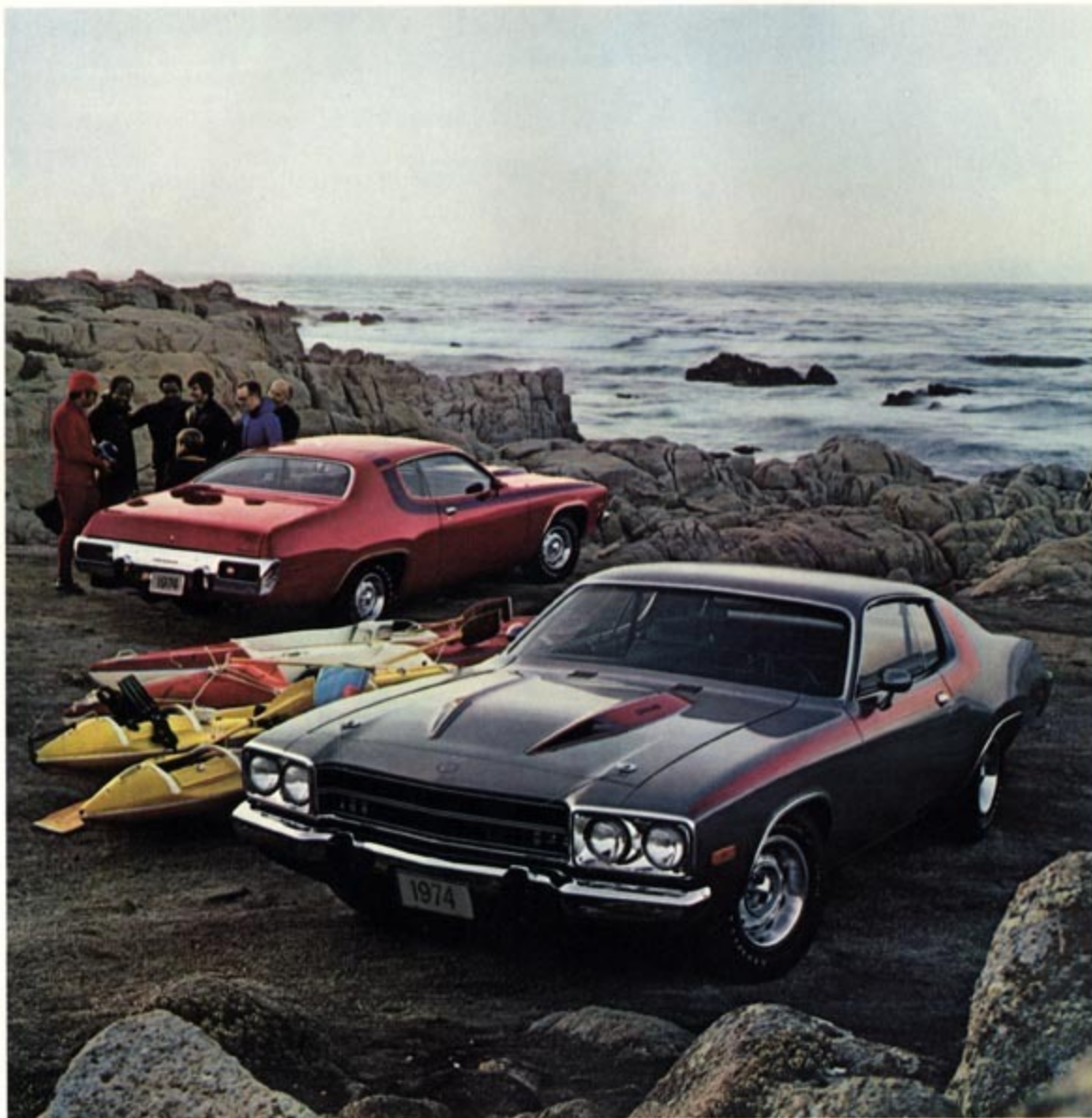
Road Runner Coupe

The 1974 Road Runner standard simulated wood-grain rallye cluster, and standard and optional interiors are described in the captions below.