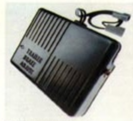
Trailer Brake Controller