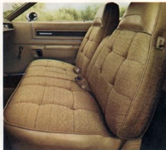
Optional Sebring-Plus Cloth-and-vinyl Bench Seat.

This handsome cloth-and-vinyl split-back bench seat interior also offers the added convenience of a fold-down center armrest. In addition, wall-to-wall carpeting is keyed to match any of the four available colors—blue, green, black or gold.