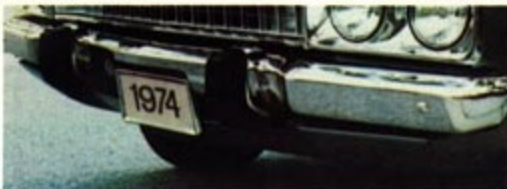
Bright Bumper Guards—Front