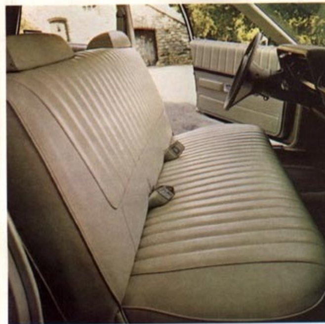
Optional Satellite Custom All-vinyl Bench Seat. You can enjoy the comfort of this 1974 Satellite Custom all-vinyl bench seat in a choice of six colors: blue, green, parchment, chestnut, black or gold. With this interior, wall-to-wall carpeting is color-keyed to match or complement the seat color.