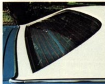
Electric Rear-window Defroster