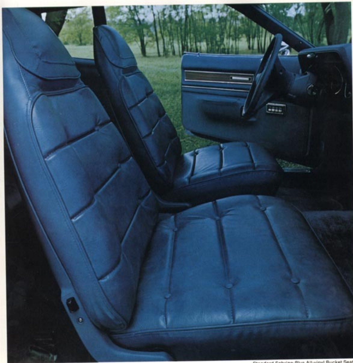
Standard Sebring-Plus All-vinyl Bucket Seats

The first optional interior is the one shown at the bottom