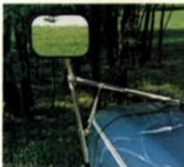
Trailer-Towing Mirrors (Dealer Installed)