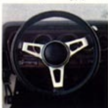
"Tuff" Steering Wheel