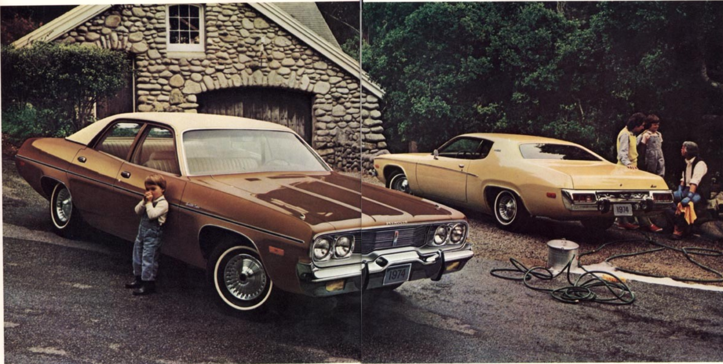
Foreground: Satellite Custom 4-Door Sedan

And don't forget, you can add to the enjoyment of owning a Satellite with some comfort and convenience options like air conditioning . . . TorqueFlite automatic transmission . . . Automatic Speed Control . . . and power steering. They'll make Satellite ownership even more pleasurable and help increase the value of the car at trade-in time.