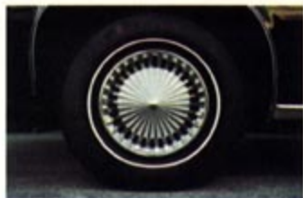
Steel-belted, Radial-ply Tires

"Tuff" Steering Wheel. A sporty addition to any Satellite. Sun Roof. A great way to get that convertible feeling without having those convertible problems.