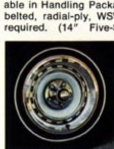
Chrome-styled Road Wheels