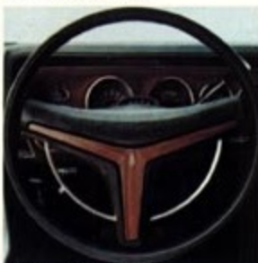
Deluxe Steering Wheel

Bright Bumper Guards. Available for the front and rear.