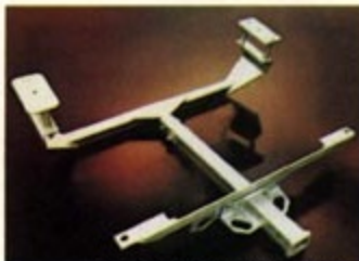
Load-distributing Hitch Platform