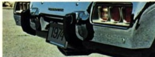
Bright Bumper Guards—Rear