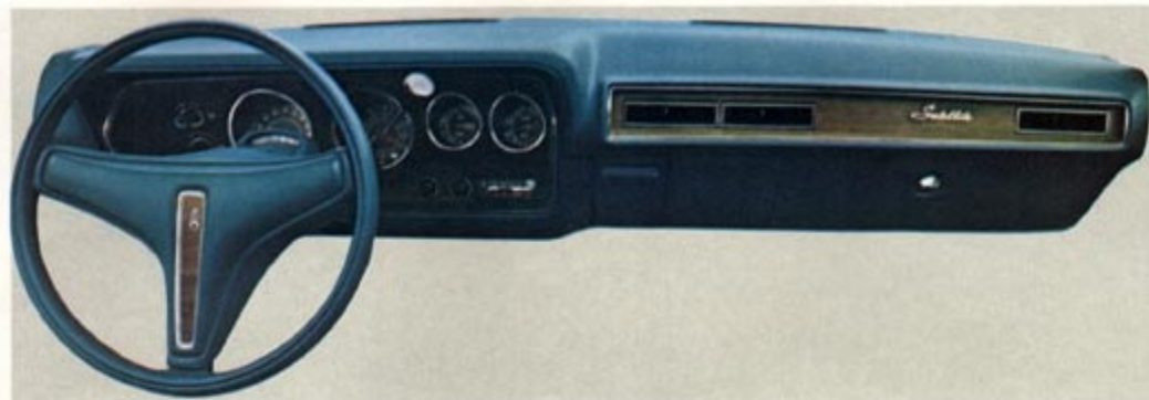
Sebring-Plus Instrument Panel

The second optional Sebring-Plus interior, shown on page 11, is a special Wimbledon style. Besides the red/white cloth-and-vinyl bucket seats, this interior comes with sexy red shag carpeting (black if you have a floor-shift manual transmission without console) and includes either an optional center cushion with folding armrest or a console.