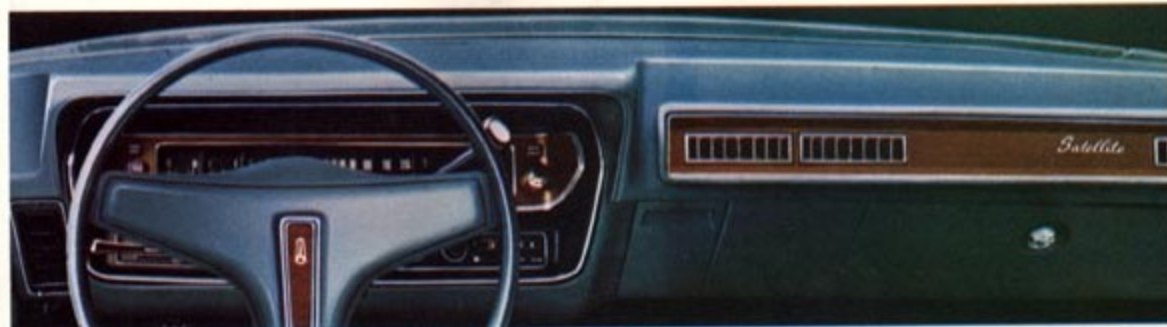
Satellite Custom Instrument Panel