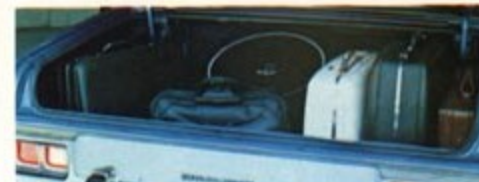
1974 Satellite Custom's trunk can accommodate a family's vacation needs with ease. Holds 18.2 cubic feet of suitcases, golf bags and what-have-you.