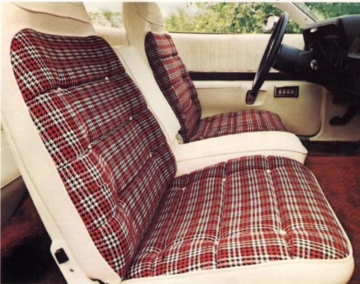
Road Runner Optional Interior

Optional Road Runner cloth-and-vinyl bucket seats in a red-and-white Wimbledon style. Other seating for Road Runner: an all-vinyl bench seat in blue, green, black, gold, or parchment. All-vinyl bucket seats in blue, green, black, gold or white. The standard Road Runner interior is an all-vinyl bench seat in blue, green or black.