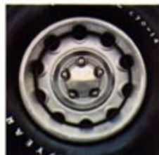
Rallye Road Wheels