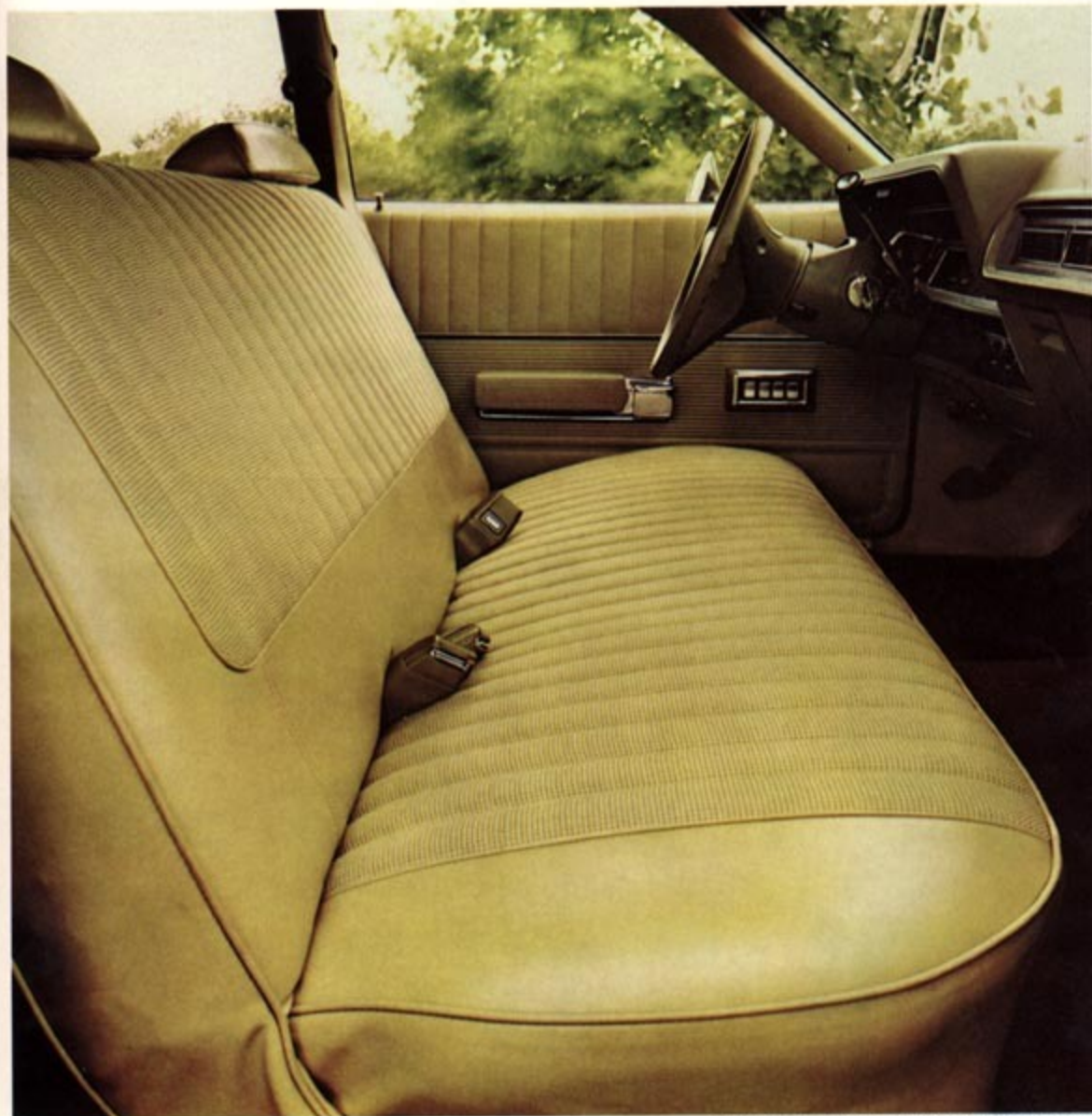
Standard Satellite Custom Cloth-and-vinyl Bench Seat

Standard seat for the Satellite 4-Door Sedan is an all-vinyl bench seat in blue, green or chestnut; while the standard seat for the Satellite Coupe is an all-vinyl bench seat that comes in blue, green or black. Ask your dealer to show you these two interiors.