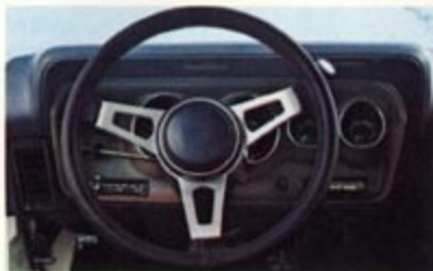
Road Runner Rallye Cluster

The Road Runner comes with a standard simulated wood-grain rallye cluster. Switches and controls are located on the left, while gauges and indicators are on the right. Space is provided for either an optional tachometer or clock. Two optional steering wheels are available: One is a three-spoke luxury type with soft center pad, wood-grain vinyl inserts on all spokes, and a horn ring; the other is our soft-rim "Tuff" steering wheel, shown at left, for those who want a sportier style.