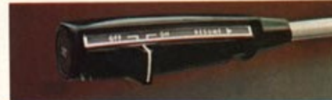
Optional Automatic Speed Control. Allows you to select or resume a desired speed and maintain it automatically until you brake, accelerate or disengage it.