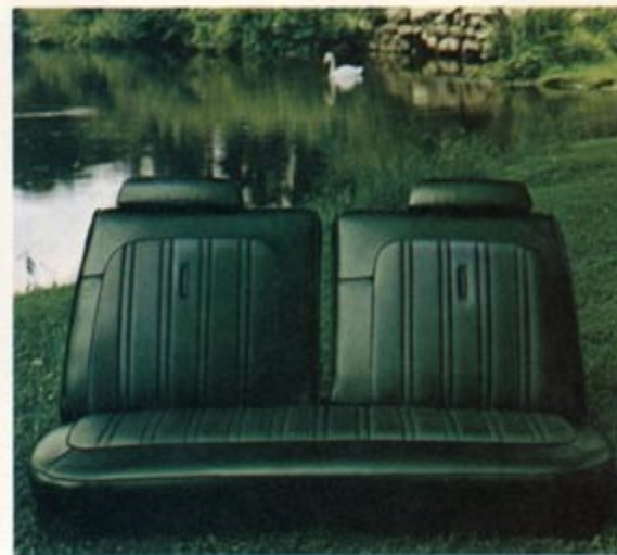
Optional Sebring All-vinyl Bench Seat.

This handsome cloth-and-vinyl split-back bench seat interior also offers the added convenience of a fold-down center armrest. In addition, wall-to-wall carpeting is keyed to match any of the four available colors—blue, green, black or gold.