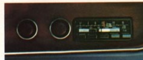
Optional AM/FM Radio. A great way to increase your choice of stations. Features five push buttons and is available with or without stereo.